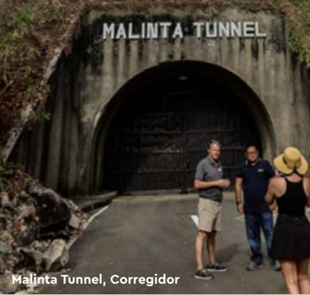
Malinta Tunnel, Corregidor

*$239 Taxes and fees per person are additional.