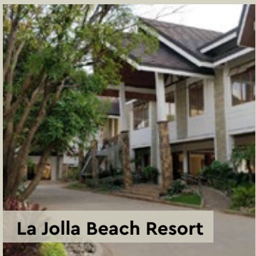
La Jolla Beach Resort