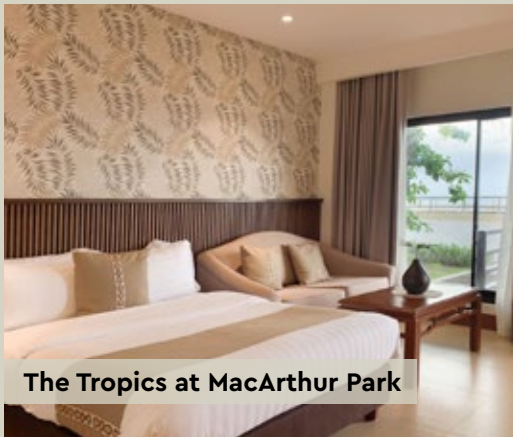
The Tropics at MacArthur Park