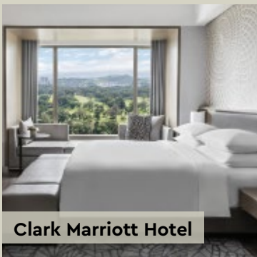
Clark Marriott Hotel