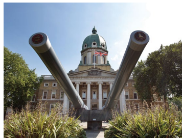
Imperial War Museum