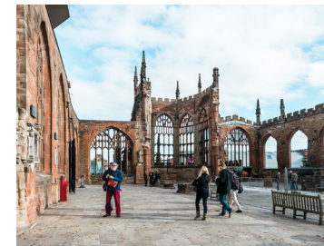
Cathedral Church of Saint Michael in Coventry