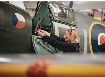
Guest at Shuttleworth Collection