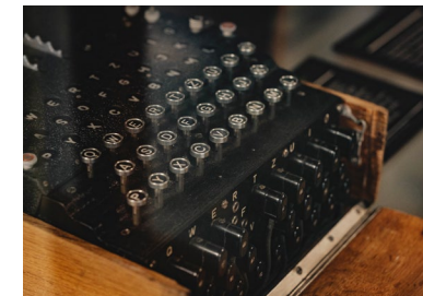
Enigma Machine at Bletchley Park