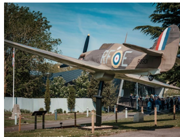
The Battle of Britain Bunker