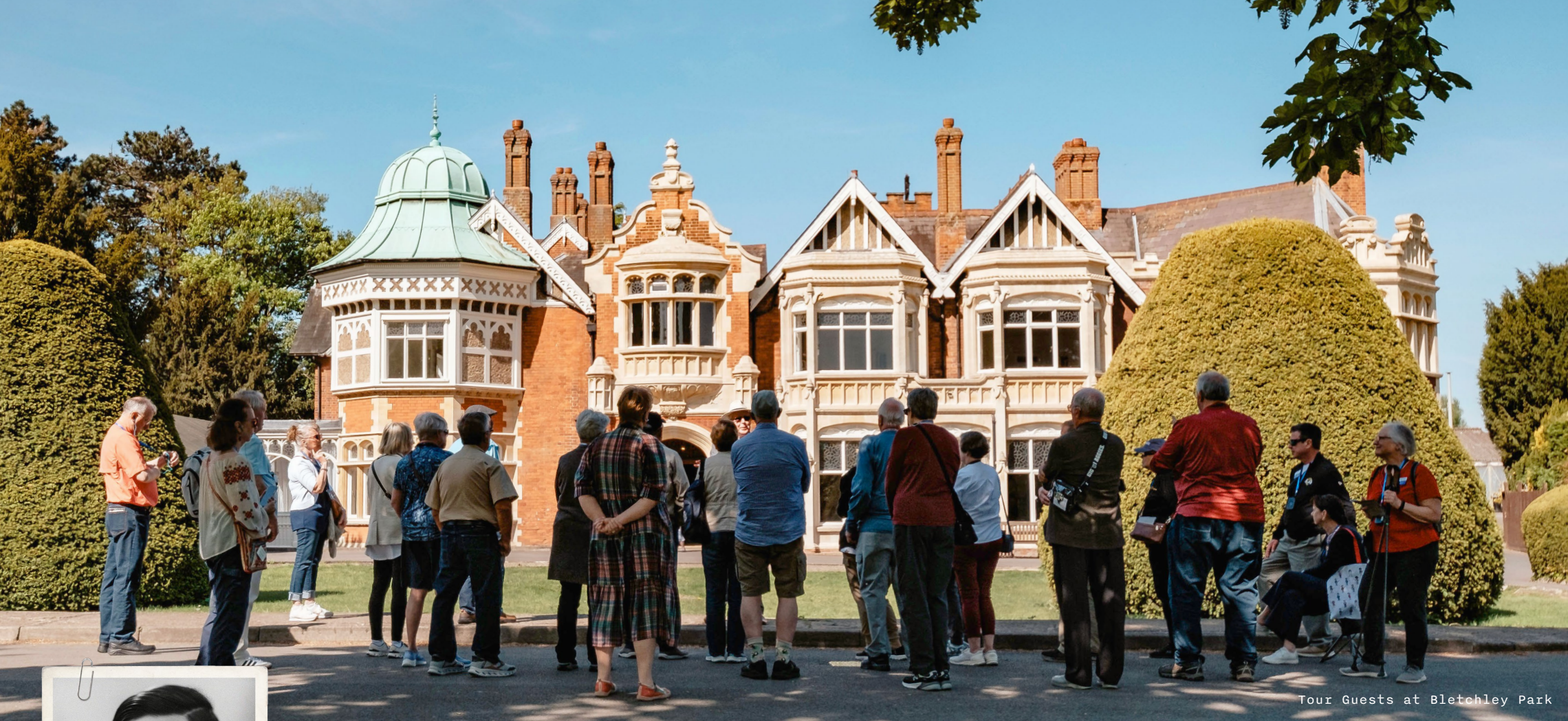
Tour Guests at Bletchley Park