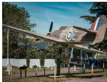
The Battle of Britain Bunker