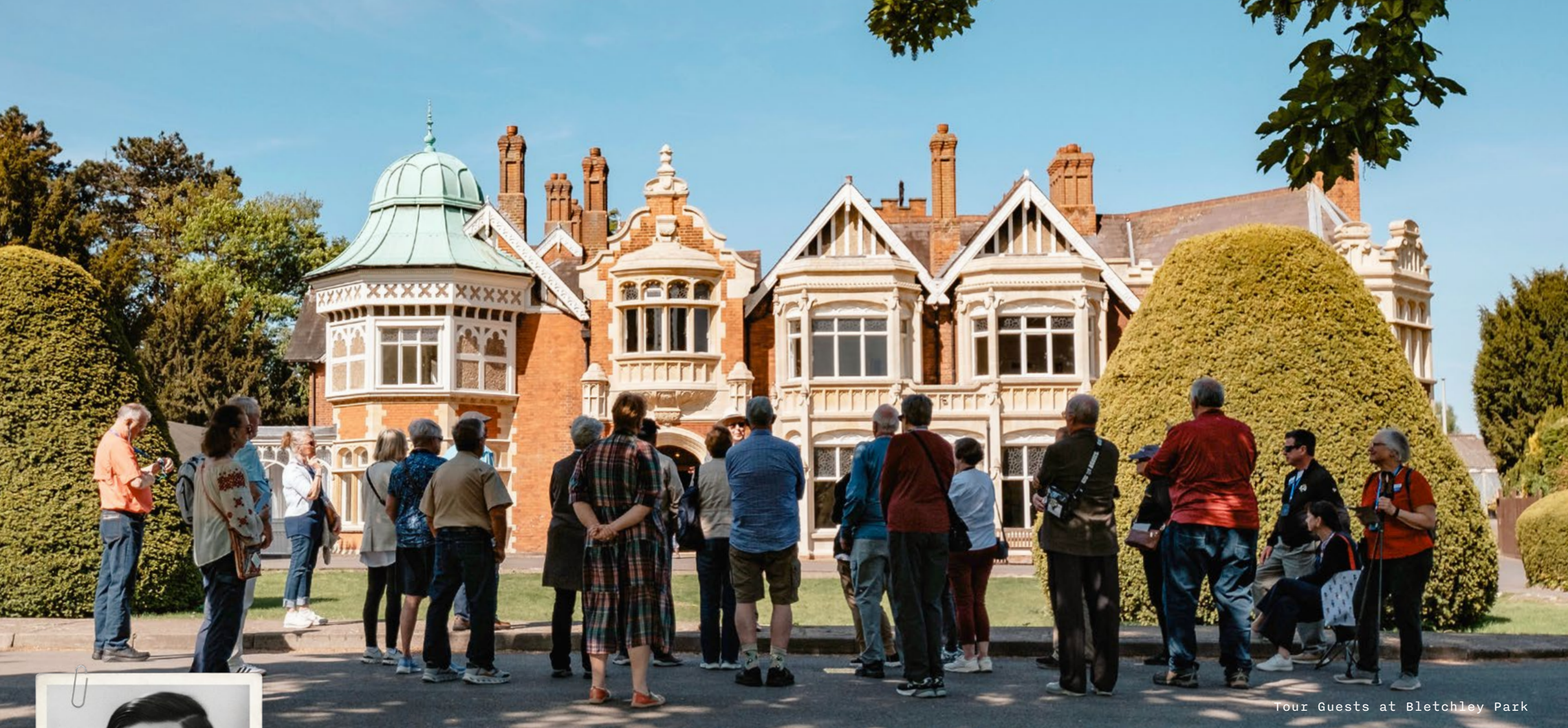
Tour Guests at Bletchley Park