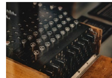
Enigma Machine at Bletchley Park