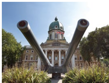
Imperial War Museum