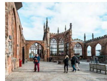
Cathedral Church of Saint Michael in Coventry