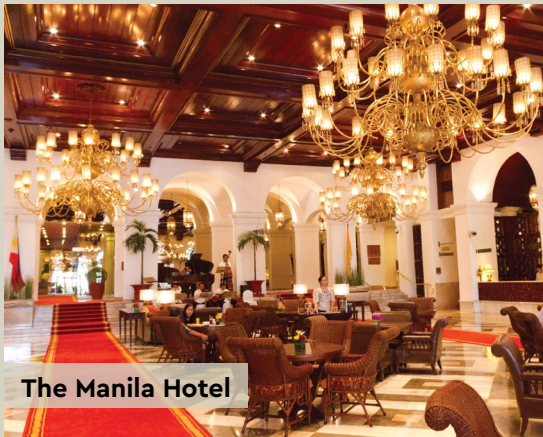
The Manila Hotel