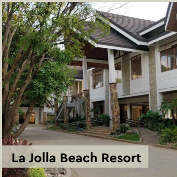
La Jolla Beach Resort