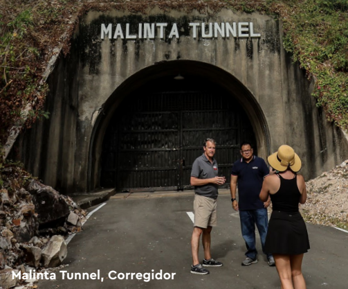
Malinta Tunnel, Corregidor

*$239 Taxes and fees per person are additional.