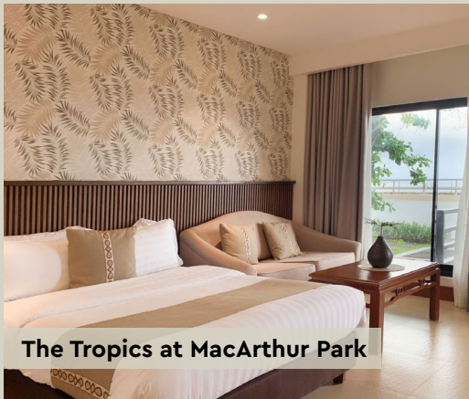
The Tropics at MacArthur Park