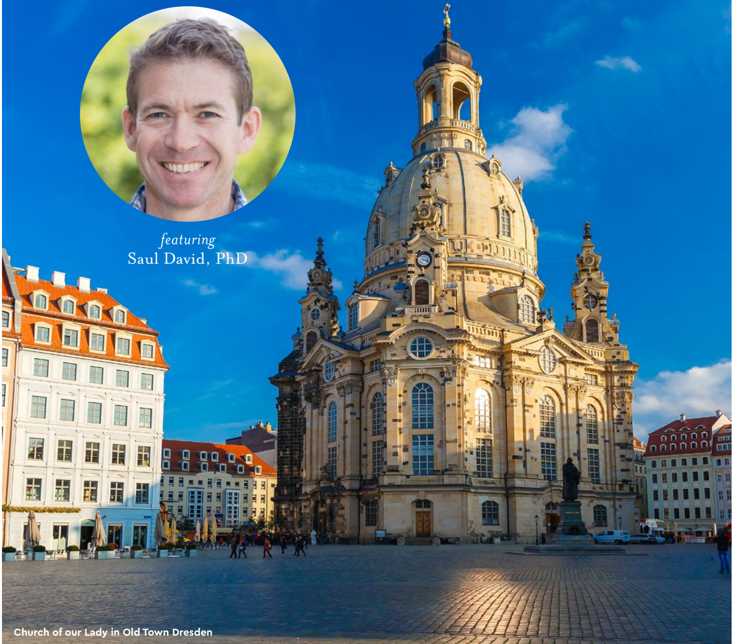
Church of our Lady in Old Town Dresden