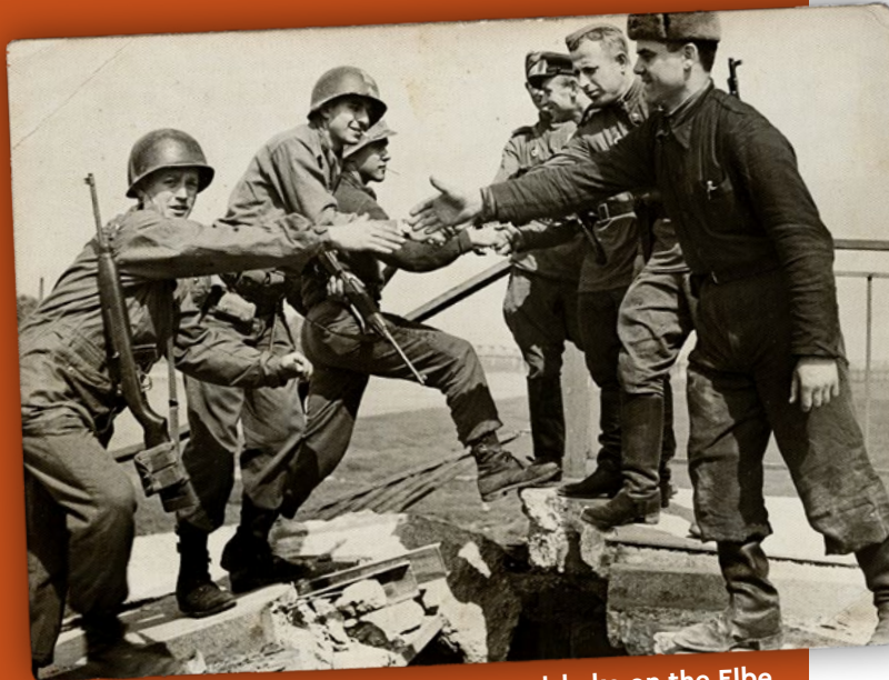
Handshake on the Elbe