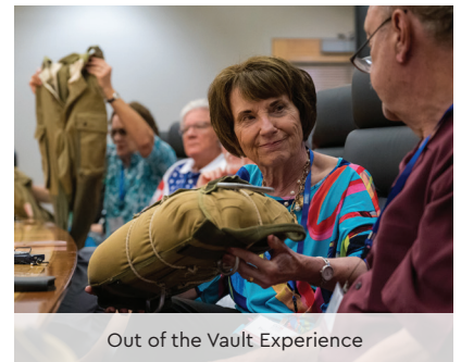
Out of the Vault Experience