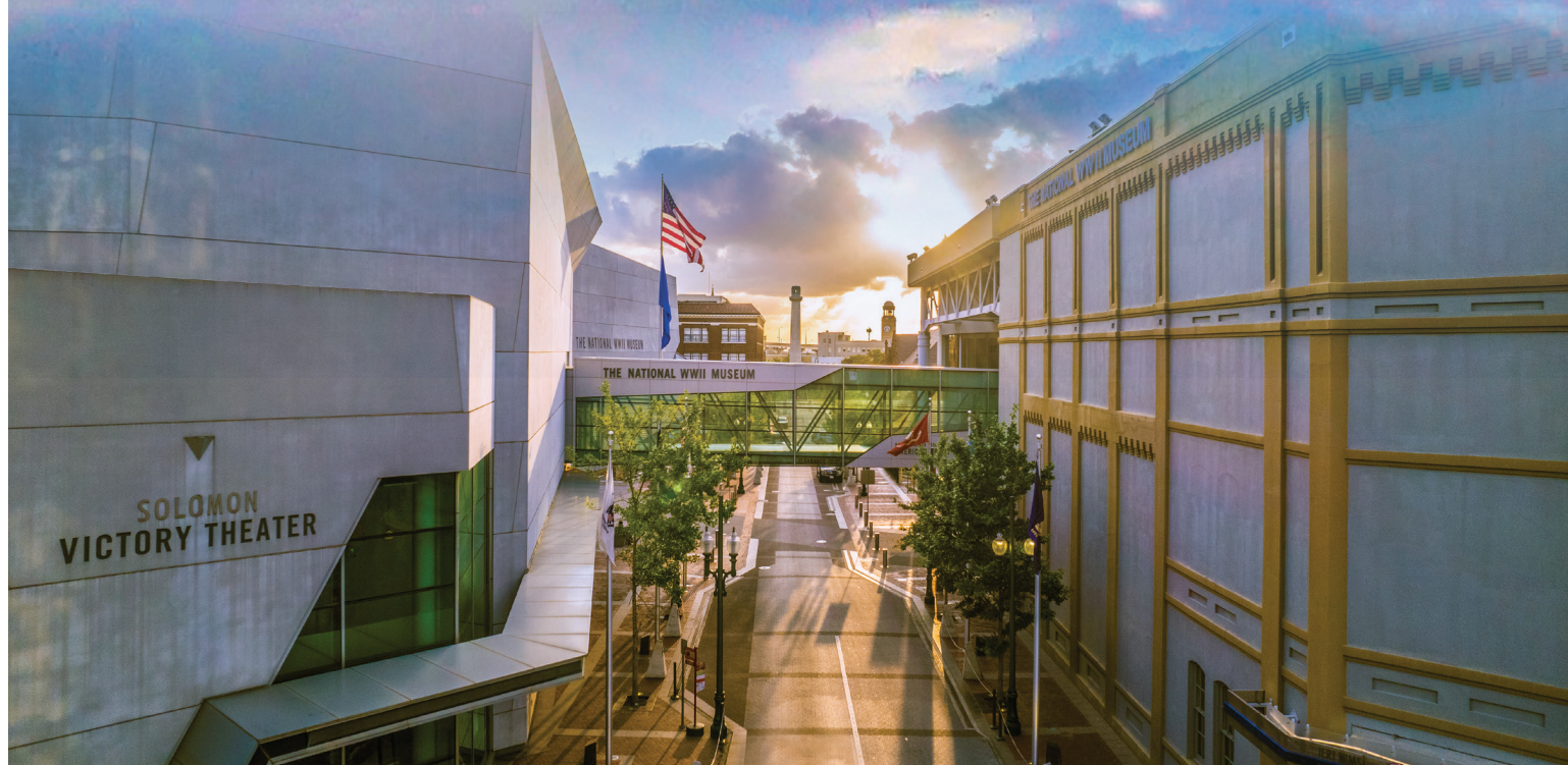
A view of Andrew Higgins Boulevard at The National WWII Museum