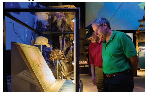
Road to Tokyo Galleries