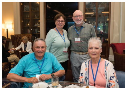
Welcome Reception in Patriots Circle Lounge