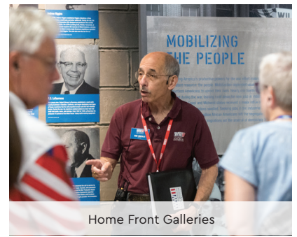
Home Front Galleries