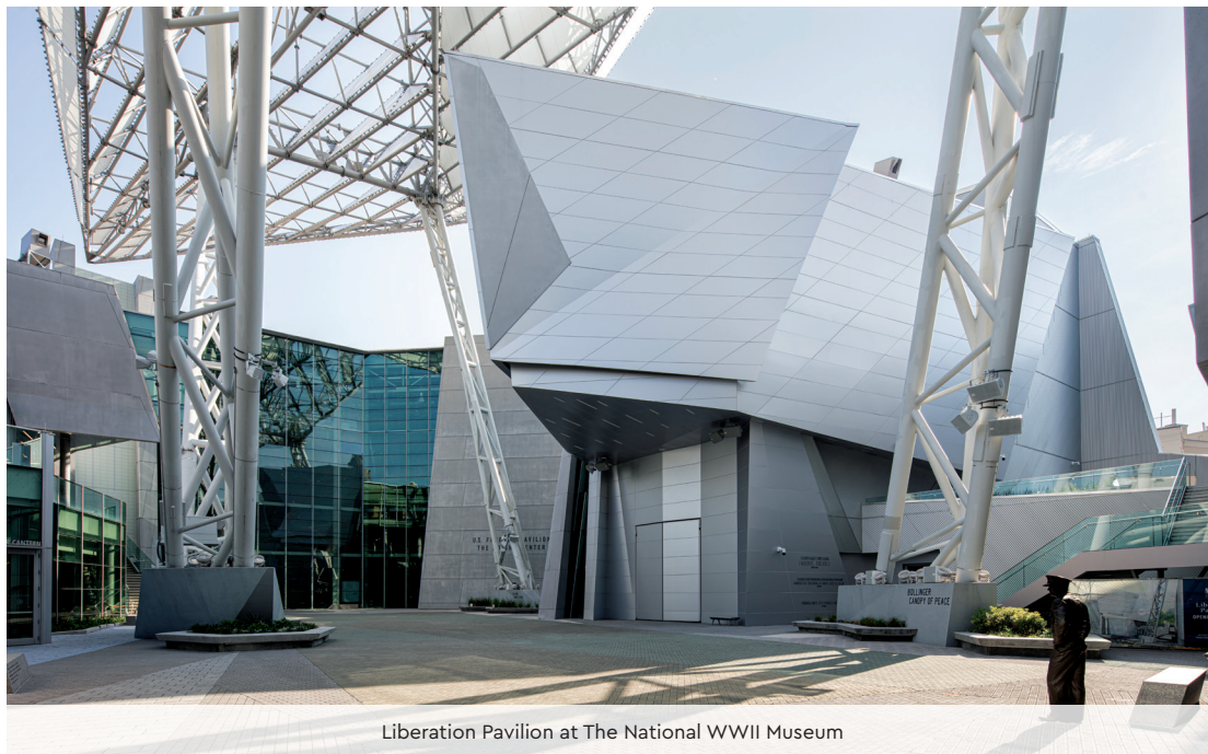
Liberation Pavilion at The National WWII Museum