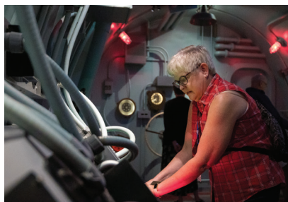
Final Mission: USS Tang Submarine Experience