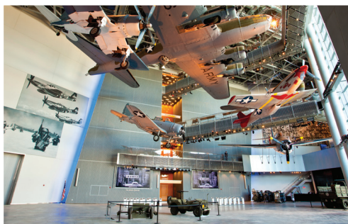
US Freedom Pavilion: The Boeing Center