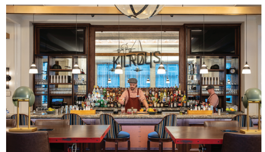
Kilroy's Restaurant and Bar

CALL: 1-877-813-3329 X 257 | EMAIL: TRAVEL@NATIONALWW2MUSEUM.ORG | VISIT: WW2MUSEUMTOURS.ORG