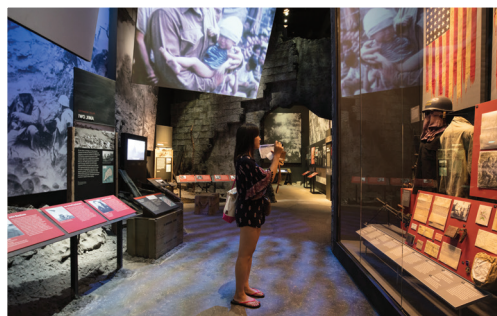
Road to Berlin Galleries