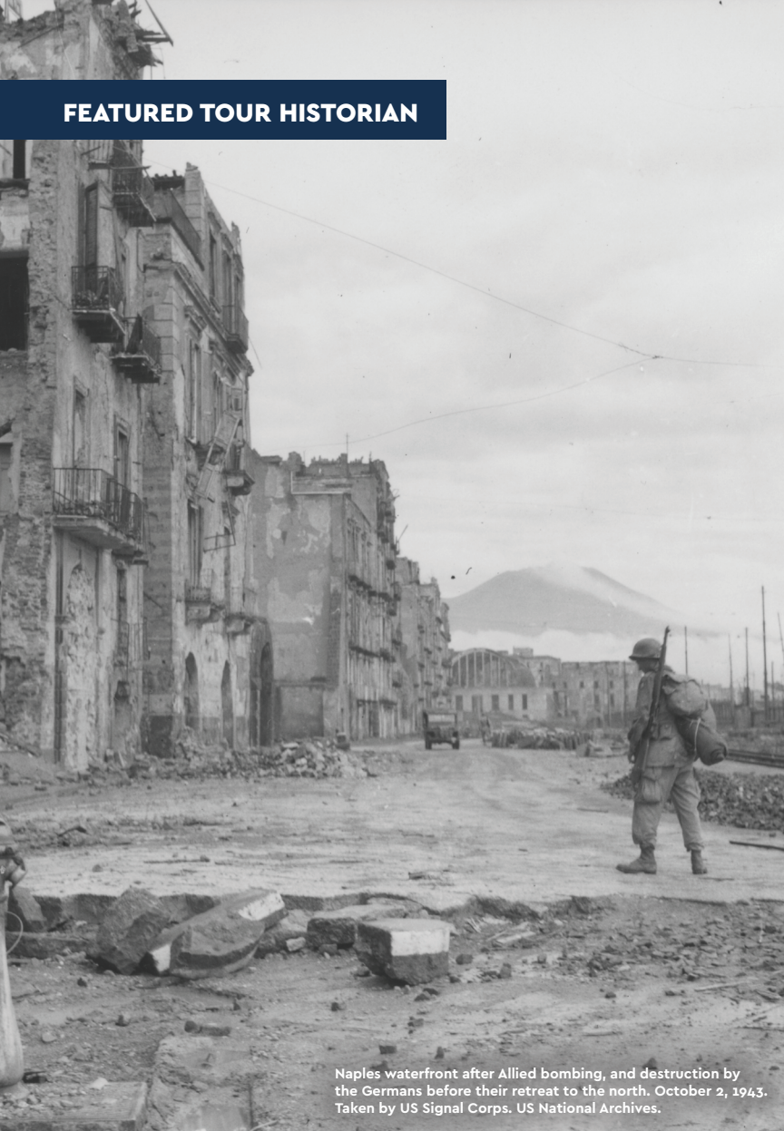
Naples waterfront after Allied bombing, and destruction by the Germans before their retreat to the north. October 2, 1943.