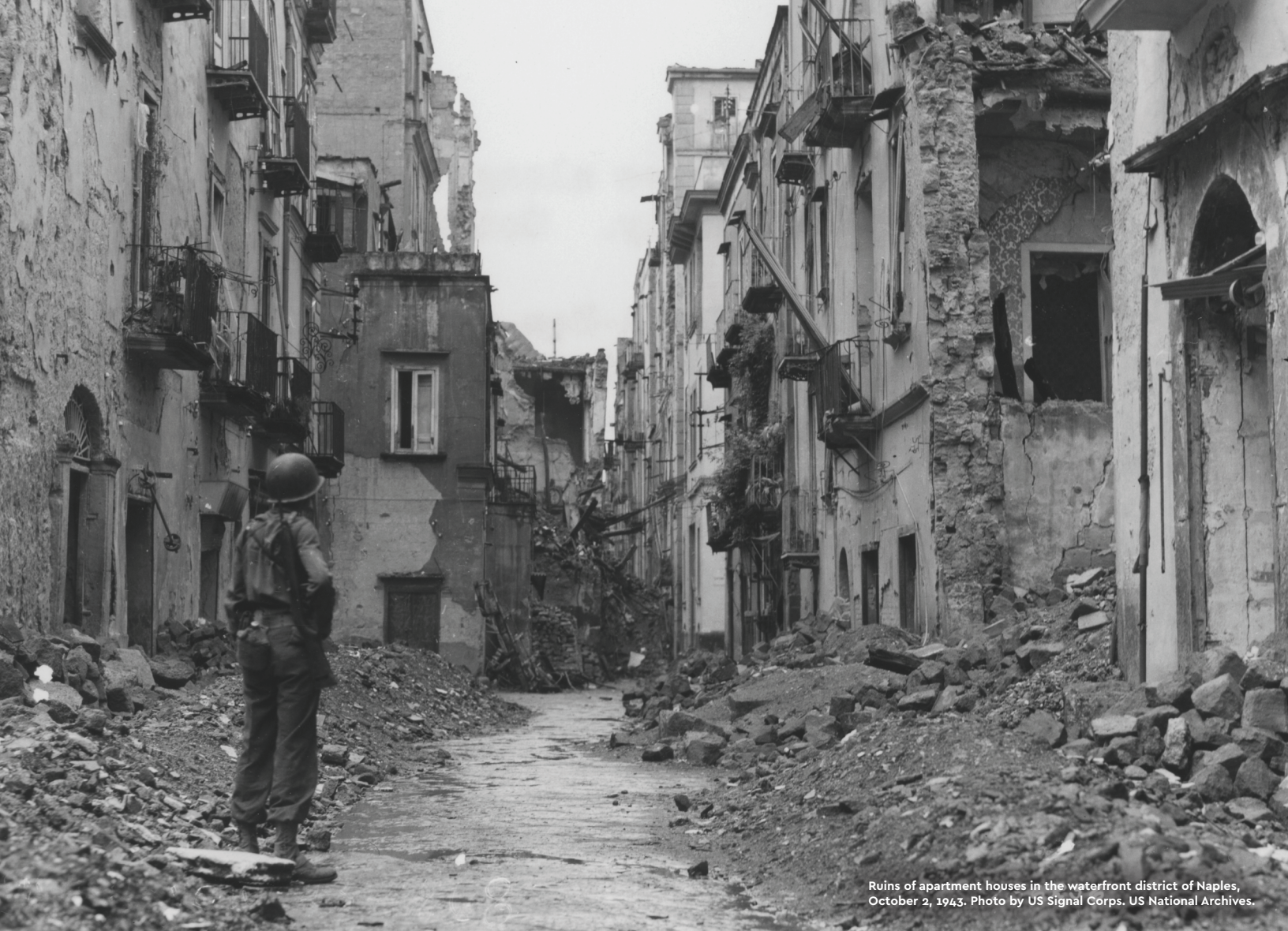
Ruins of apartment houses in the waterfront district of Naples, October 2, 1943.