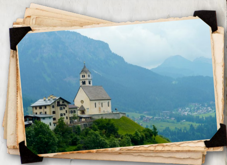
Colle Santa Lucia, Dolomites

Accommodations: Hotel Falkensteiner (B, Lecture)