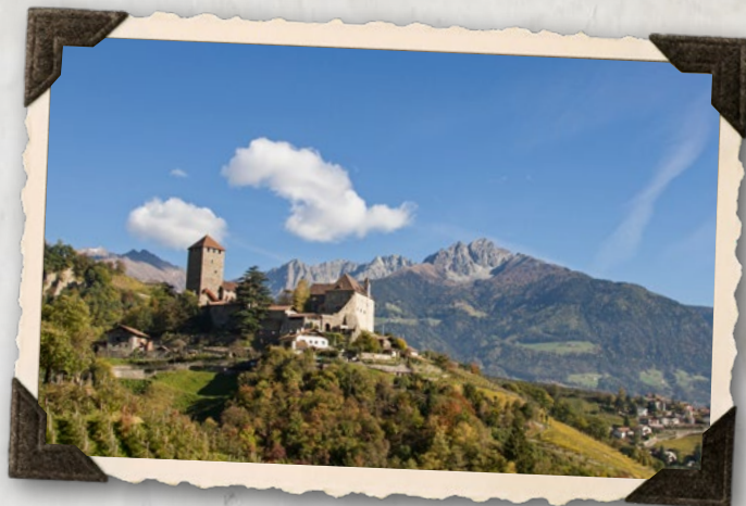
Tyrol Castle in Burggrafenamt near Merano

Accommodations: Hotel Falkensteiner (B, D)