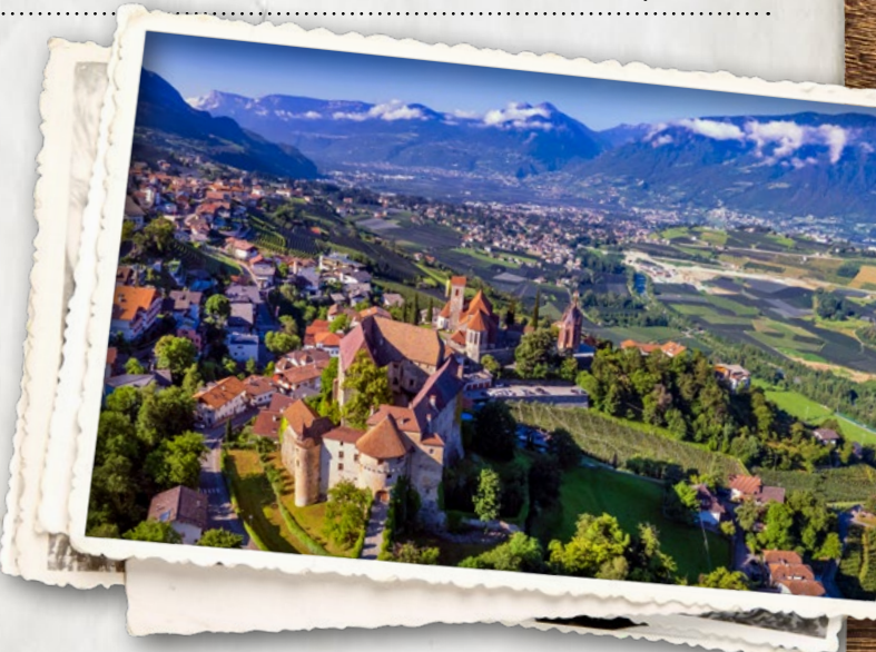
Alto Adige region