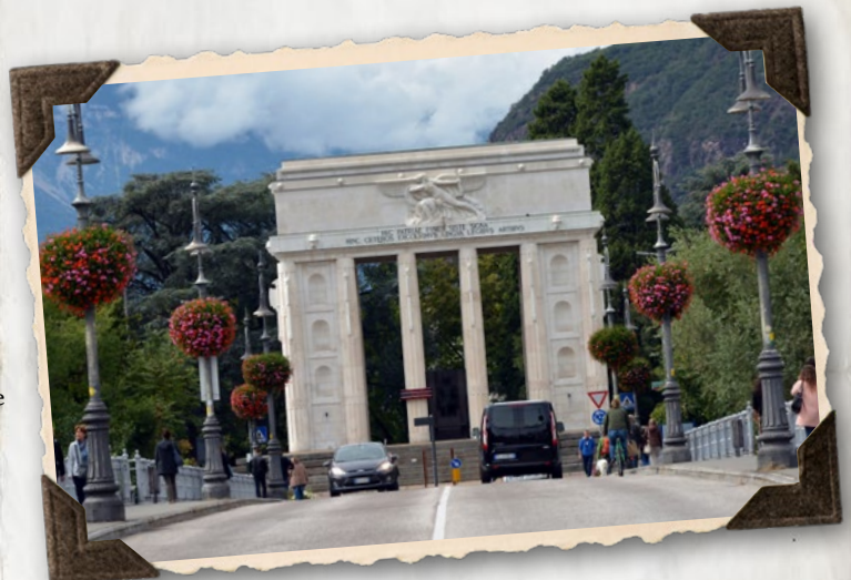
Victory Monument on the Victory Square in Bolzano