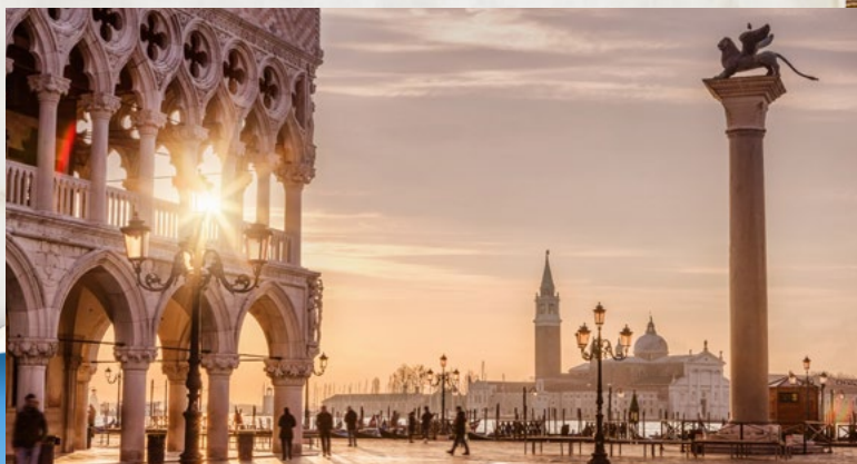
St. Mark's Square