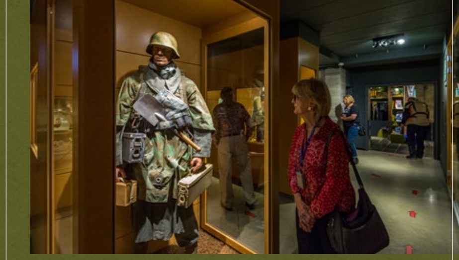
TOUR GUEST VIEWS A WEHRMACHT SOLDIER'S UNIFORM AND GEAR AT THE DECEMBER 1944 MUSEUM IN LA GLEIZE, BELGIUM.

Our team supports the local economies of the places we visit, staying in hand-selected boutique hotels and enjoying dining experiences that showcase locally sourced ingredients.