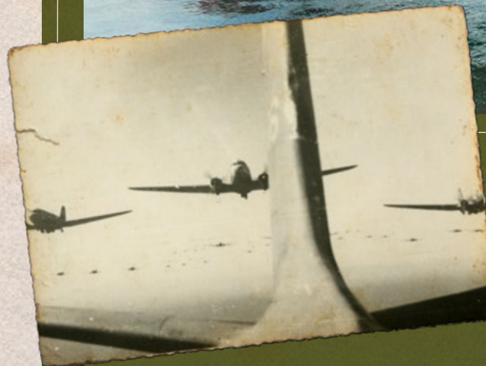
AMERICAN TRANSPORT PLANES IN THE AIR FROM THE TAIL VIEW OF A PLANE DURING OPERATION MARKET-GARDEN