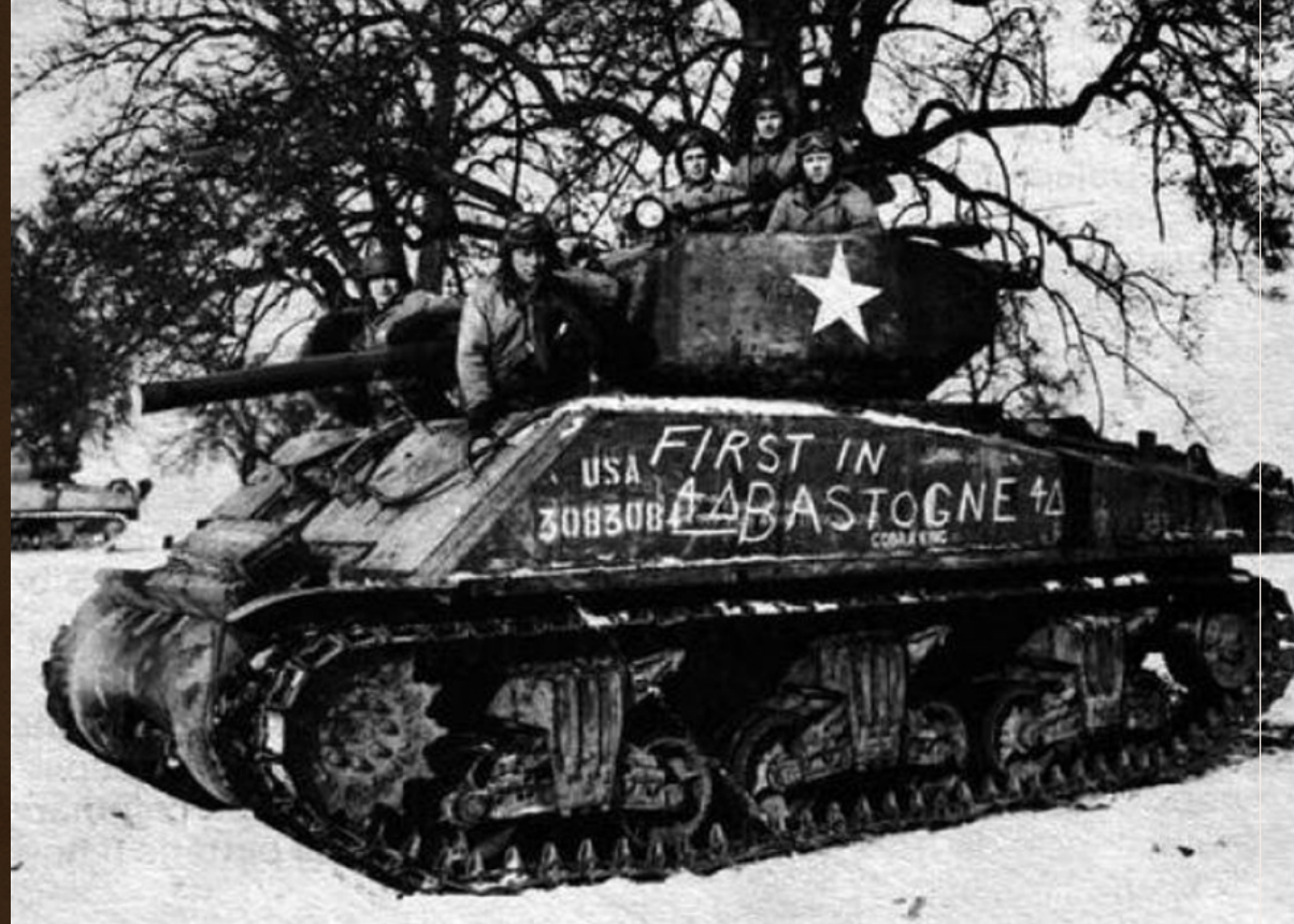
COBRA KING, THE FIRST TANK TO BREAK THROUGH TO THE BESIEGED AMERICAN GIs IN BASTOGNE