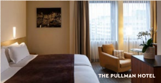
THE PULLMAN HOTEL