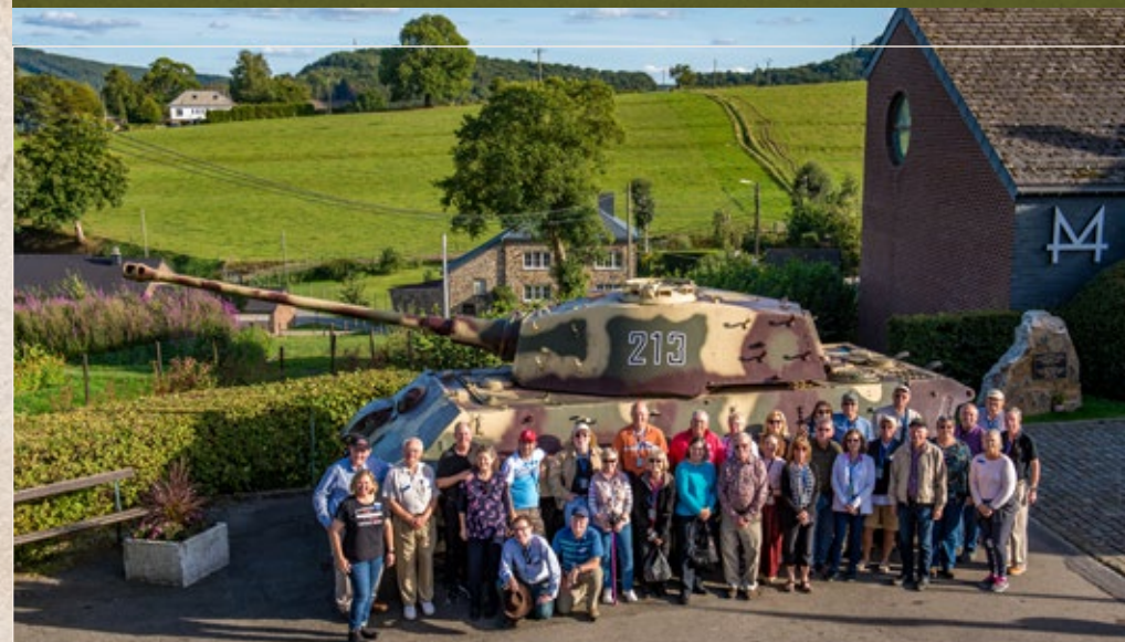
TOUR GUESTS POSE IN FRONT OF A TIGER II TANK AT THE DECEMBER 1944 MUSEUM IN LA GLEIZE, BELGIUM. THIS VEHICLE WAS ONE OF THE MANY LEFT BEHIND BY PEIPER'S 1ST SS PANZER REGIMENT IN 1944 AS THEY WITHDREW.