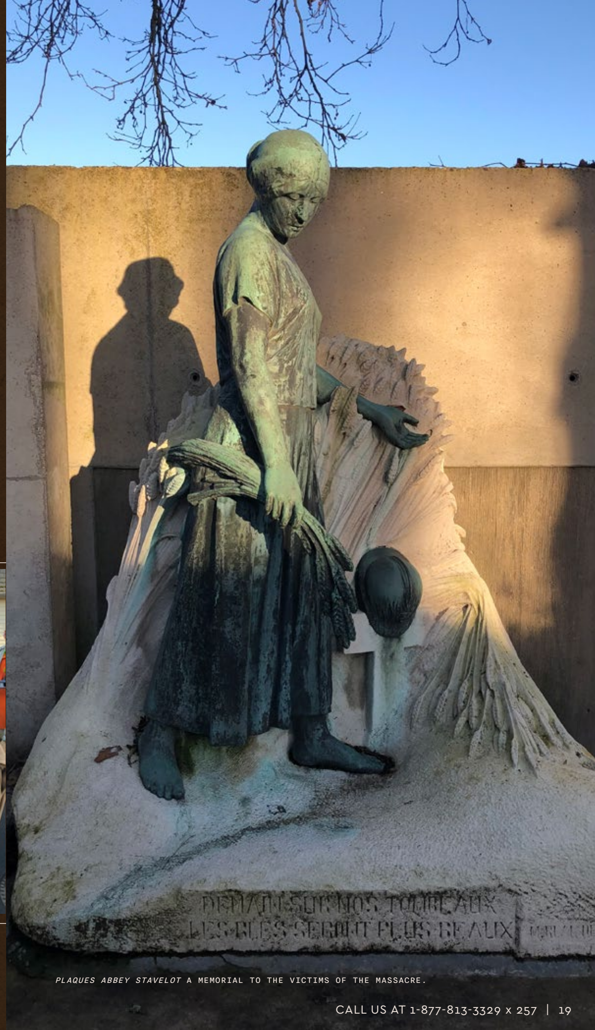
PLAQUES ABBEY STAVELOT A MEMORIAL TO THE VICTIMS OF THE MASSACRE.