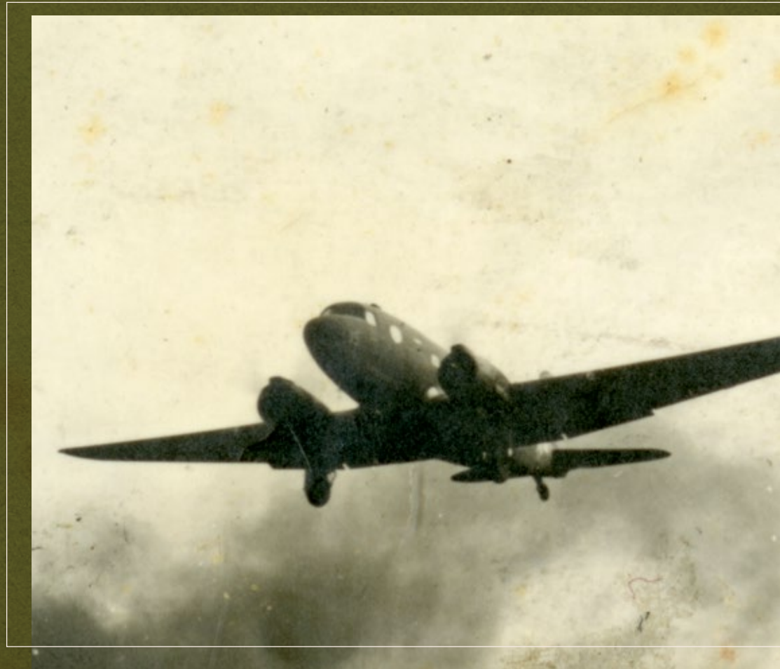
DOUGLAS C-47 SKYTRAIN IN FLIGHT

Purchased by the Museum in 2006 and now displayed with a restored interior, the Museum's C-47 offers visitors a tangible link to the airborne missions that changed the course of the war. From the hedgerows of Normandy to the frozen woods of Bastogne, the Skytrain was a lifeline—its rumble overhead a sign that help was on the way.