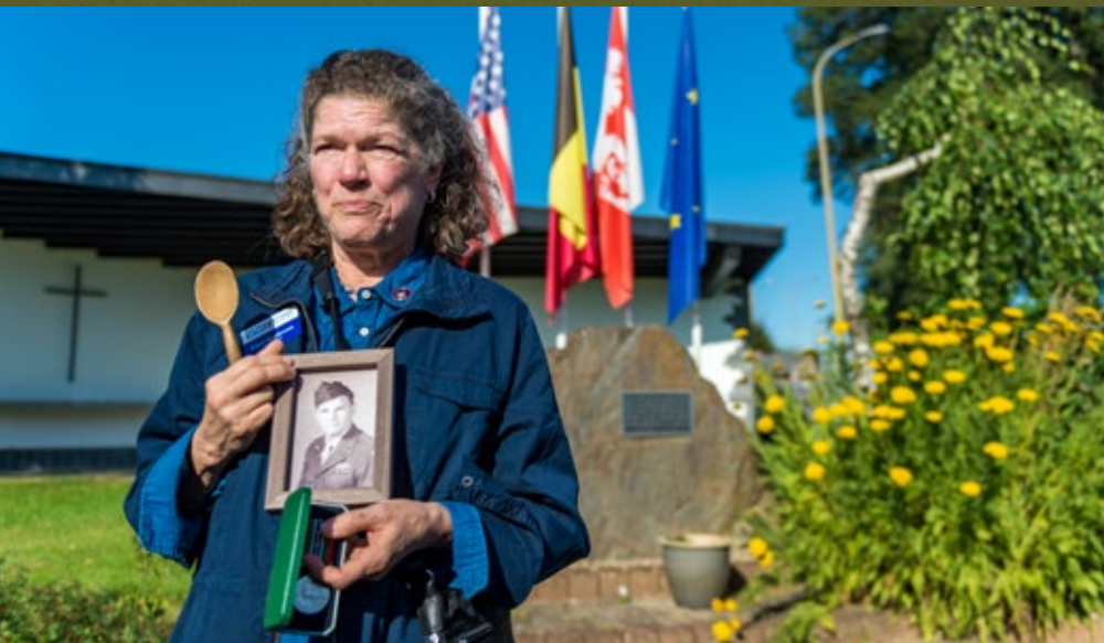
A TOUR GUEST REMEMBERS HER FAMILY MEMBER AT THE 106TH INFANTRY DIVISION MONUMENT IN ST. VITH, BELGIUM.