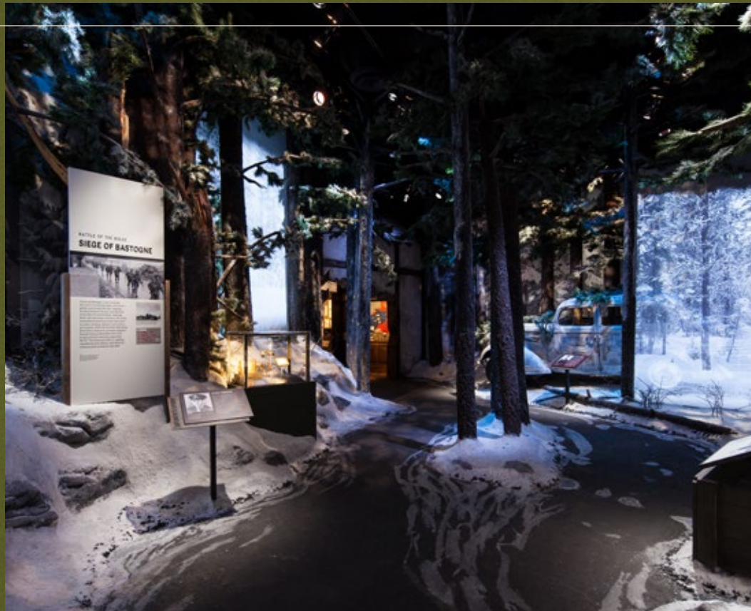
ROAD TO BERLIN: EUROPEAN THEATER GALLERIES | BATTLE OF THE BULGE GALLERY