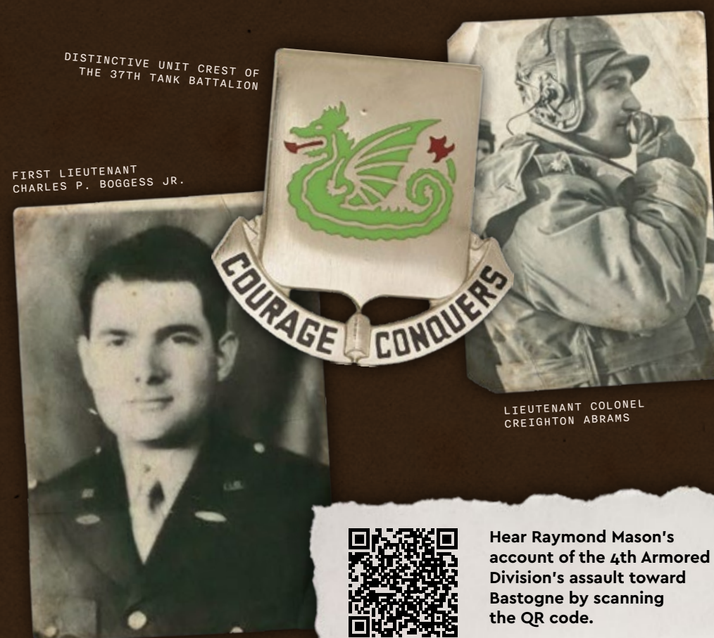
DISTINCTIVE UNIT CREST OF THE 37TH TANK BATTALION