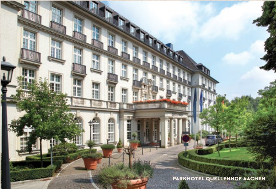
PARKHOTEL QUELLENHOF AACHEN