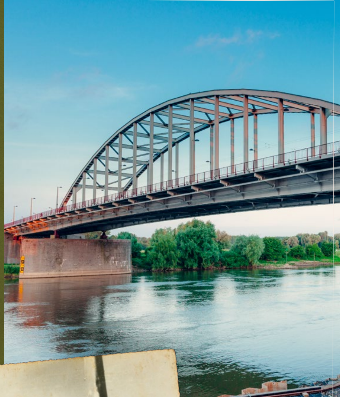
ARNHEM BRIDGE, "A BRIDGE TOO FAR"

Margraten American Cemetery / Depart for Aachen to meet the main group (B)