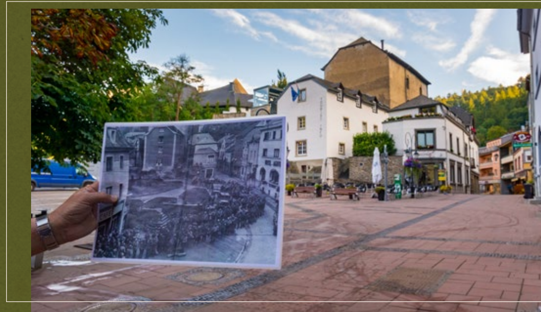
AN EXPERT LOCAL GUIDE SHOWING A WWII-ERA PHOTO OF THE TOWN SQUARE IN CLERVAUX, LUXEMBOURG.