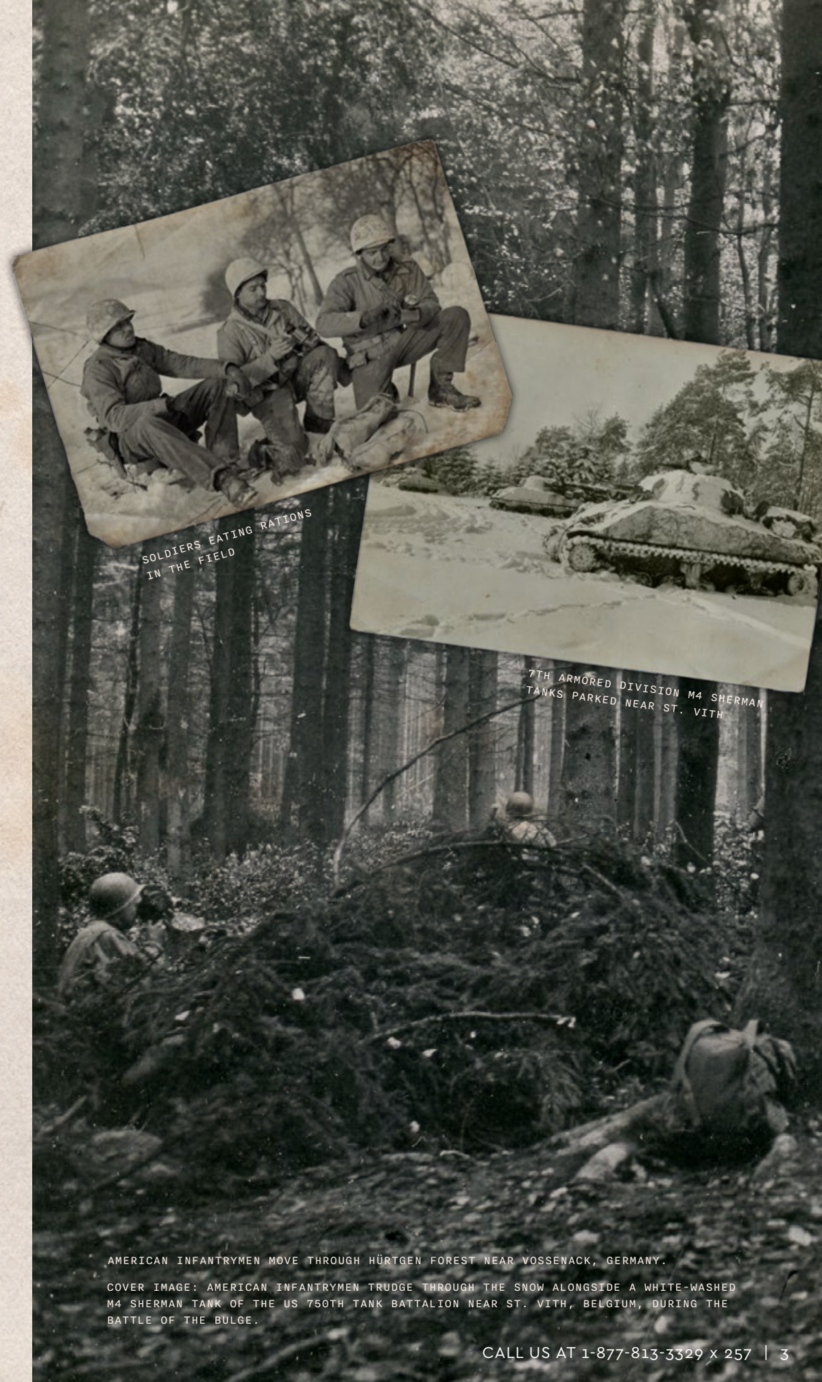
SOLDIERS EATING RATIONS IN THE FIELD