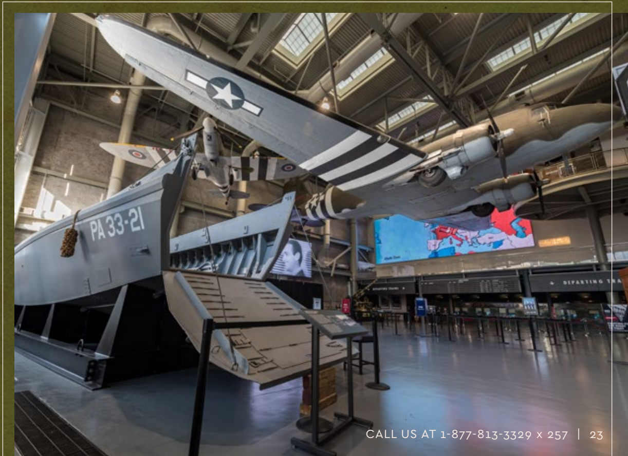
C-47 ON DISPLAY AT THE NATIONAL WWII MUSEUM