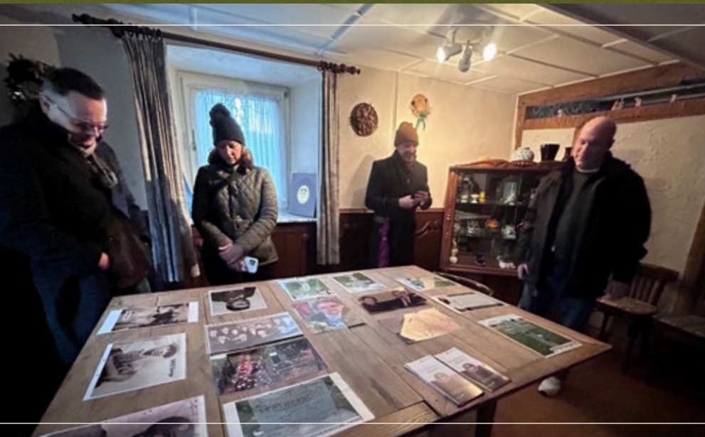
TOUR GUESTS AT THE FORMER LANGER FAMILY FARMHOUSE NEAR WERETH, BELGIUM