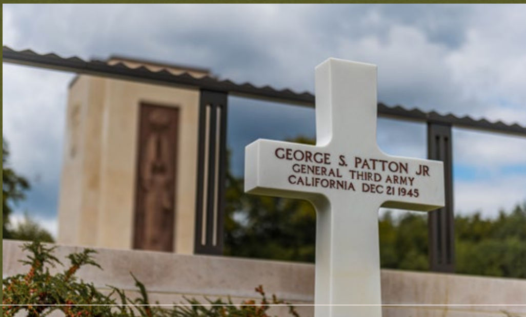
LUXEMBOURG AMERICAN CEMETERY