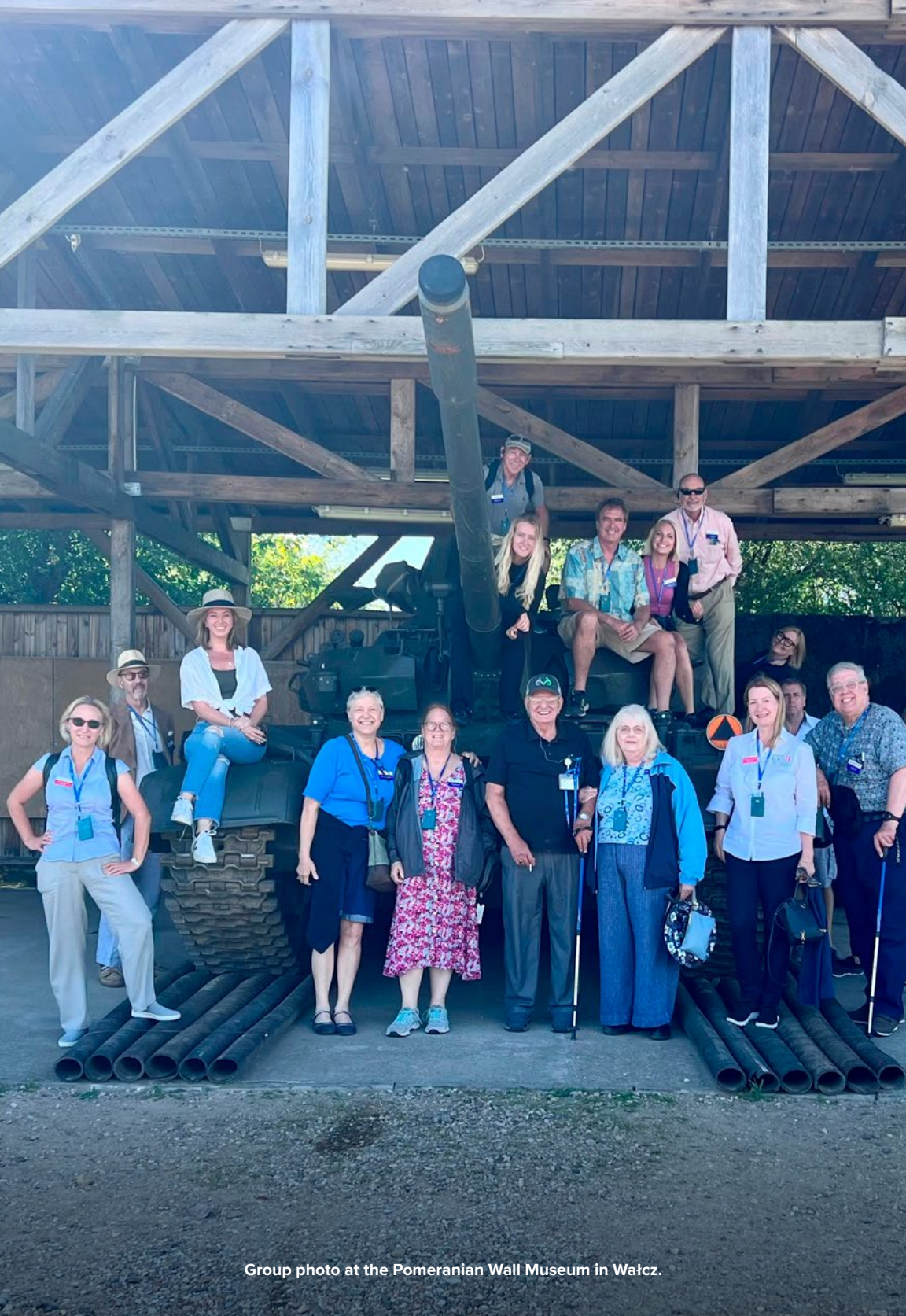
Group photo at the Pomeranian Wall Museum in Watz.