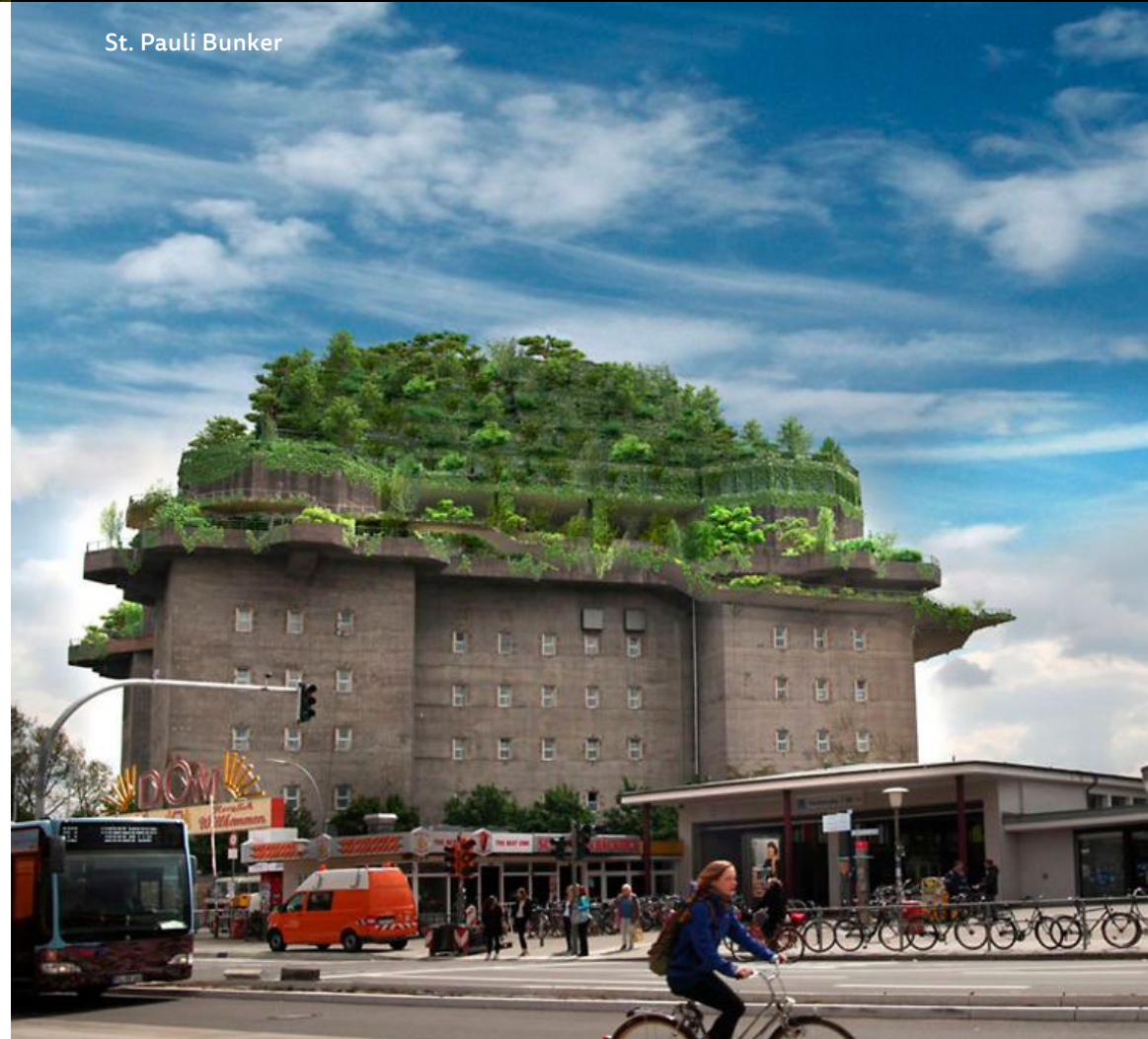
St. Pauli Bunker

$129 per person taxes and fees are additional.