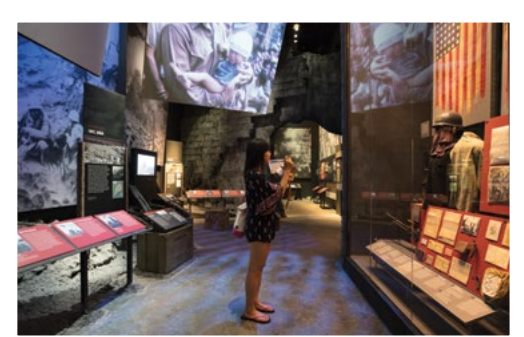
Road to Berlin Galleries