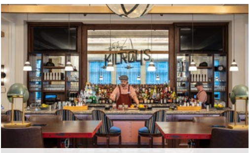
Kilroy's Restaurant and Bar