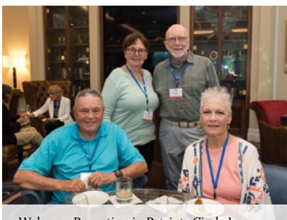
Welcome Reception in Patriots Circle Lounge