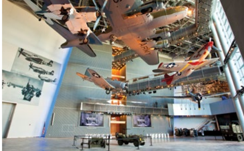
US Freedom Pavilion: The Boeing Center