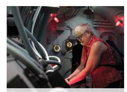
Final Mission: USS Tang Submarine Experience