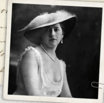
Letter written by Mata Hari, France, 1908

à l'opéra dans le rôle de Lakmé. Je vous prie de me faire un grand plaisir et de me donner une place pour l'opéra, pour ce soir. Je vous recom- mende à tous bons jours.