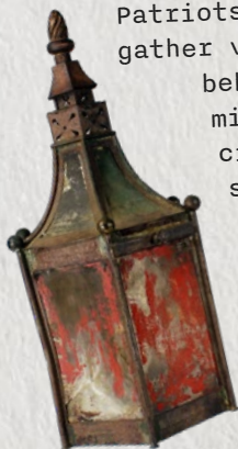
James Lafayette Lantern, 1824

behind enemy lines. His work as a spy provided critical military intelligence leading to an entrapment that crippled the British military [REDACTED] and helped secure American victory at the Battle of Yorktown. When he won his freedom after the war, James took the name Lafayette to honor his friend and comrade.