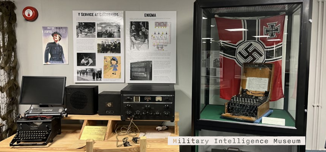
Military Intelligence Museum