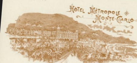
THE GORDON HOTELS