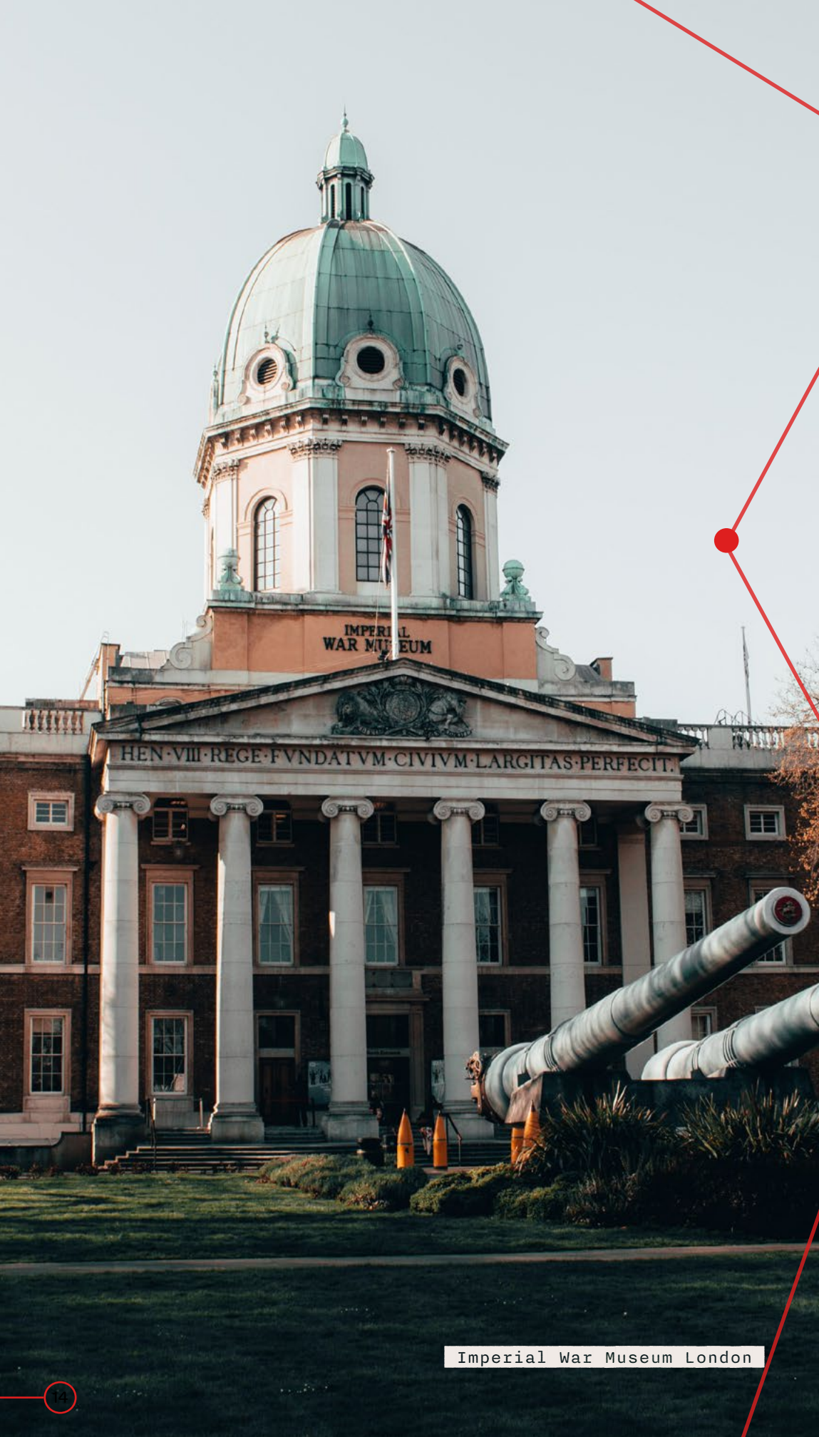
Imperial War Museum London