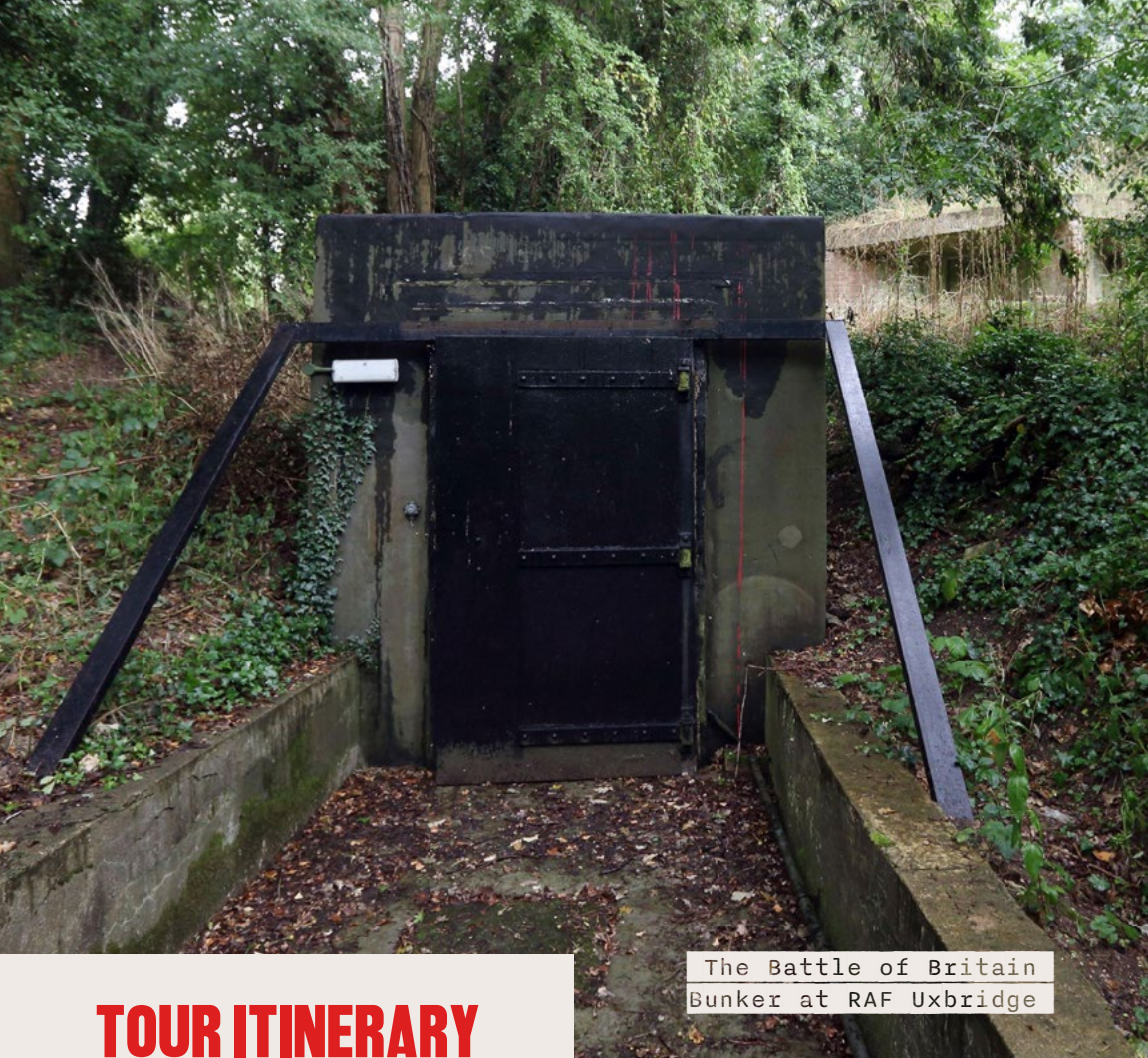
The Battle of Britain Bunker at RAF Uxbridge