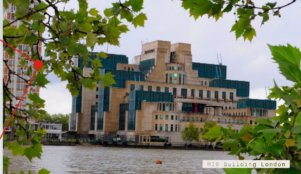
MI6 Building London