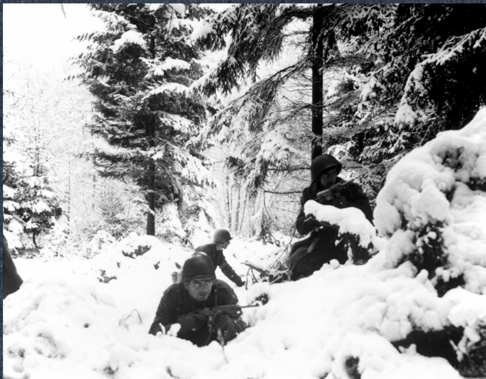
American infantrymen of the 290th Regiment fight in fresh snowfall near Amonines, Belgium. January 4, 1945.