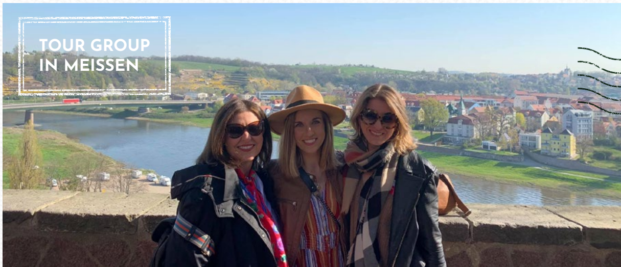
TOUR GROUP IN MEISSEN