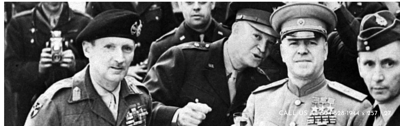
British Field Marshal Bernard Montgomery, American General Dwight Eisenhower, Soviet Marshal Georgy Zhukov, and British Air Chief Marshal Arthur Tedder toasting victory in Frankfurt, June 16, 1945.