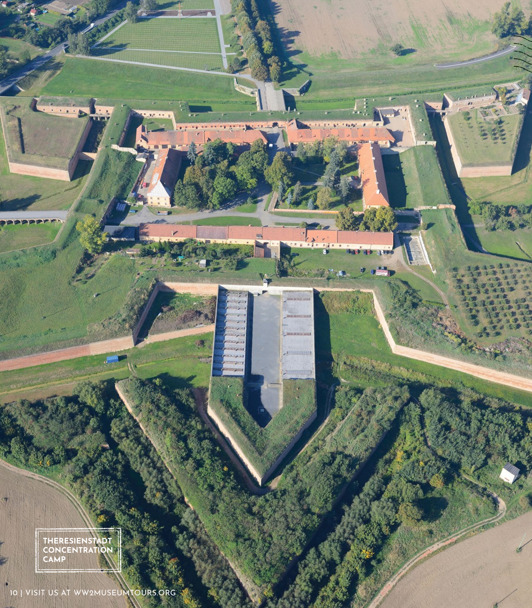
THERESIENSTADT CONCENTRATION CAMP