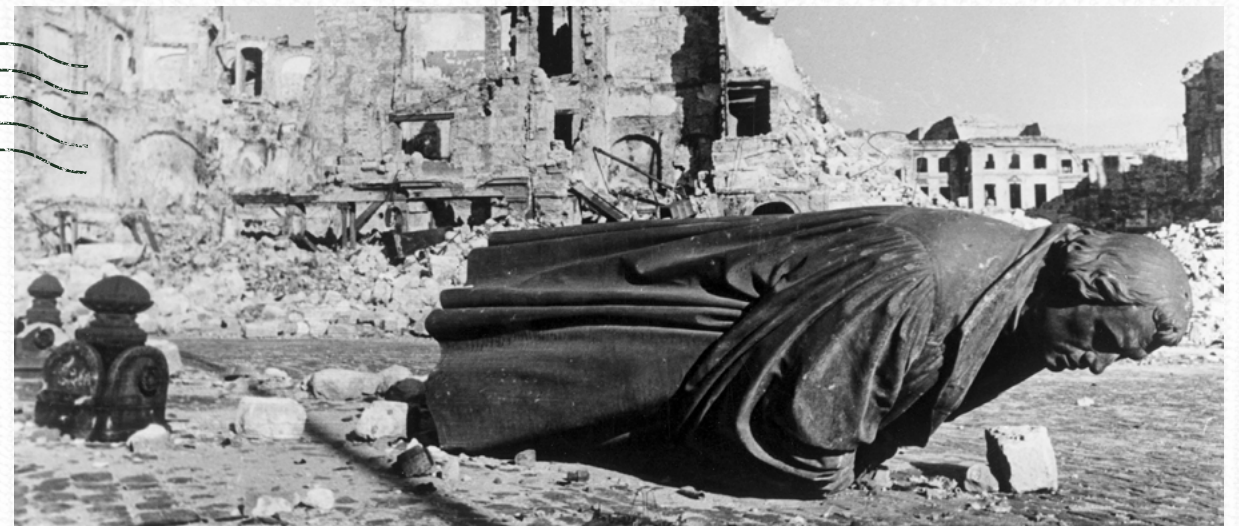
Bombardment of Dresden, 14-15 February 1945. The damaged Martin Luther memorial after the bombardment.