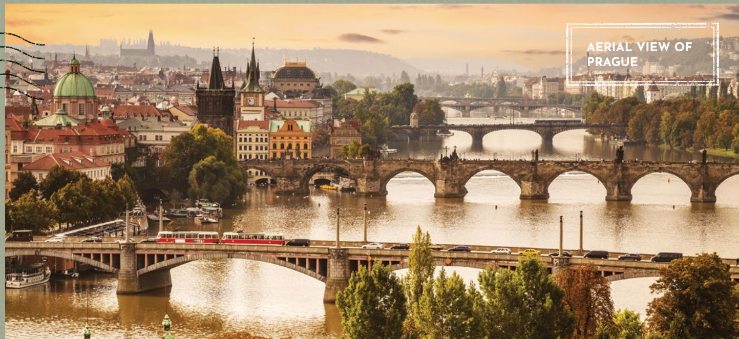
AERIAL VIEW OF PRAGUE