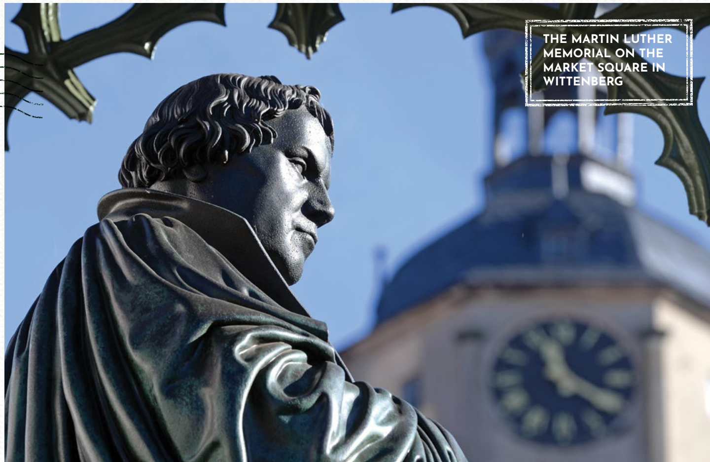
THE MARTIN LUTHER MEMORIAL ON THE MARKET SQUARE IN WITTENBERG