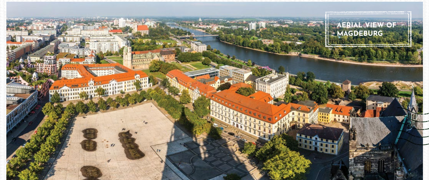
AERIAL VIEW OF MAGDEBURG