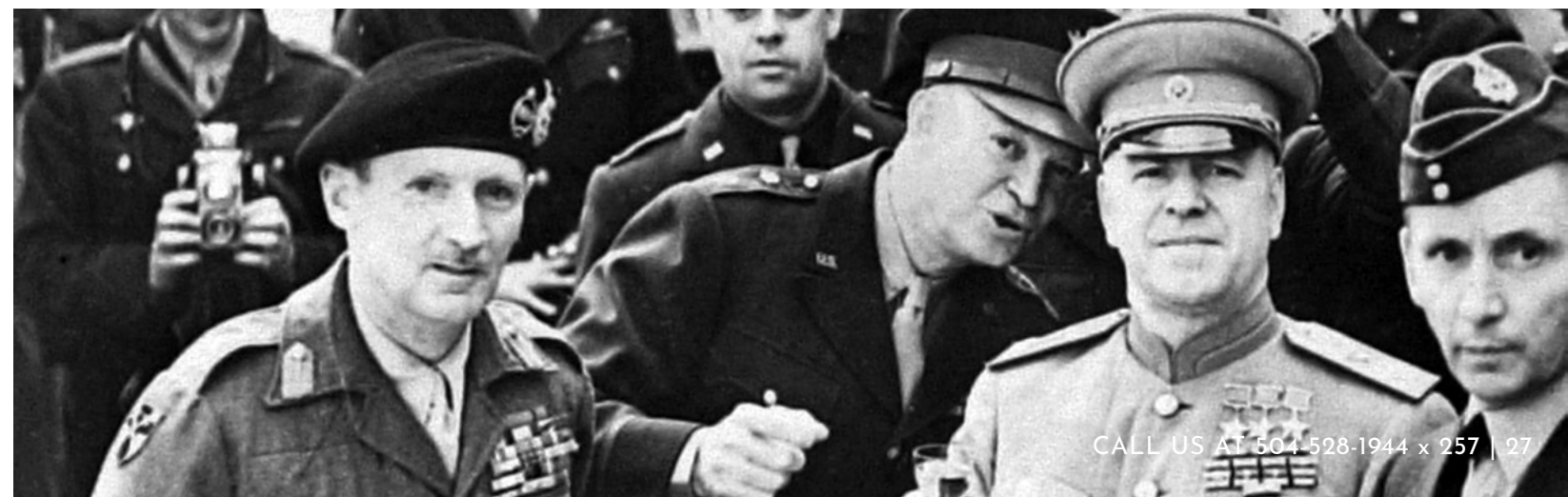
British Field Marshal Bernard Montgomery, American General Dwight Eisenhower, Soviet Marshal Georgy Zhukov, and British Air Chief Marshal Arthur Tedder toasting victory in Frankfurt, June 16, 1945.