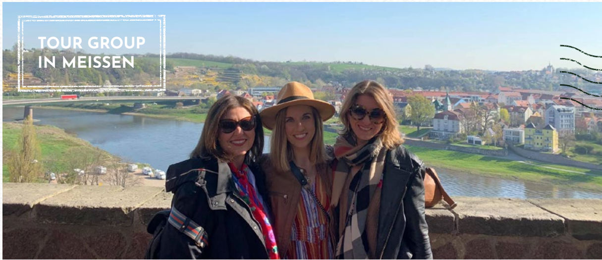
TOUR GROUP IN MEISSEN