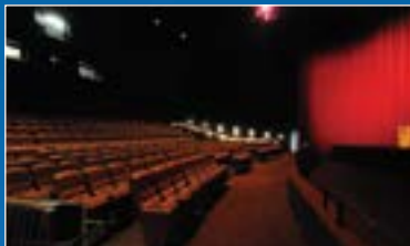
EXCLUSIVE 4-D CINEMA EXPERIENCE

Experience the #1 Attraction in New Orleans on this custom-curated, four-day group tour to The National WWII Museum