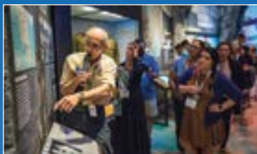
PRIVATE GUIDED GALLERY TOURS