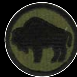
A 92nd Infantry Division Patch