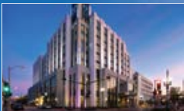
LUXURY ACCOMMODATIONS AT THE HIGGINS HOTEL