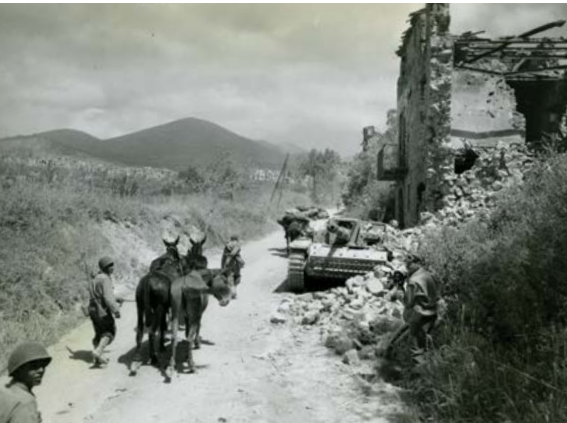
PHOTO: African American soldiers lead mules to the front in Italy and pass a wrecked German tank lying by the roadside. A Signal Corps member films them with a camera in the lower right corner, May 21, 1944.

Following the initial landings in the south, the Allies found themselves bogged down facing the formidable Gustav Line, a network of German defenses in the mountains between Naples and Rome. Attempting to outflank this line, the 36th and 45th Infantry Divisions achieved a successful amphibious landing in Anzio on January 25, 1944, but sluggish commanders failed to move rapidly enough, resulting in another stalemate. The destruction of Monte Cassino by the Allies in 1944 served mainly to generate headlines and fodder for German propaganda. The spring thaw in the mountains found the Allies once more on the advance, liberating Rome on June 4, 1944, creating brief headlines around the world that would soon be outshined by the June 6 landings in Normandy. Meanwhile, German Field Marshal Albert Kesselring retreated to the northern Apennines to establish yet another defensive position known to the Allies as the Gothic Line. General Mark Clark's Fifth Army faced a desperate enemy and unforgiving terrain, and it was here he coined the phrase that defined the Italian campaign: "Mud, Mountains, and Mules."