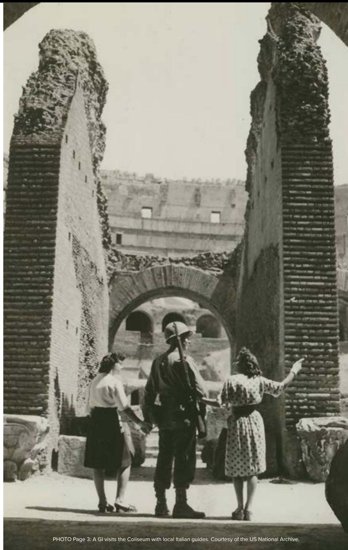
PHOTO Page 3: A GI visits the Coliseum with local Italian guides.