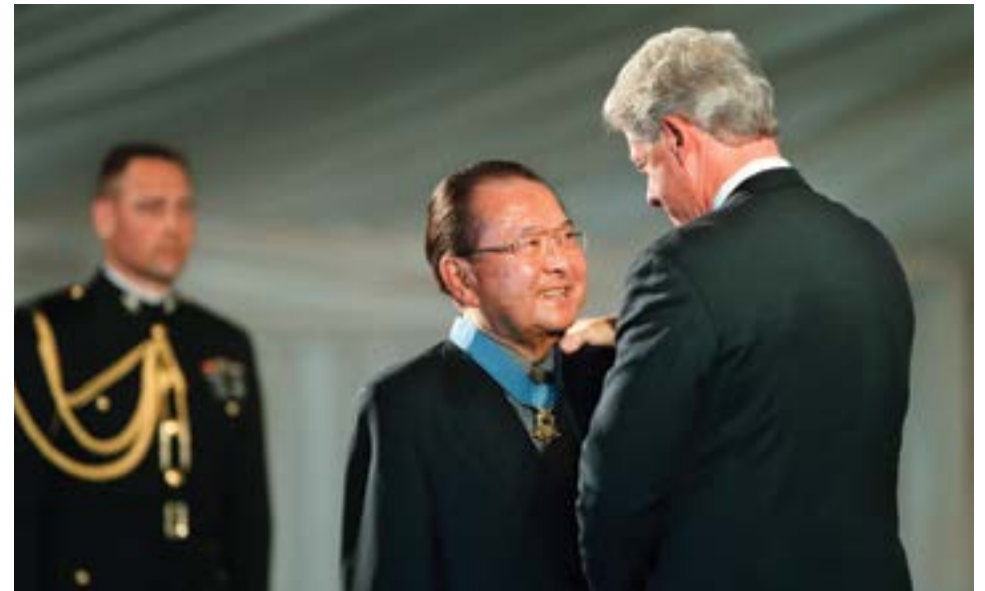
PHOTO: US President Bill Clinton congratulates US Senator Daniel Inouye of Hawaii, after awarding him the Congressional Medal of Honor on June 21, 2000, at the White House in Washington, DC, for his service in World War II.

PHOTO: First Lt. Daniel Inouye.