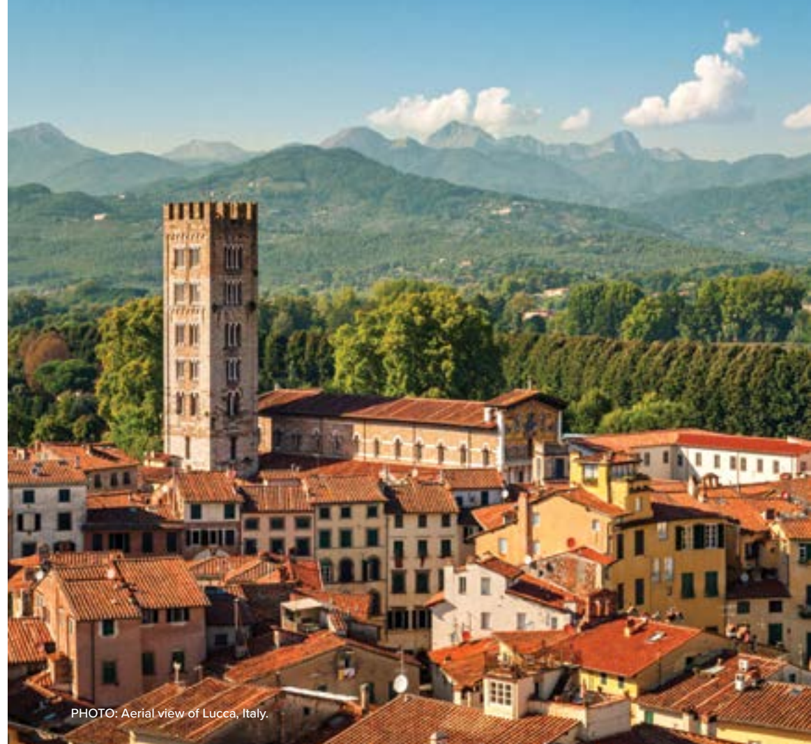
PHOTO: Aerial view of Lucca, Italy.