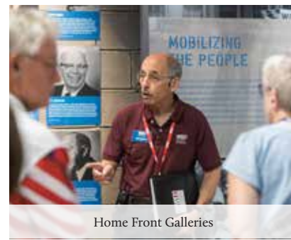
Home Front Galleries