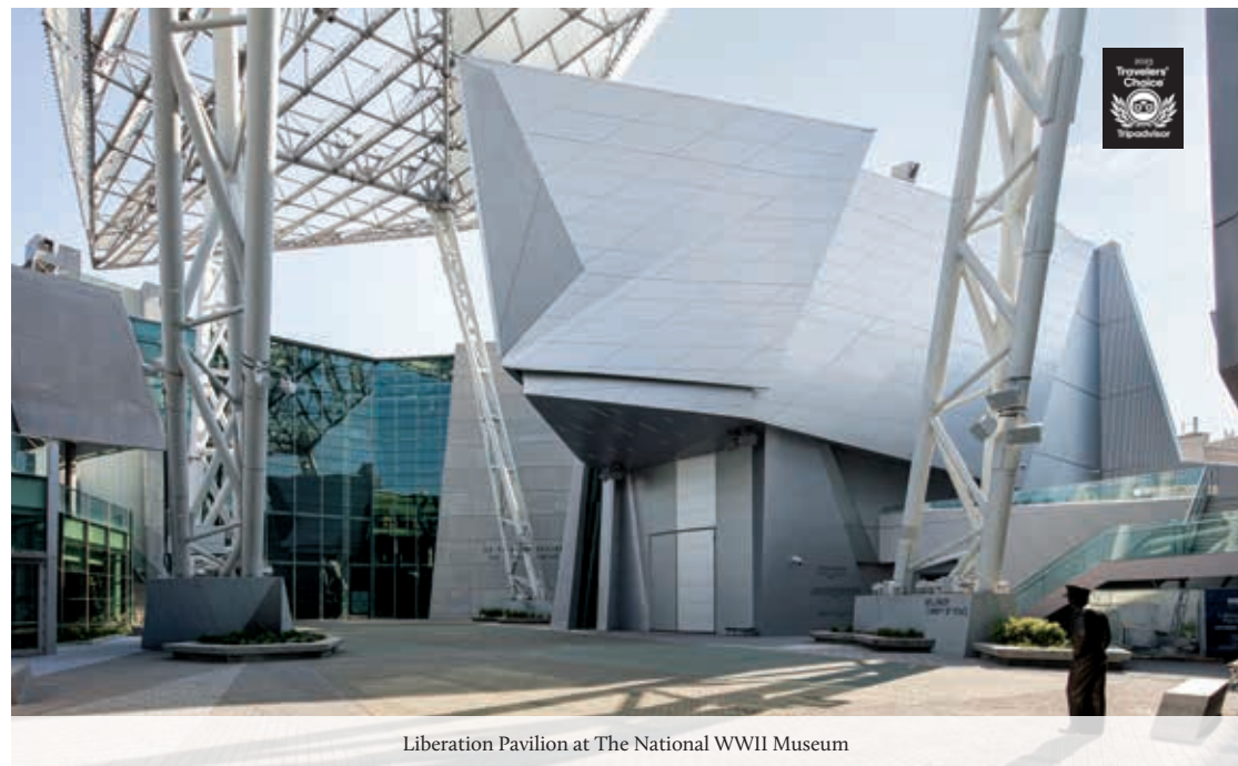
Liberation Pavilion at The National WWII Museum