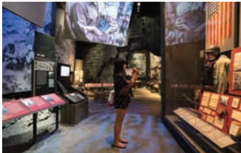
Road to Berlin galleries