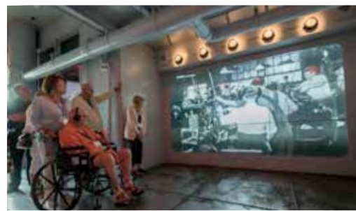
Early access to the galleries