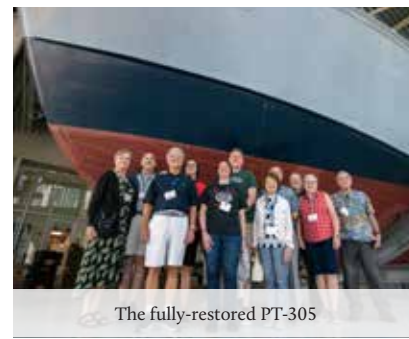
The fully-restored PT-305