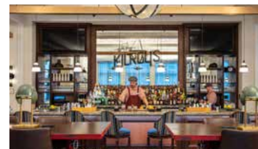
Kilroy's Restaurant and Bar

Worry-free booking! Full refund until one week prior to the tour. Call 1-877-813-3329 X 257