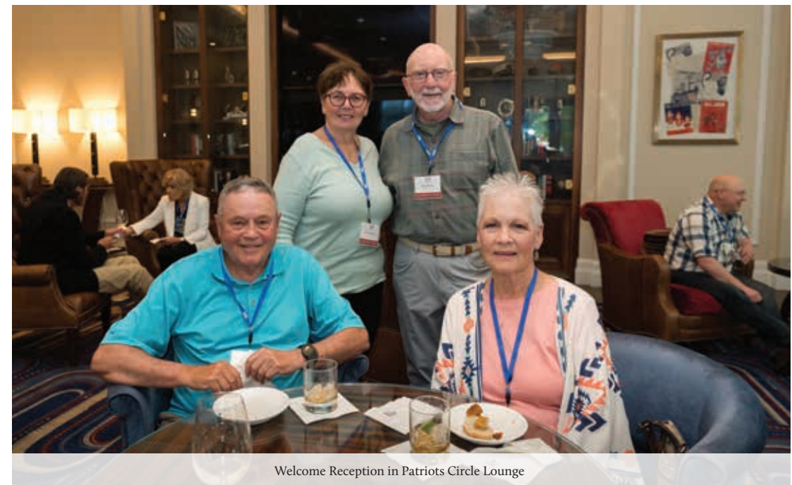
Welcome Reception in Patriots Circle Lounge