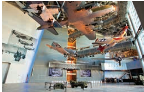
US Freedom Pavilion: The Boeing Center