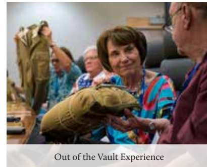
Out of the Vault Experience