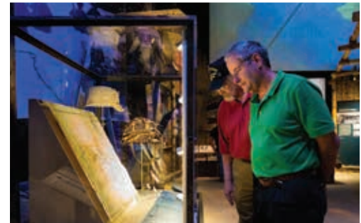
Road to Tokyo galleries