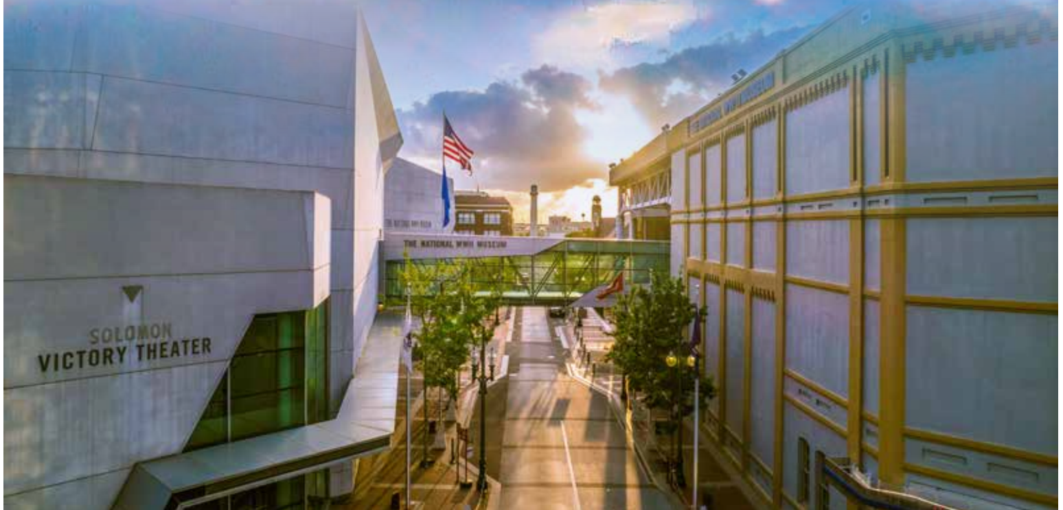
A view of Andrew Higgins Blvd at The National WWII Museum.