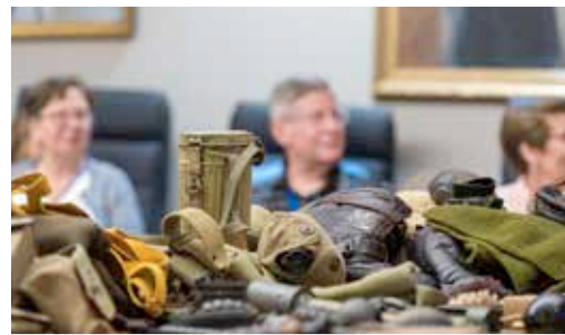
Out of the Vault Experience