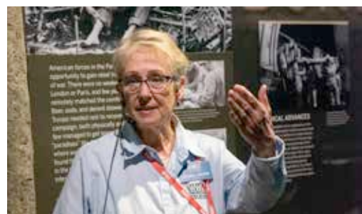
Guided touring through all major exhibits