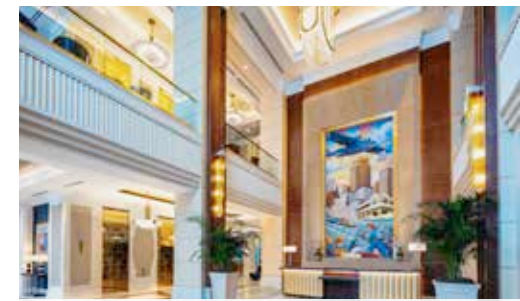
Higgins Hotel & Conference Center Lobby

Scan the QR code with your smart phone to register.