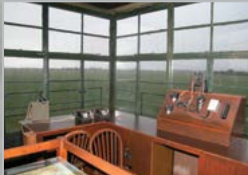
Photo: Control tower at Thorpe Abbots.

When traveling through the low-lying countryside of East Anglia, one might see, off in the distance, a square-shaped concrete tower located in the middle of a farmer's grain field. This would be the once-active control tower of a WWII American bomber base and self-contained military village. Clustered closely together, these bases comprised a war front, one of the strangest war fronts in all of history. It was from these bases, beginning in August 1942, that the Eighth Air Force flew the first of nearly 1,000 missions against Nazi Germany. Every one of these strikes was directed, from takeoff to landing, by the highly trained personnel in these ancient-looking stone towers. Today they are priceless pieces of wartime archeology that have been restored and revived by local residents as museums.