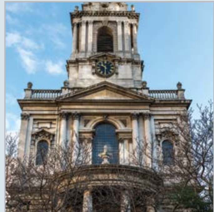
St. Clement Danes church, London.