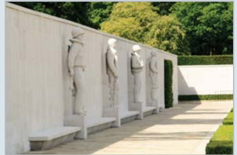
Photo: Tablets of the Missing at Cambridge American Cemetery.