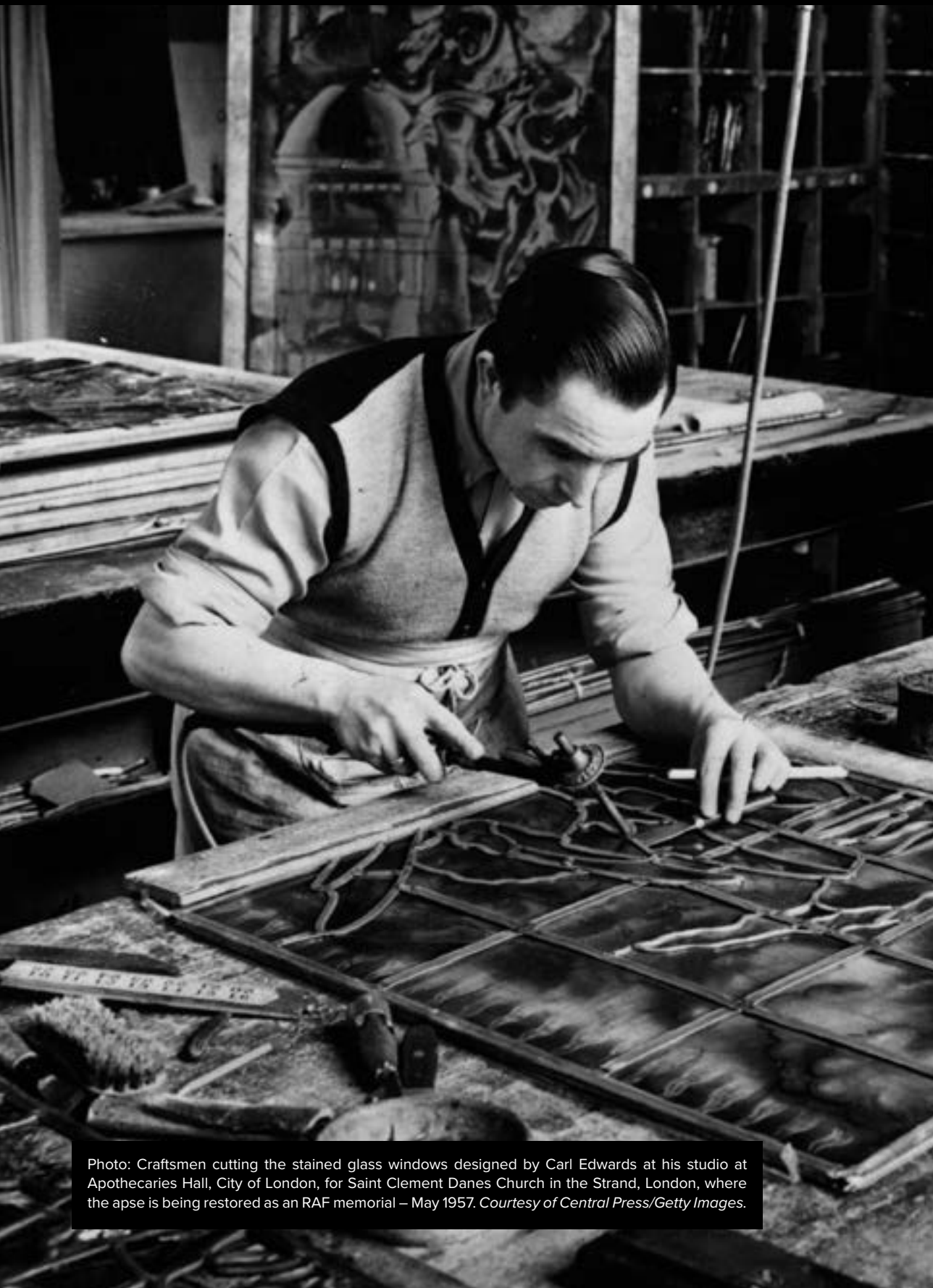
Photo: Craftsmen cutting the stained glass windows designed by Carl Edwards at his studio at Apothecaries Hall, City of London, for Saint Clement Danes Church in the Strand, London, where the apse is being restored as an RAF memorial – May 1957. Courtesy of Central Press/Getty Images.