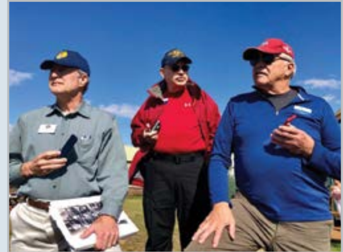
Photo: Tour guests at the American Air Museum, Duxford.