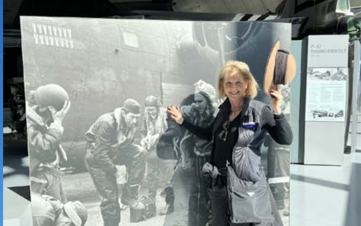
Photo: A tour guest on the Masters of the Air tour visits the Imperial War Museum-Duxford and locates an image of her uncle within the American Air Museum display.

Cover photo: Candid portrait of Captain Clark Gable when he was serving as an Aerial Gunner in the US Army Air Forces during World War II. Courtesy of Masheter Movie Archive/Alamy Stock. Archival photo this page: St Clement Danes church ablaze May 10, 1941. Background Photo by Antiqua Print Gallery, courtesy of Alamy Stock Photo.