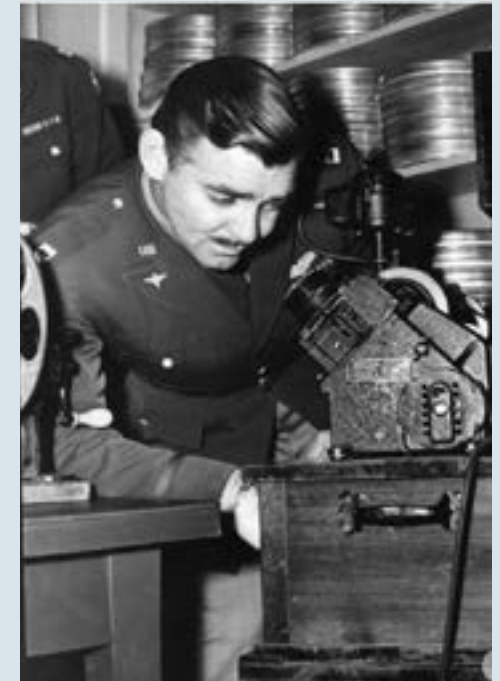
Photo: American USAAF bombardier bomb aimers undergo training.