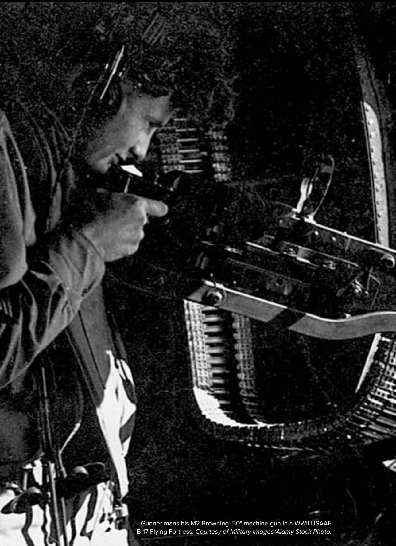
Gunner mans his M2 Browning .50" machine gun in a WWII USAAF B-17 Flying Fortress.