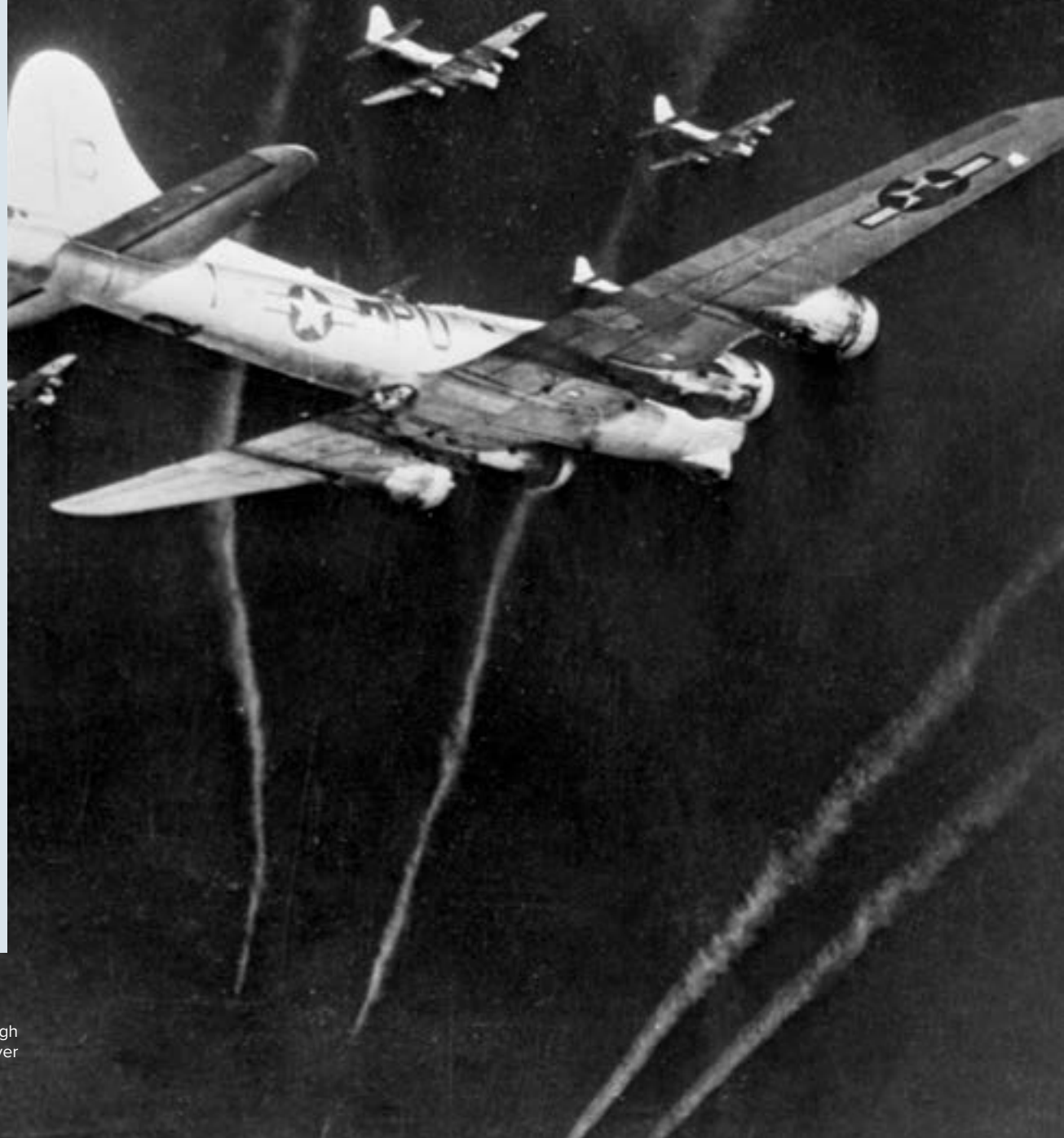
Photo: Vapor trails from US Eighth Air Force fighters streaking through the skies above and through a B-17 flying fortress formation as the fighters comb the sky for possible enemy planes over northern Germany to attack transportation facilities.

Accommodations: The Angel Hotel (B, L, D)