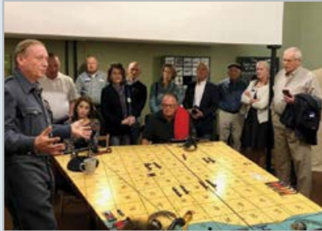
Photo: Guests Royal Observer Corps room in the Guildhall of Bury St. Edmunds.