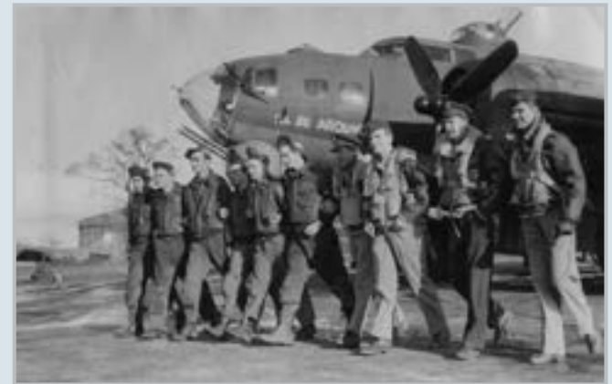
Photo: 95th Bombardment Group Crew in Horham. Courtesy of IWM, Roger Freeman Collection.