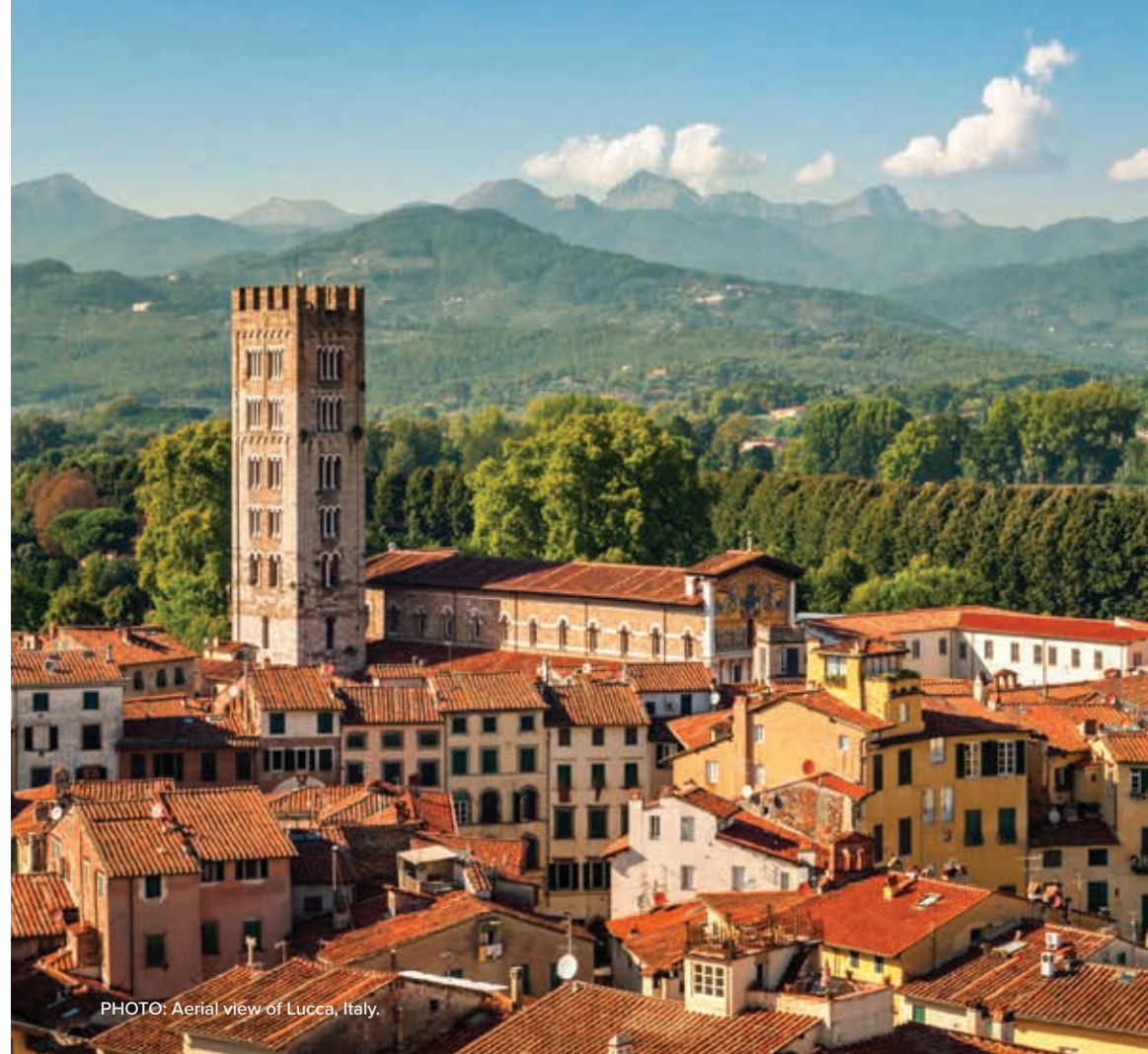
PHOTO: Aerial view of Lucca, Italy.