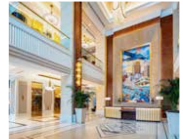
Lobby of The Higgins Hotel