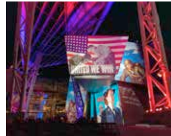
Expressions of America