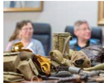
Out of the Vault Tour