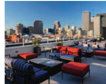
Rosie's on the Roof Restaurant