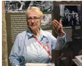
Guided touring through all major exhibits