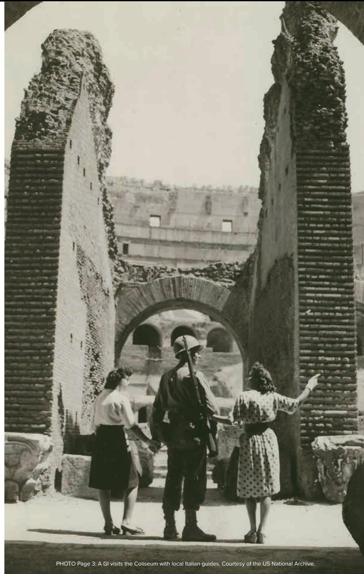
PHOTO Page 3: A GI visits the Coliseum with local Italian guides.