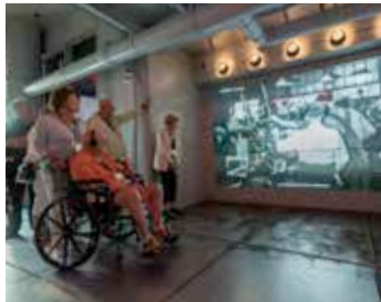
Early access to the galleries