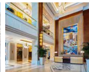
Lobby of The Higgins Hotel