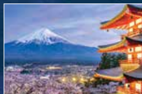
Victory in the Pacific: Japan & Okinawa

Victory in the Pacific: Pearl Harbor, Saipan, Tinian, Guam, and the Anniversary of the Battle of Iwo Jima