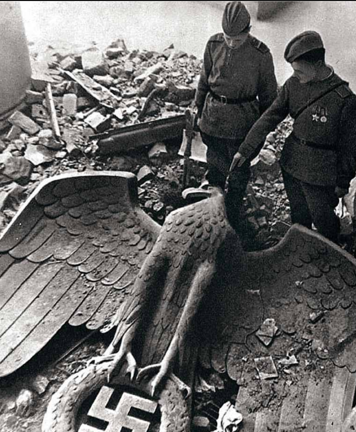
Cover Photo: Aerial view of Gdańsk. Photo Page 2: Russian soldiers looking at a torn down German Nazi Eagle with swastika emblem lying in the ruins of The Reich Chancellery after the fall of Berlin—1945, Berlin, Germany.