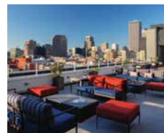
Rosie's on the Roof Restaurant