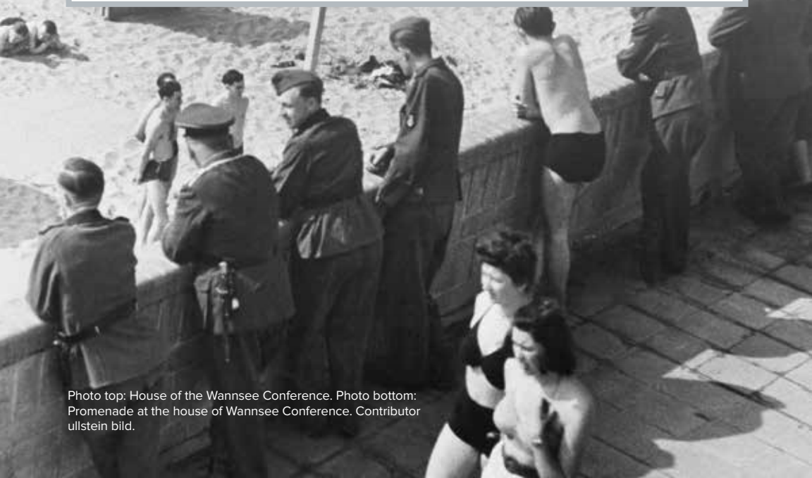
Photo top: House of the Wannsee Conference. Photo bottom: Promenade at the house of Wannsee Conference.

Accommodations: Hotel de Rome Berlin (B, L)