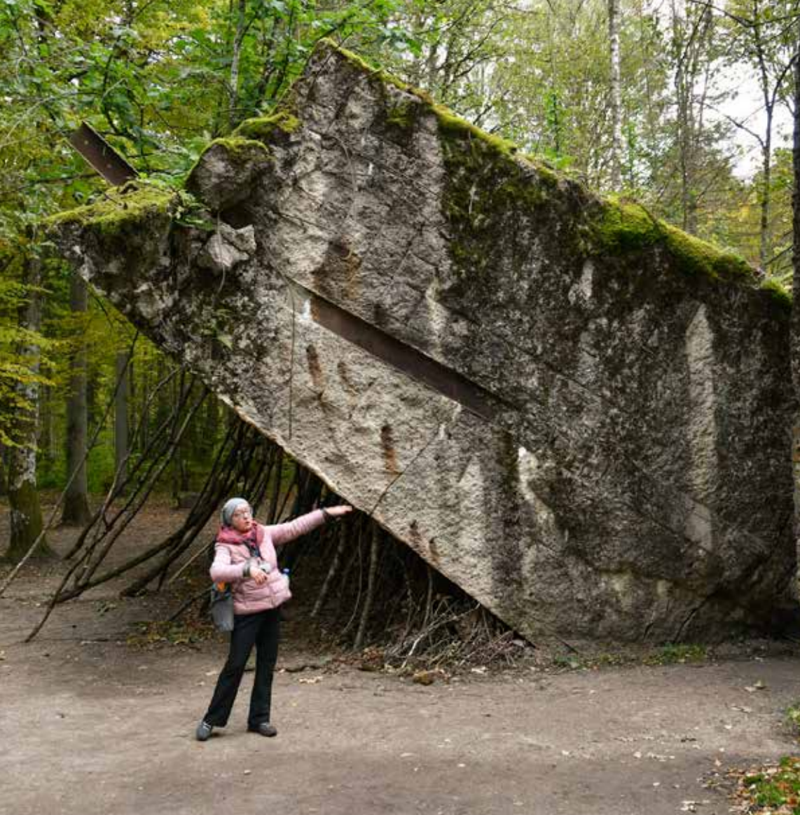
Photo: The National WWII Museum Expert Local Guide at Wolf's Lair, Hitler's command post Wolfsschanze.