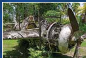
Victory in the Pacific: Battle of Guadalcanal