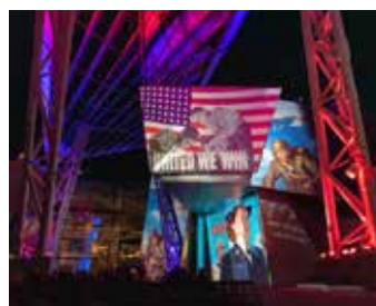
Expressions of America