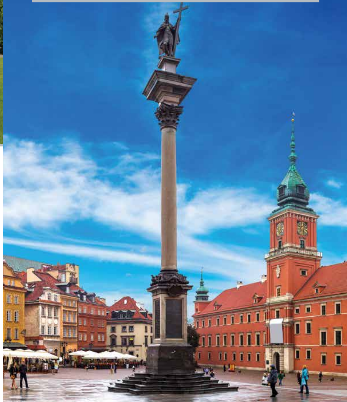
Photo: Royal Castle and Sigismund Column in Warsaw

Bid farewell to Poland this morning and transfer to Warsaw Chopin Airport (WAW) for individual flights back to the United States. (B)