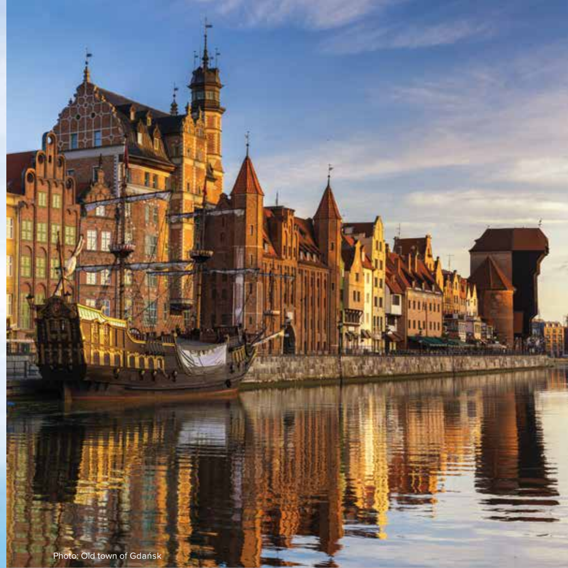
Photo: Old town of Gdańsk

Accommodations: Sofitel Grand Sopot (B, D)