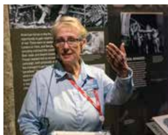
Guided touring through all major exhibits