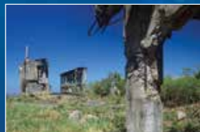
Victory in the Pacific: World War II in the Philippines