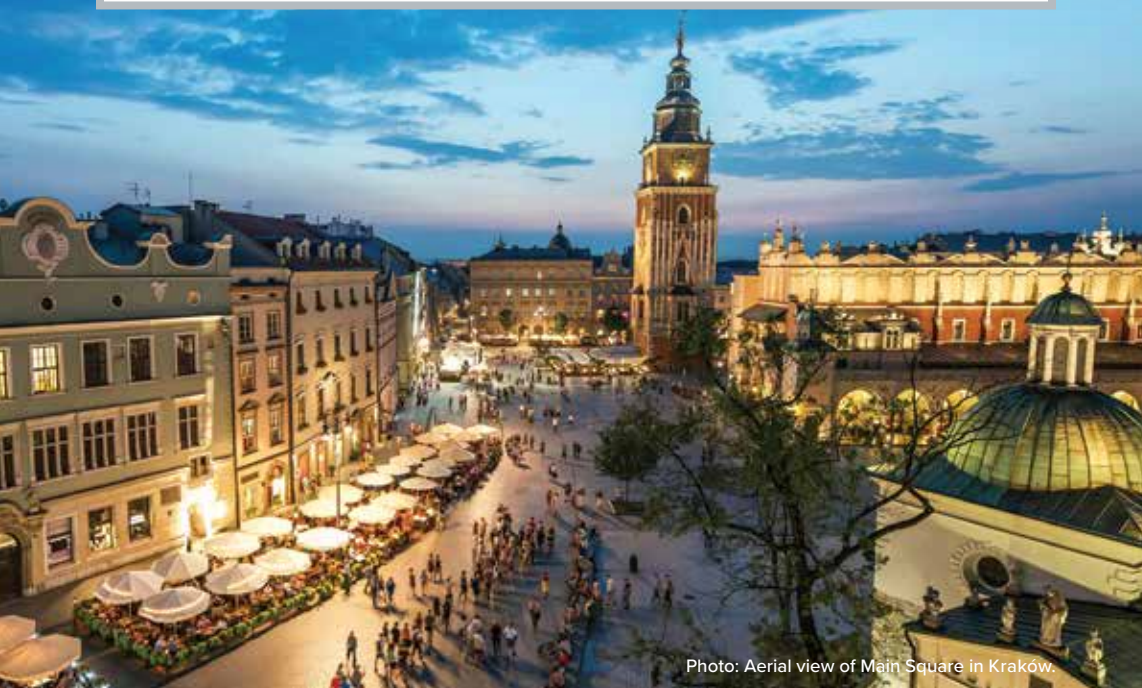
Photo: Aerial view of Main Square in Kraków.