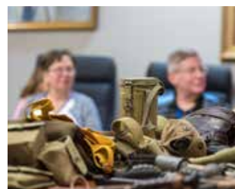
Out of the Vault Tour