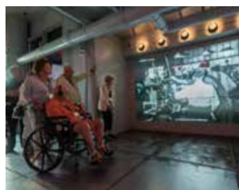
Early access to the galleries

Luxury Accommodations at the Official Hotel of The National WWII Museum