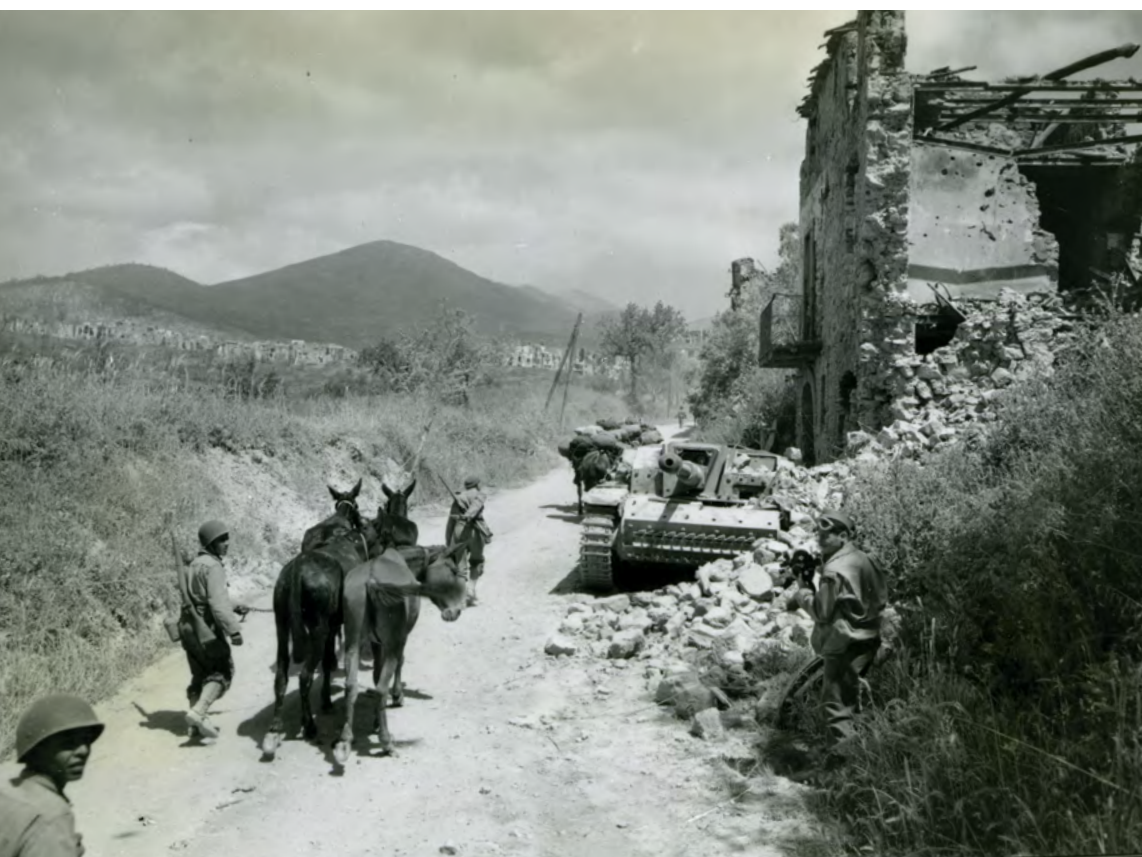
PHOTO: African American soldiers lead mules to the front in Italy and pass a wrecked German tank lying by the roadside. A Signal Corps member films them with a camera in the lower right corner, May 21, 1944.

Following the initial landings in the south, the Allies found themselves bogged down facing the formidable Gustav Line, a network of German defenses in the mountains between Naples and Rome. Attempting to outflank this line, the 36th and 45th Infantry Divisions achieved a successful amphibious landing in Anzio on January 25, 1944, but sluggish commanders failed to move rapidly enough, resulting in another stalemate. The destruction of Monte Cassino by the Allies in 1944 served mainly to generate headlines and fodder for German propaganda. The spring thaw in the mountains found the Allies once more on the advance, liberating Rome on June 4, 1944, creating brief headlines around the world that would soon be outshined by the June 6 landings in Normandy. Meanwhile, German Field Marshal Albert Kesselring retreated to the northern Apennines to establish yet another defensive position known to the Allies as the Gothic Line. General Mark Clark's Fifth Army faced a desperate enemy and unforgiving terrain, and it was here he coined the phrase that defined the Italian campaign: "Mud, Mountains, and Mules."