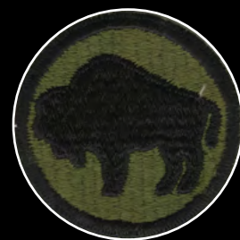
A 92nd Infantry Division Patch