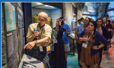
PRIVATE GUIDED GALLERY TOURS