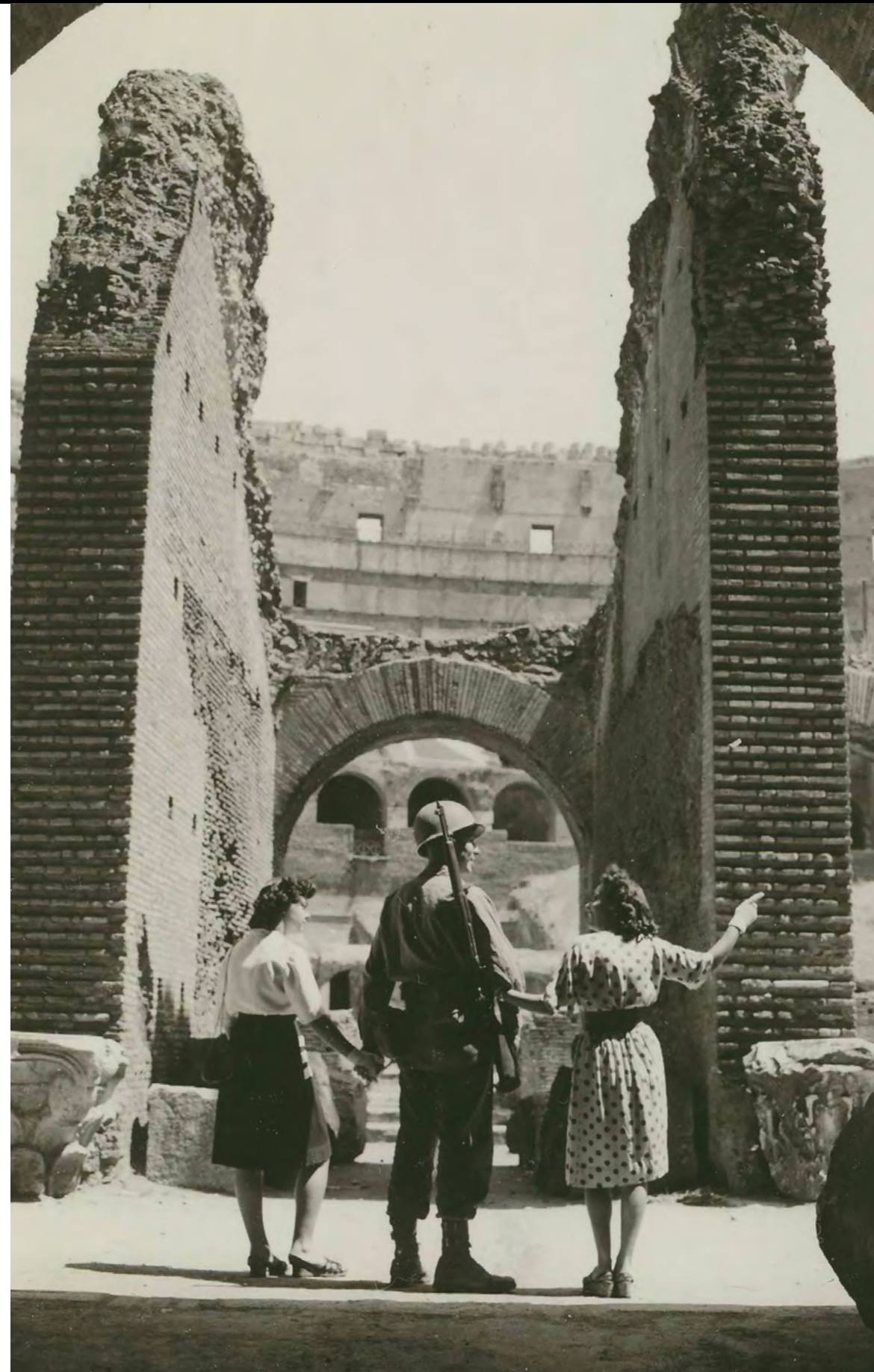
PHOTO Page 3: A GI visits the Coliseum with local Italian guides.

The Honorable & Mrs. Robert A. McDonald '75 President & CEO West Point Association of Graduates