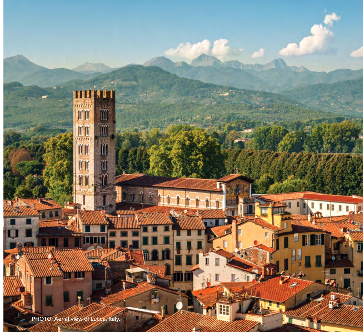
PHOTO: Aerial view of Lucca, Italy.