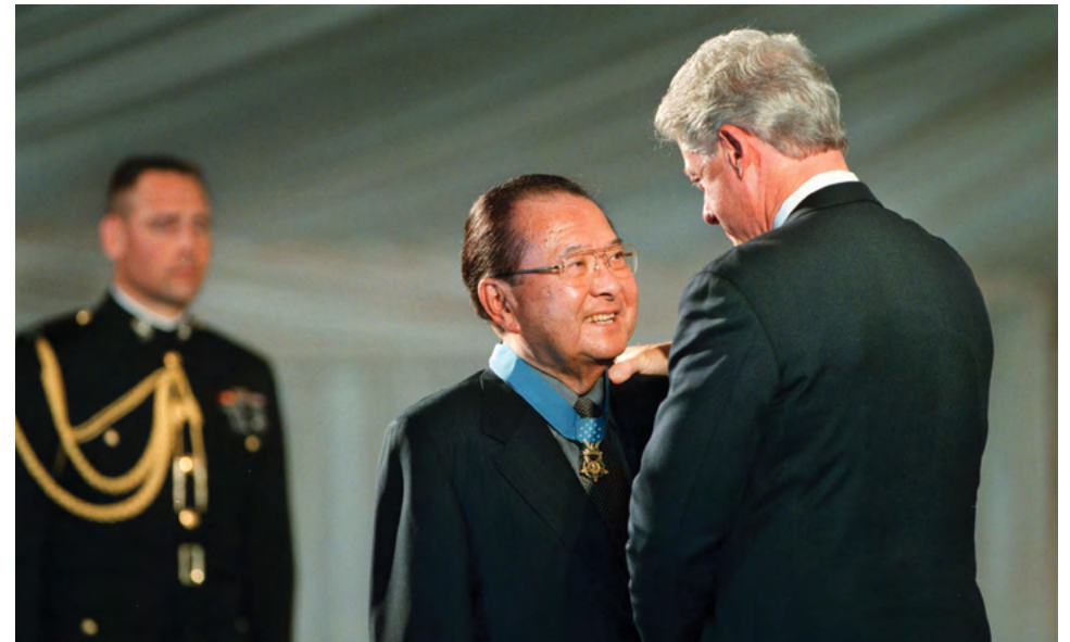
US President Bill Clinton congratulates US Senator Daniel Inouye of Hawaii, after awarding him the Congressional Medal of Honor on June 21, 2000, at the White House in Washington, DC, for his service in World War II.

First Lt. Daniel Inouye. Courtesy of PJF Military Collection/Alamy Stock Photo.