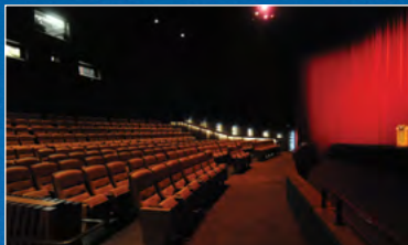
EXCLUSIVE 4-D CINEMA EXPERIENCE

Experience the #1 Attraction in New Orleans on this custom-curated, four-day group tour to The National WWII Museum