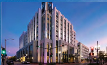
LUXURY ACCOMMODATIONS AT THE HIGGINS HOTEL