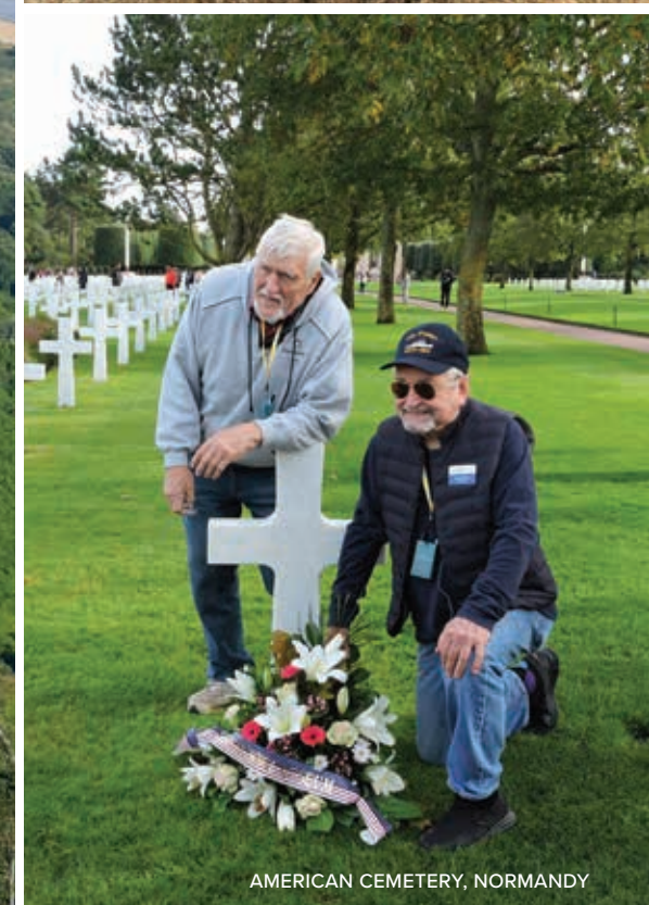
AMERICAN CEMETERY, NORMANDY