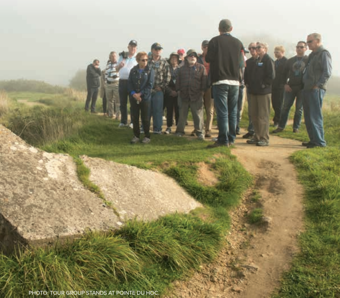
PHOTO: TOUR GROUP STANDS AT POINTE DU HOC.

For more than two and a half years the Allies planned and gathered their military strength to launch the decisive amphibious invasion of northern France and strike a mortal blow against the Third Reich. In anticipation, Adolf Hitler stockpiled reserve units in the Atlantic Wall defenses across the French coastlines, determined to drive the Allied forces back into the sea when the invasion was finally launched. There would be no second chance for the Allies: The fate of the continent hangs upon this decisive day.