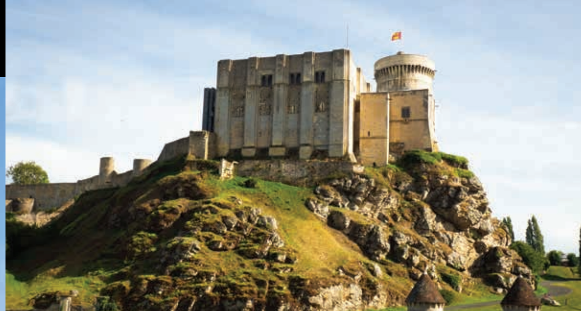
CHÂTEAU DE FALAISE