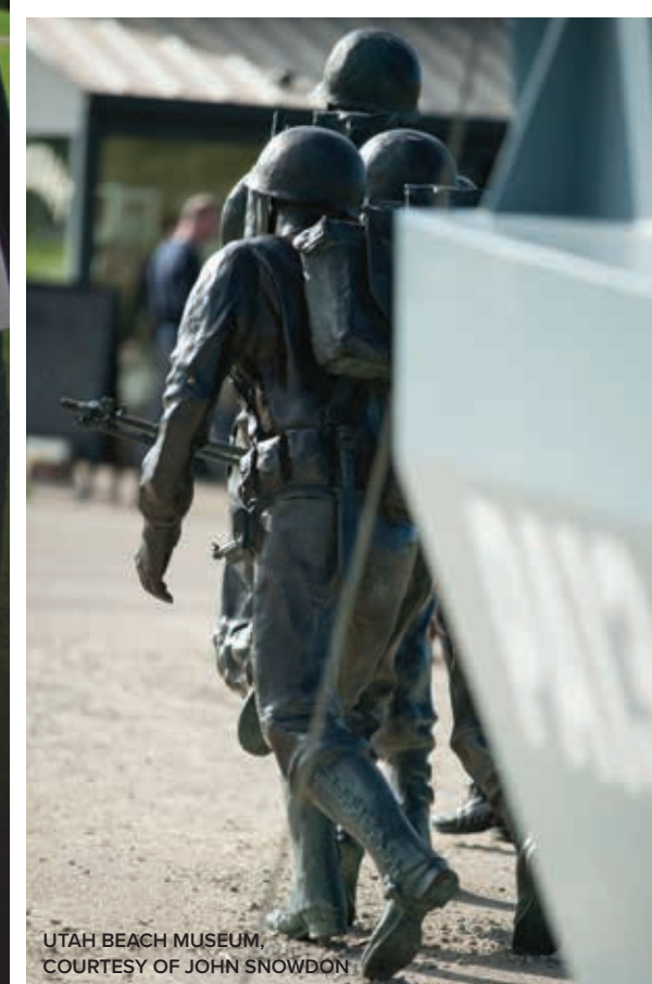
UTAH BEACH MUSEUM, COURTESY OF JOHN SNOWDON