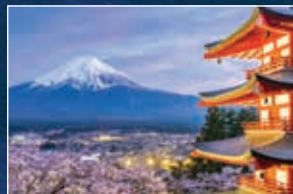
Victory in the Pacific: Japan & Okinawa

Victory in the Pacific: Pearl Harbor, Saipan, Tinian, Guam, and the Anniversary of the Battle of Iwo Jima