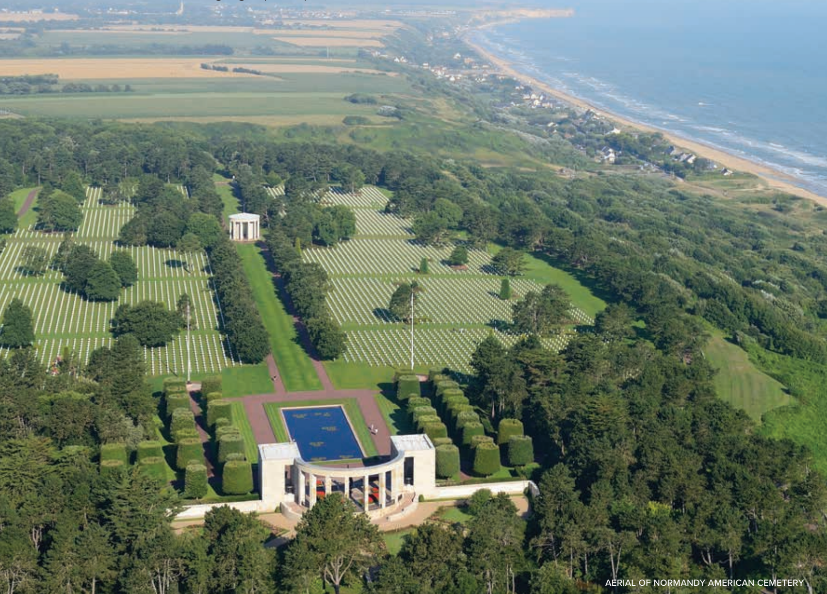
AERIAL OF NORMANDY AMERICAN CEMETERY

Accommodations: Hotel d'Argouges (B, L, D)