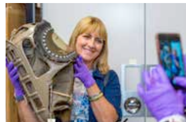
OUT OF THE VAULT MUSEUM TOUR WITH A MUSEUM CURATOR