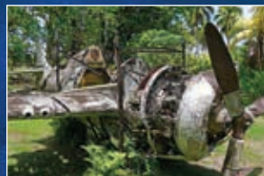
Victory in the Pacific: Battle of Guadalcanal