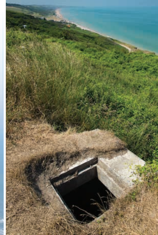
GERMAN STRONGPOINT, OMAHA BEACH