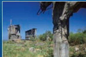
Victory in the Pacific: World War II in the Philippines