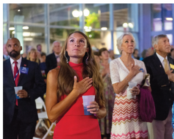
Expressions of America Experience