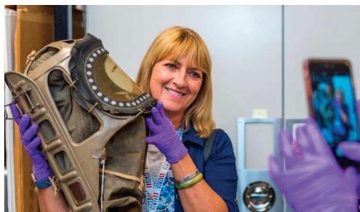
OUT OF THE VAULT MUSEUM TOUR WITH A MUSEUM CURATOR

Generously presented by the Bob & Dolores Hope Foundation, Expressions of America is a brand-new outdoor sound and light show featuring living murals covering the facades of our buildings. Along with music, archival footage, and personal reflections, this groundbreaking show places you in the center of the war's most epic and personal moments.