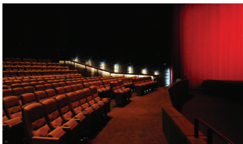
BEYOND ALL BOUNDARIES A UNIQUE CINEMA EXPERIENCE