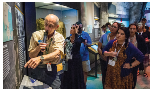
EARLY ACCESS TO CAMPAIGNS OF COURAGE GALLERIES