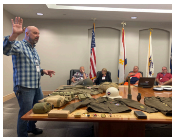
Out of the Vault Museum Experience