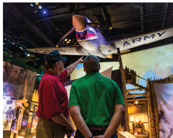
The Road to Tokyo Gallery, Campaigns of Courage