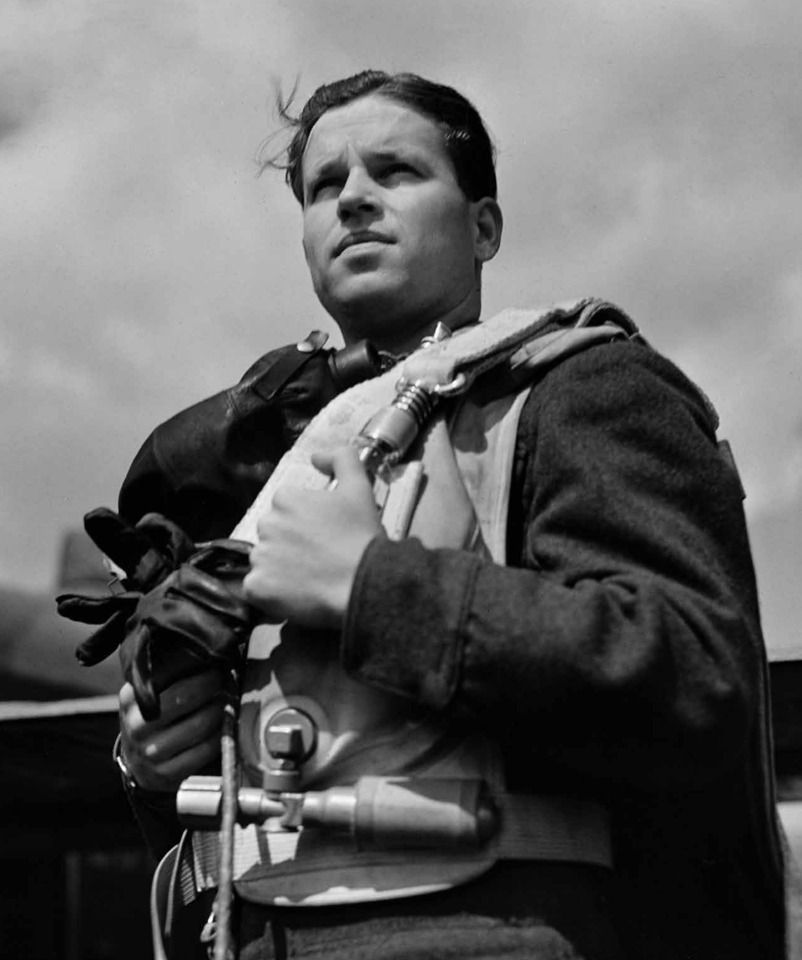
WING COMMANDER GUY GIBSON, COMMANDING OFFICER OF NO. 617 SQUADRON RAF