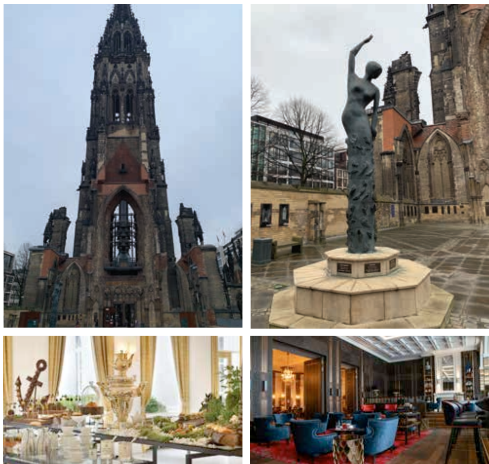
Top Left Photo: St. Nikolai Church in Hamburg. Top Right Photo: Angel on Earth statue by Edith Breckwoldt in front of the St. Nikolai Church. Bottom photos: Grand Atlantic Hamburg Hotel.