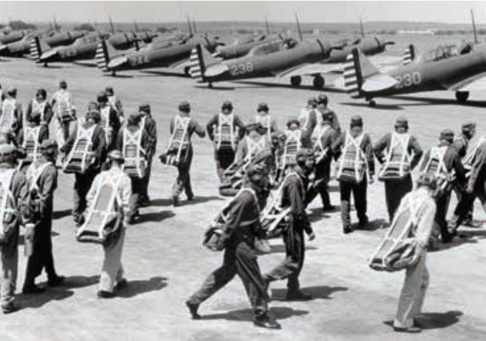
TRAINEE PILOTS RUSH TO THEIR AIRCRAFT PRIOR TO A FLIGHT.