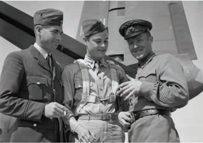
AMERICAN, RUSSIAN, AND ROYAL AIR FORCE PILOTS, 1943.