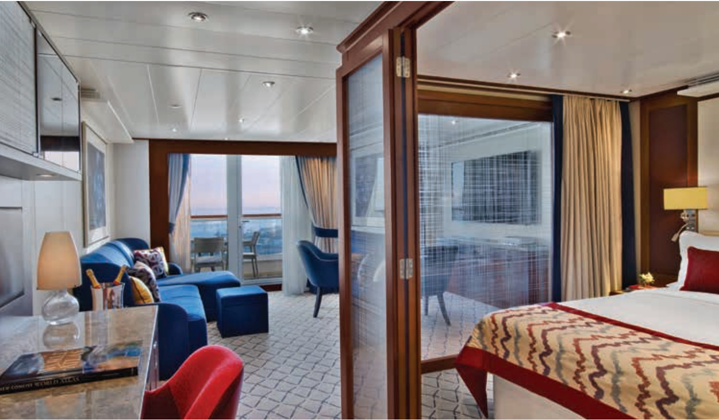
PENTHOUSE (Category PH)