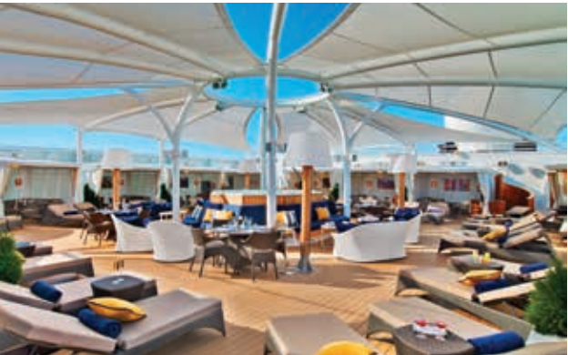
“The Retreat” on Seabourn Ovation