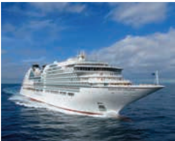
Seabourn Ovation sailing off the coast of France