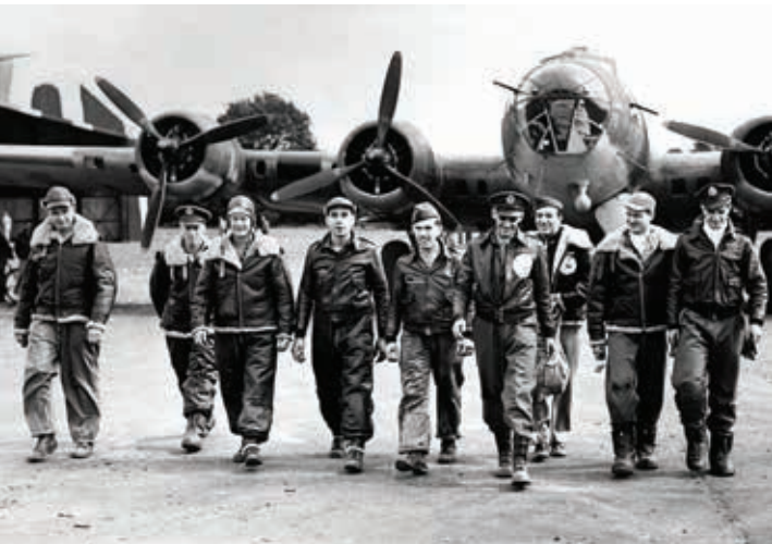
MIGHTY EIGHTH AIR FORCE

Air superiority came with a cost. Some airmen remember a saying that to “fly in the Eighth Air Force then was like holding a ticket to a funeral —your own.” The Eighth Air Force suffered more than 47,000 casualties, including 26,000 dead. Every American military cemetery in Europe features the names, squadrons, and bomb groups of the Eighth Air Force.