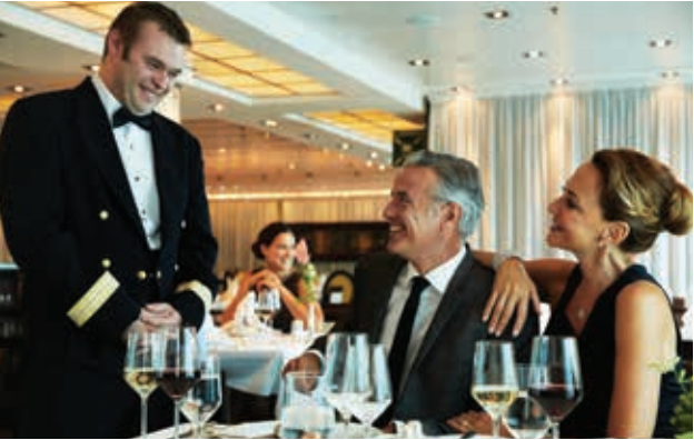
The Grill by Thomas Keller on Seabourn Ovation

Seabourn Ovation has been exclusively chartered by The National WWII Museum for its valued guests. Delivering a wealth of amenities and a fresh vision to small ship cruising, the Ovation is the perfect host for this once-in-a-lifetime, illuminating journey.