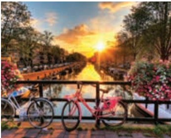
View of the canal in Amsterdam