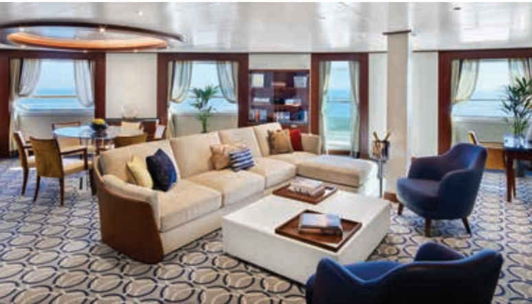
SIGNATURE SUITE (Category SS)