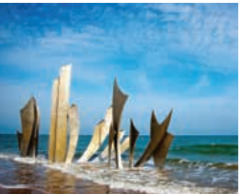
Les Braves sculpture, Omaha Beach, Normandy, France