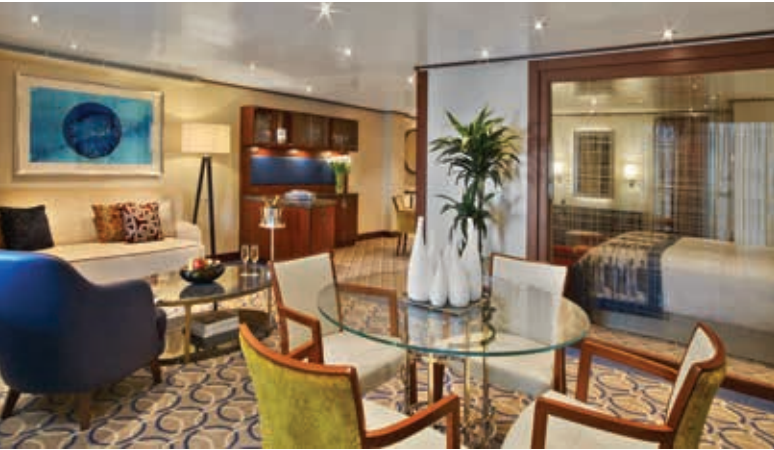
OWNER'S SUITE (Category OW)