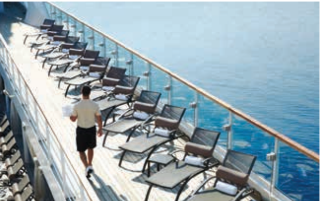
Seabourn Ovation Top Deck

“An Iconic Journey of Remembrance”— Boy, you got that right! Organization, support, service, accommodations, guides, historians—everything executed perfectly made this once-in-a-lifetime trip a once in a lifetime experience. Thank you!”