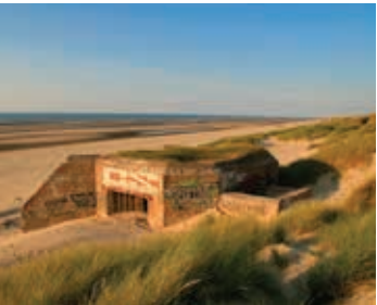
A German concrete bunker, part of Hitler's Atlantic Wall, at Dunkirk, France

Imperial War Museum Duxford is the UK’s largest aviation museum. Aircraft restoration and maintenance takes place on site, allowing visitors to view vintage planes in various stages of display or readiness. The American Air Museum occupies a large space on the its campus. With displays focusing on the Americans in World War II and after, this museum is a slice of American history in the east of England. Accommodations: Seabourn Ovation (B, L, D)