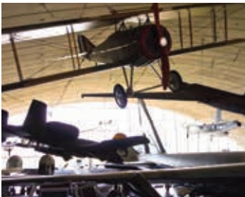
Imperial War Museum in Duxford