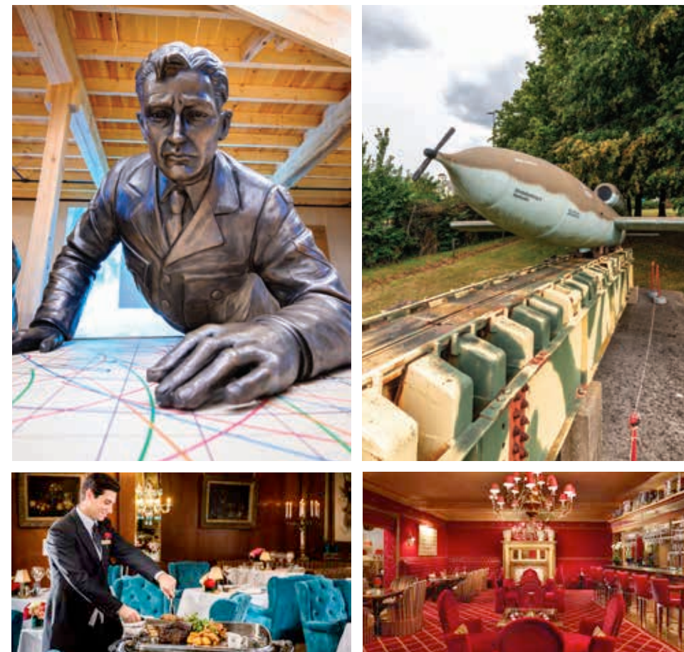
Photo Left: Bentley Priory Museum, Stanmore, Harrow, London. Photo Right: V-1 flying bomb at Imperial War Museum, Duxford, Cambridge, UK. Bottom photos: Rubens at the Palace hotel.

Accommodations: Grand Atlantic Hamburg (2 breakfasts, 1 lunch, 2 receptions, 1 dinner)