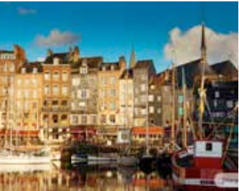
Le Havre harbor, Normandy, France