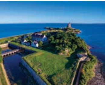
Aerial view of the Vauban fortifications and the tower at La Hougue.