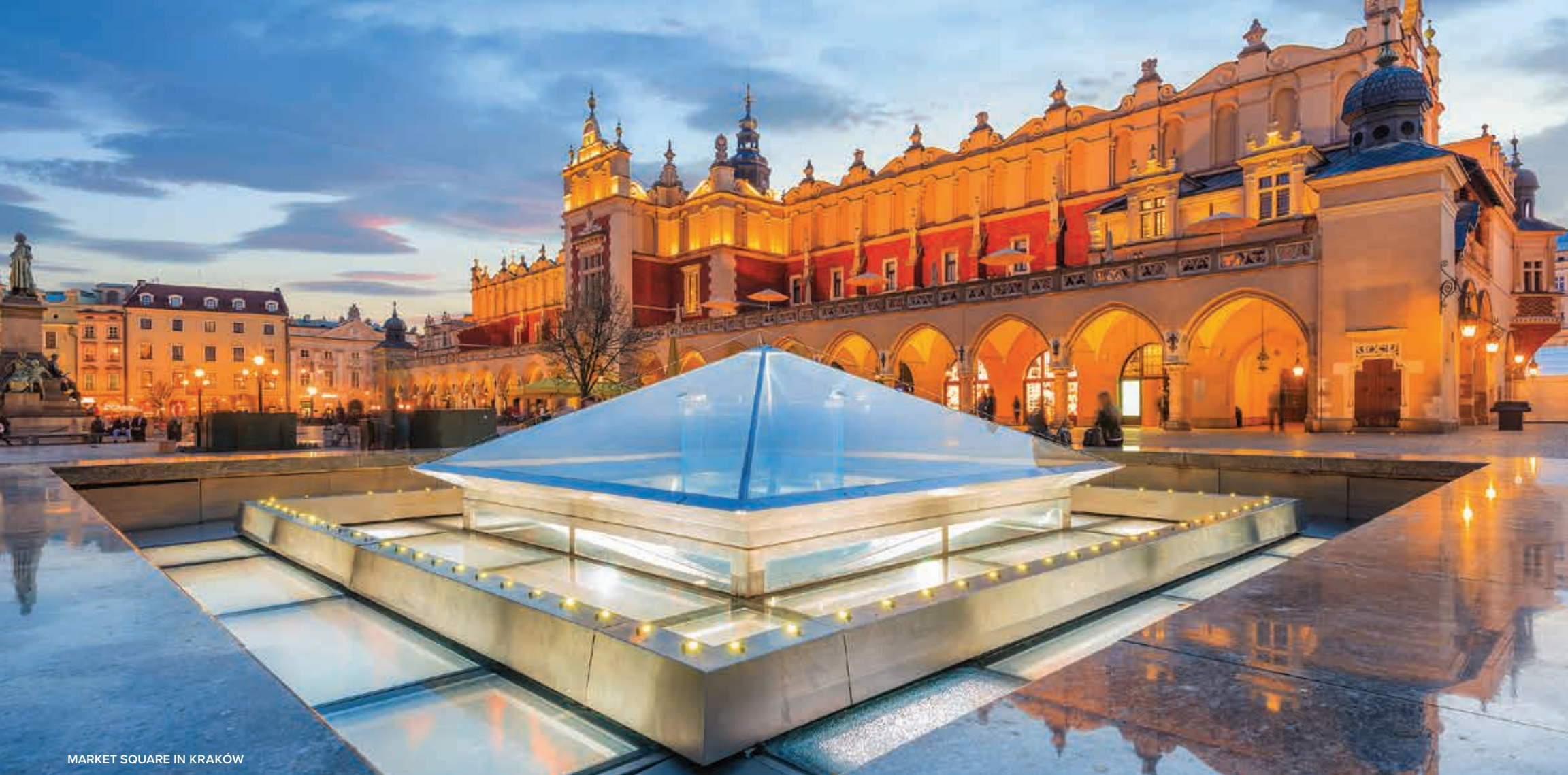
MARKET SQUARE IN KRAKÓW