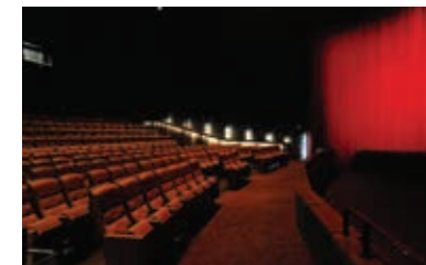
BEYOND ALL BOUNDARIES A UNIQUE CINEMA EXPERIENCE