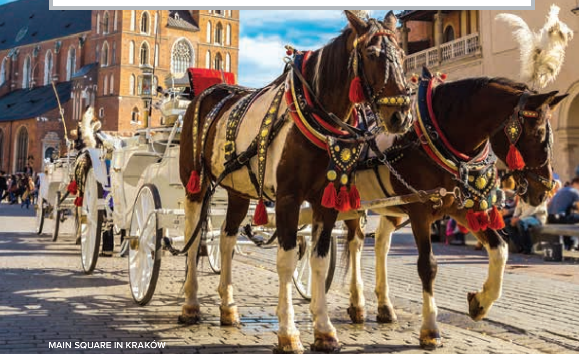
MAIN SQUARE IN KRAKÓW