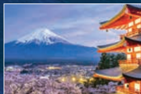
Victory in the Pacific: Japan & Okinawa

Victory in the Pacific: Pearl Harbor, Saipan, Tinian, Guam, and the Anniversary of the Battle of Iwo Jima