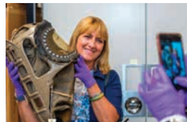
OUT OF THE VAULT MUSEUM TOUR WITH A MUSEUM CURATOR