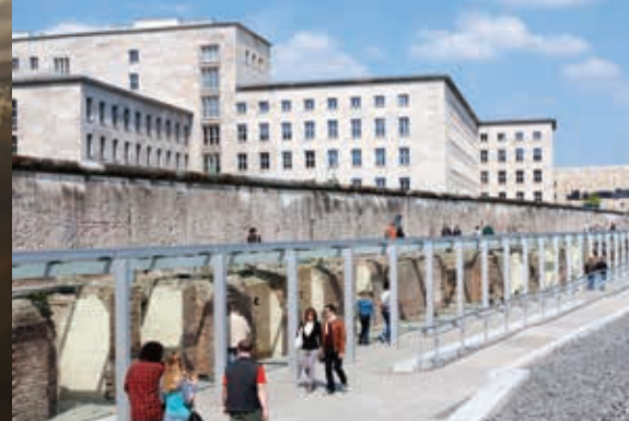
THE TOPOGRAPHY OF TERROR MUSEUM, BERLIN

This museum opened to the public on the 60th anniversary of the 1944 Warsaw Uprising, and is one of the most visited places in Warsaw. It is a tribute to all those who fought and died to free Poland and depicts the struggle of everyday life during the horror of occupation. The exhibits feature photographs, recordings, and videos from before, during, and after the uprising; a replica of a Liberator B-24J bomber used by the Allies during air drops; a 3-D movie of the destruction of Warsaw during the uprising; and a recreation of sewer tunnels used by the Resistance to move around the city.