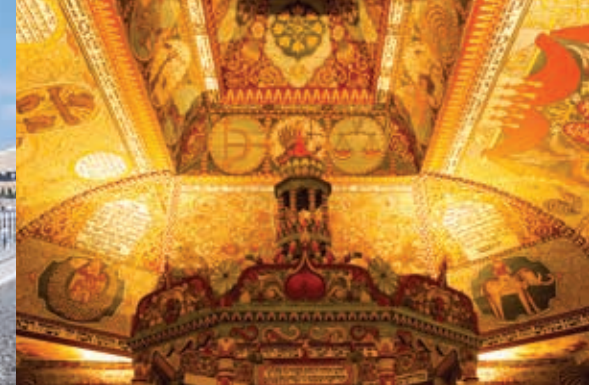
THE POLIN MUSEUM, WARSAW, POLAND