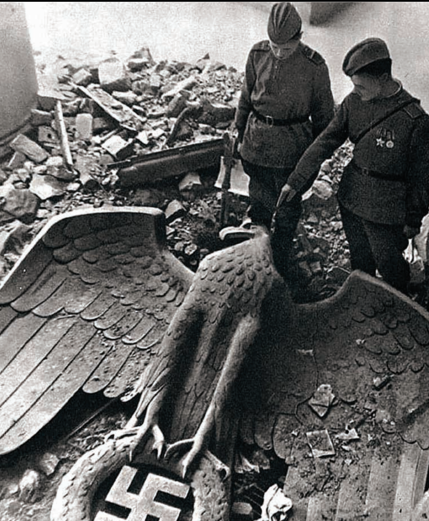
COVER PHOTO: AERIAL VIEW OF KRAKÓW. PHOTO PAGE 2: RUSSIAN SOLDIERS LOOKING AT A TORN DOWN GERMAN NAZI EAGLE WITH SWASTIKA EMBLEM LYING IN THE RUINS OF THE REICH CHANCELLERY AFTER THE FALL OF BERLIN—1945, BERLIN, GERMANY.