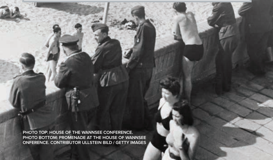
PHOTO TOP: HOUSE OF THE WANNSEE CONFERENCE. PHOTO BOTTOM: PROMENADE AT THE HOUSE OF WANNSEE CONFERENCE.

Accommodations: Ritz-Carlton Berlin (B, L)