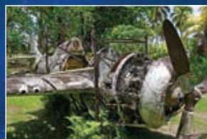
Victory in the Pacific: Battle of Guadalcanal