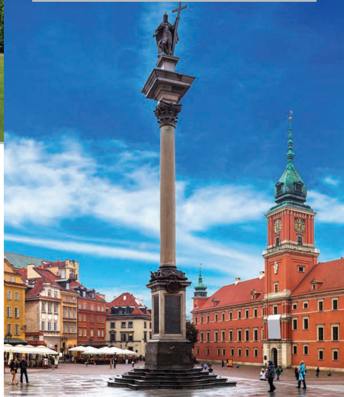
ROYAL CASTLE AND SIGISMUND COLUMN IN WARSAW

Bid farewell to Poland this morning and transfer to Warsaw Chopin Airport (WAW) for individual flights back to the United States. (B)