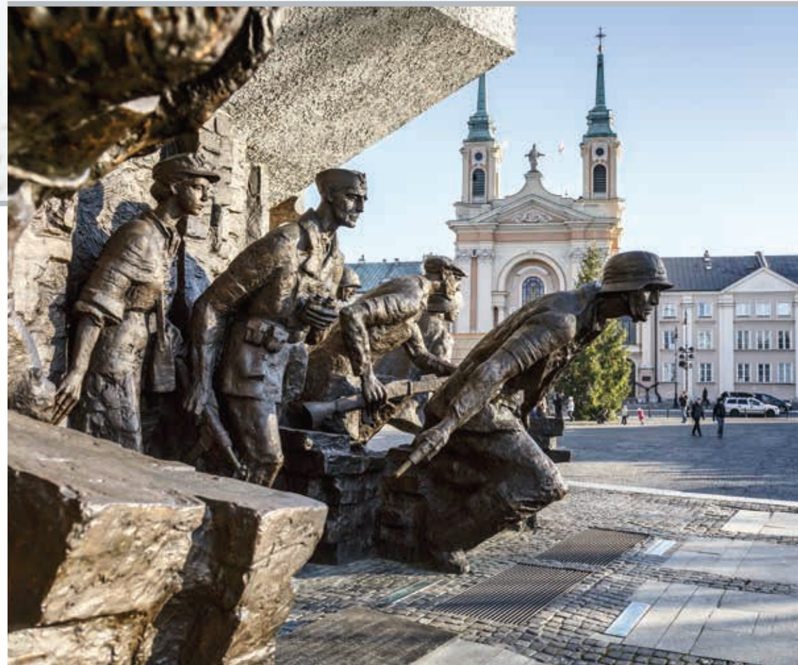
JEWISH UPRISING MUSEUM IN WARSAW