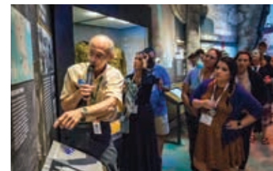
EARLY ACCESS TO CAMPAIGNS OF COURAGE GALLERIES