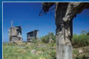
Victory in the Pacific: World War II in the Philippines