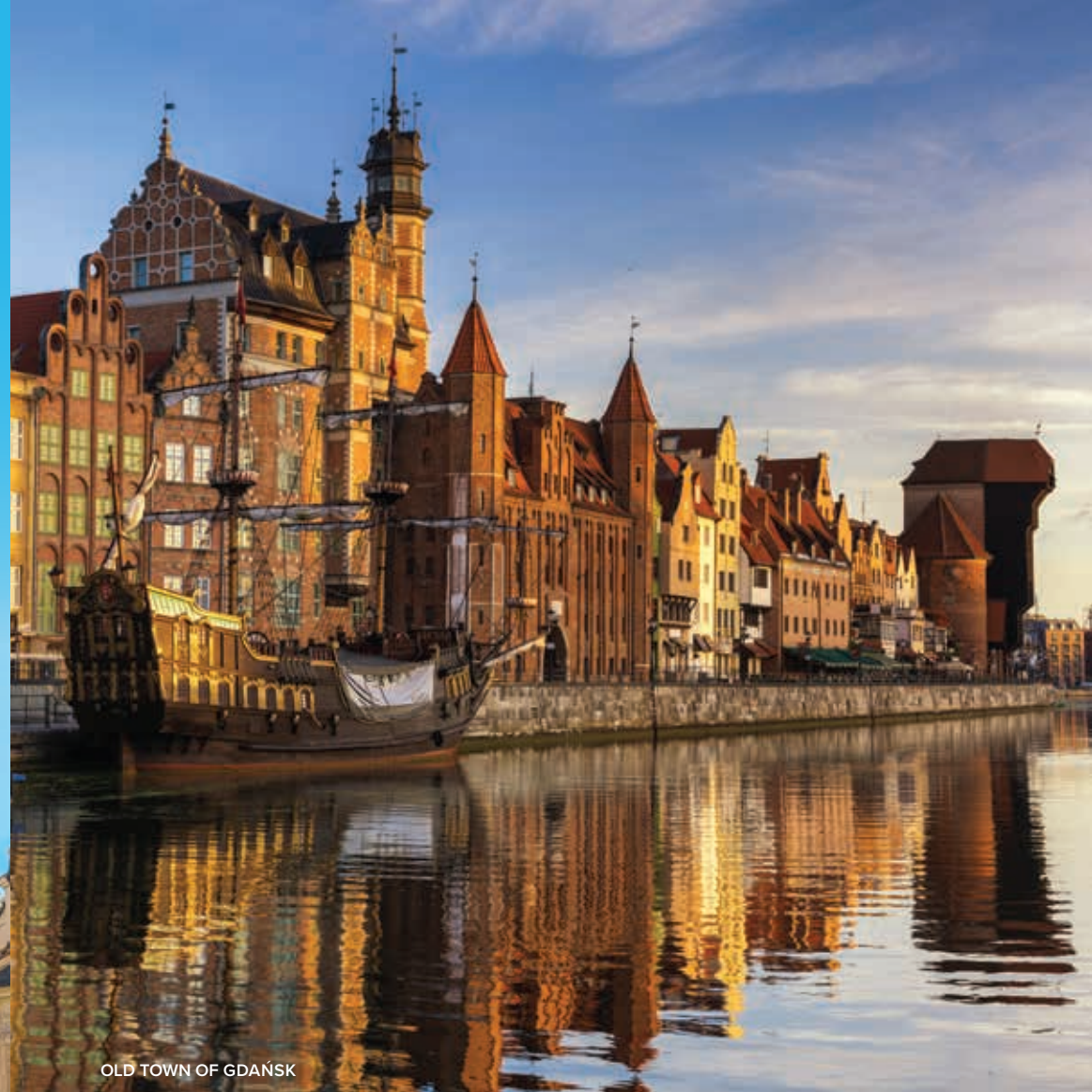
OLD TOWN OF GDAŃSK

Accommodations: Sofitel Grand Sopot (B, D)