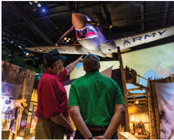
The Road to Tokyo Gallery, Campaigns of Courage