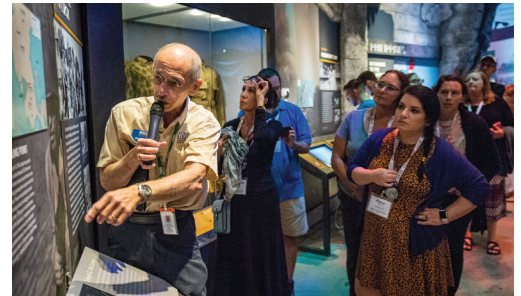
EARLY ACCESS TO CAMPAIGNS OF COURAGE GALLERIES