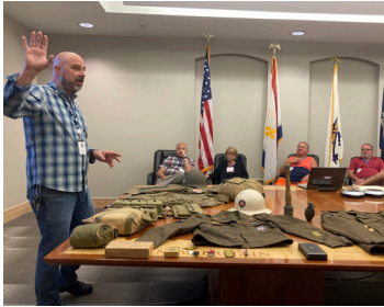
Out of the Vault Museum Experience