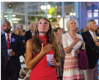
Expressions of America Experience