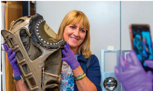
OUT OF THE VAULT MUSEUM TOUR WITH A MUSEUM CURATOR