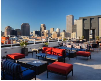
Rosie's On The Roof, Higgins Hotel