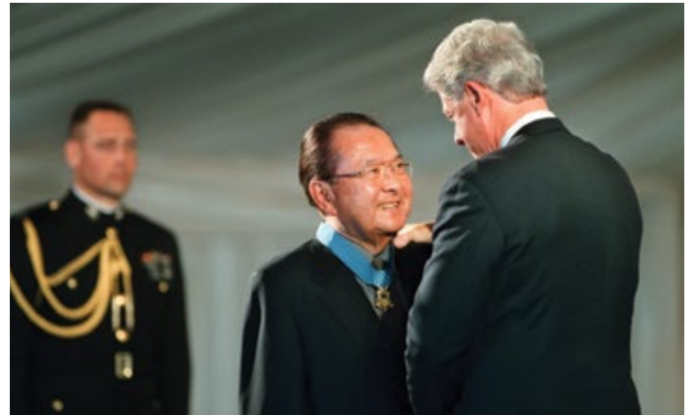
PHOTO: US President Bill Clinton congratulates US Senator Daniel Inouye of Hawaii, after awarding him the Congressional Medal of Honor on June 21, 2000, at the White House in Washington, DC, for his service in World War II.

PHOTO: First Lt. Daniel Inouye.