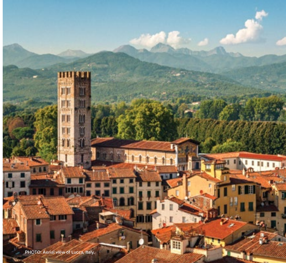
PHOTO: Aerial view of Lucca, Italy.