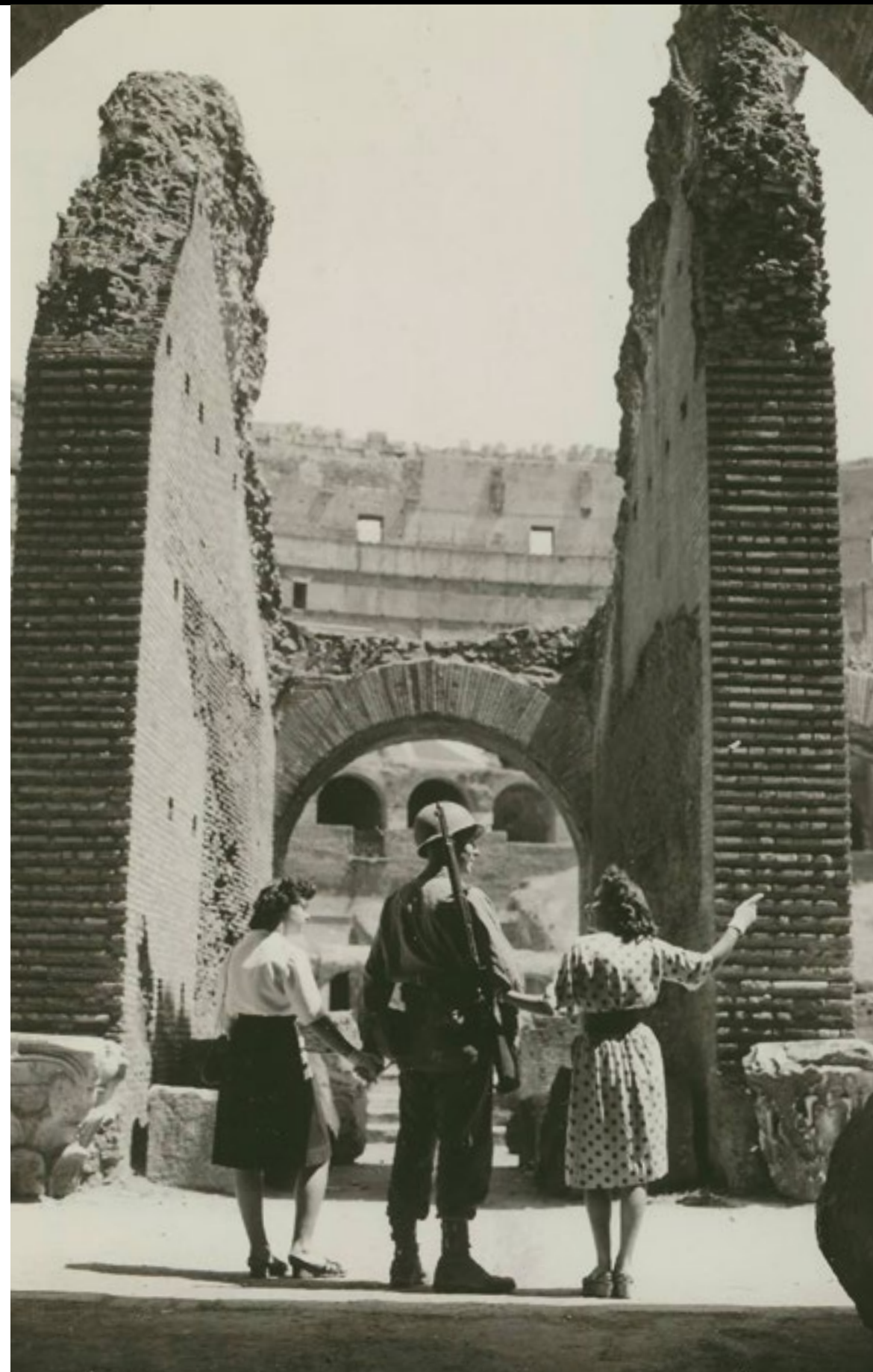
PHOTO Page 3: A GI visits the Coliseum with local Italian guides.