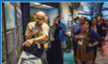
PRIVATE GUIDED GALLERY TOURS