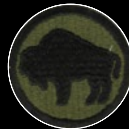
A 92nd Infantry Division Patch