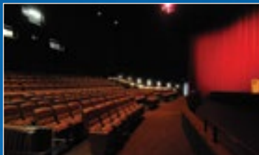
EXCLUSIVE 4-D CINEMA EXPERIENCE

Experience the #1 Attraction in New Orleans on this custom-curated, four-day group tour to The National WWII Museum