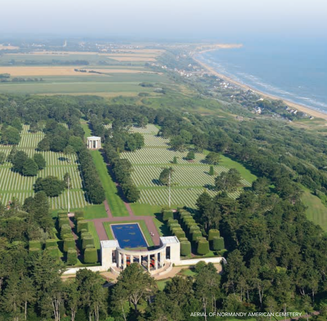
AERIAL OF NORMANDY AMERICAN CEMETERY