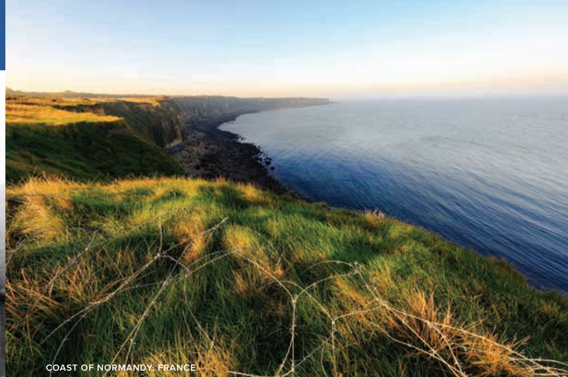
COAST OF NORMANDY, FRANCE