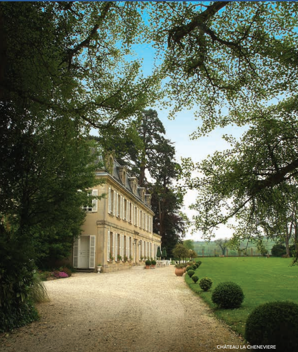
CHÂTEAU LA CHENEVIERE