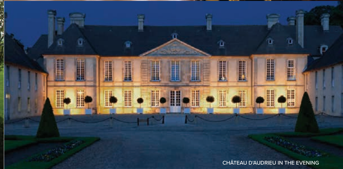
CHÂTEAU D'AUDRIEU IN THE EVENING