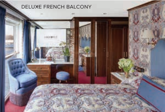
DELUXE FRENCH BALCONY