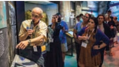
Private Guided Tours