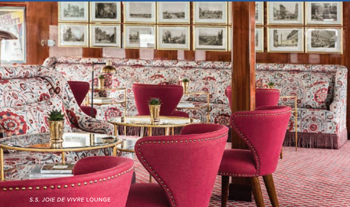
S.S. JOIE DE VIVRE LOUNGE