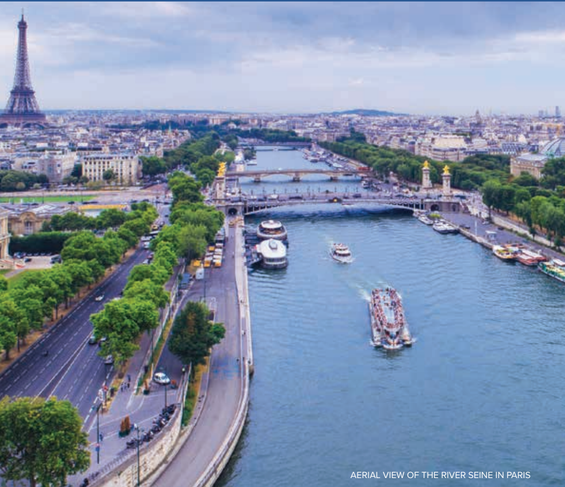
AERIAL VIEW OF THE RIVER SEINE IN PARIS