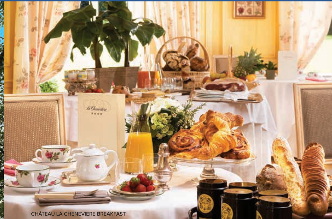
CHÂTEAU LA CHENEVIERE BREAKFAST