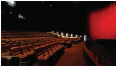
Exclusive 4-D Cinema Experience