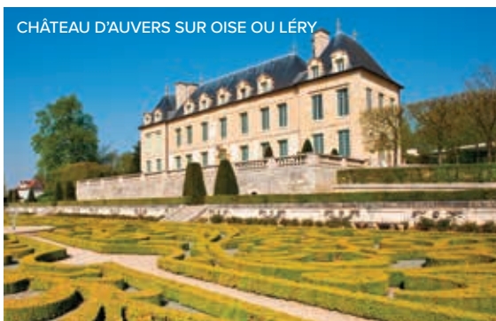
CHÂTEAU D'AUVERS SUR OISE OU LÉRY