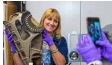
Curator's Collection Tour