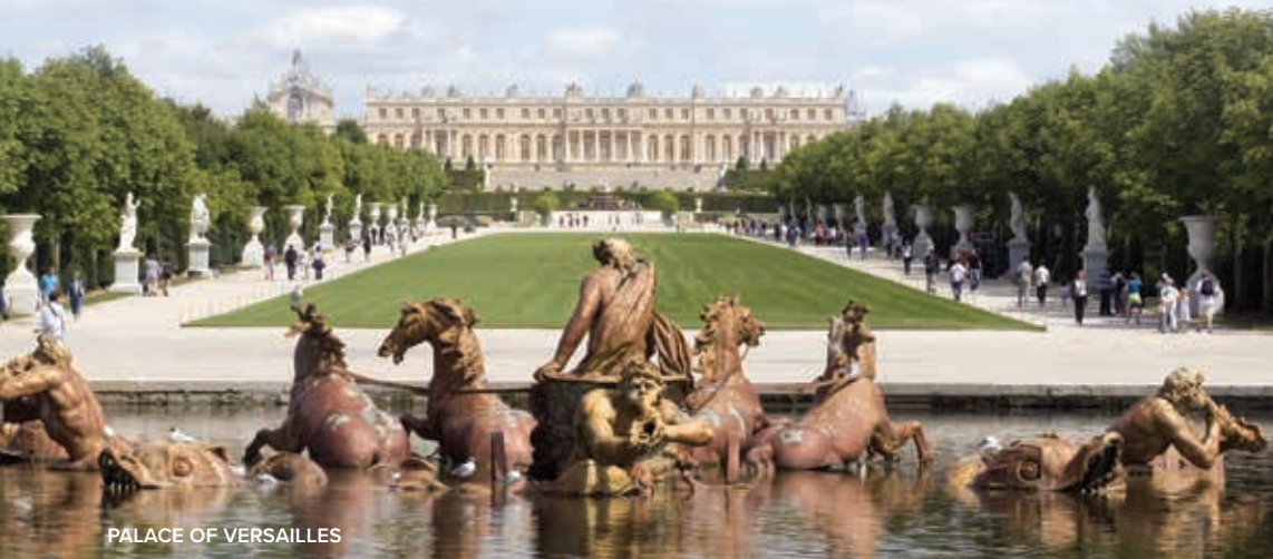
PALACE OF VERSAILLES

Disembark S.S. Joie de Vivre for transfer to Charles de Gaulle Airport (CDG) (B)