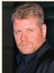
Michael Cudlitz Sgt. Denver "Bull" Randleman