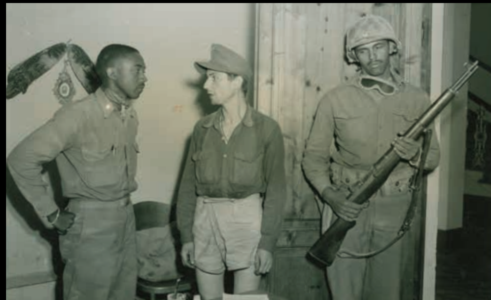
PHOTO ABOVE: View of Borgo a Mozzano. PHOTO BELOW: First German prisoner taken by patrol of the 92nd Infantry Division after crossing the Arno River at the Gothic Line is shown being questioned by 1st Lt. Lawrence D. Spencer, of Elizabeth, New Jersey, September 2, 1944.

Accommodations: Grand Universe Lucca, Autograph Collection (B)