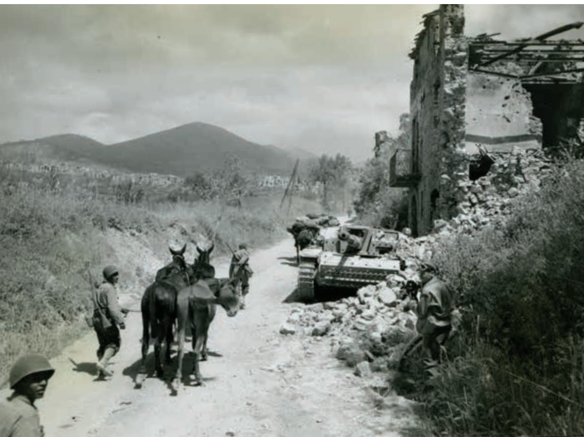
PHOTO: African American soldiers lead mules to the front in Italy and pass a wrecked German tank lying by the roadside. A Signal Corps member films them with a camera in the lower right corner, May 21, 1944.

Following the initial landings in the south, the Allies found themselves bogged down facing the formidable Gustav Line, a network of German defenses in the mountains between Naples and Rome. Attempting to outflank this line, the 3rd and 45th Infantry Divisions achieved a successful amphibious landing in Anzio on January 25, 1944, but sluggish commanders failed to move rapidly enough, resulting in another stalemate. The destruction of Monte Cassino by the Allies in 1944 served mainly to generate headlines and fodder for German propaganda. The spring thaw in the mountains found the Allies once more on the advance, liberating Rome on June 4, 1944, creating brief headlines around the world that would soon be outshined by the June 6 landings in Normandy. Meanwhile, German Field Marshal Albert Kesselring retreated to the northern Apennines to establish yet another defensive position known to the Allies as the Gothic Line. General Mark Clark's Fifth Army faced a desperate enemy and unforgiving terrain, and it was here he coined the phrase that defined the Italian campaign: "Mud, Mountains, and Mules."