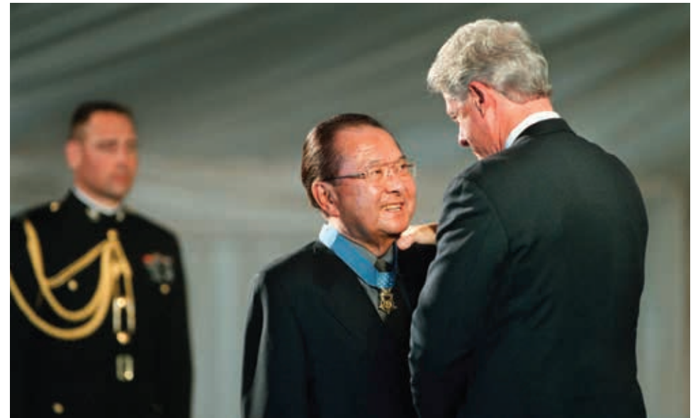
PHOTO: US President Bill Clinton congratulates US Senator Daniel Inouye of Hawaii, after awarding him the Congressional Medal of Honor on June 21, 2000, at the White House in Washington, DC, for his service in World War II.

PHOTO: First Lt. Daniel Inouye.