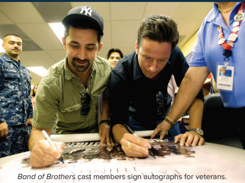
Band of Brothers cast members sign autographs for veterans.