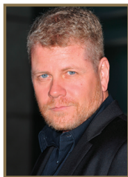
Michael Cudlitz Sgt. Denver "Bull" Randleman