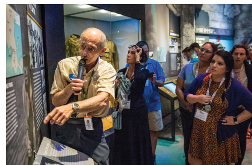
EARLY ACCESS TO CAMPAIGNS OF COURAGE GALLERIES