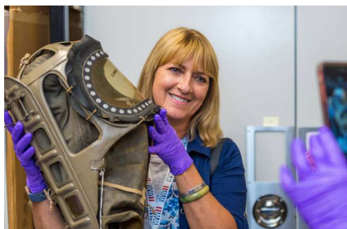
OUT OF THE VAULT MUSEUM TOUR WITH A MUSEUM CURATOR