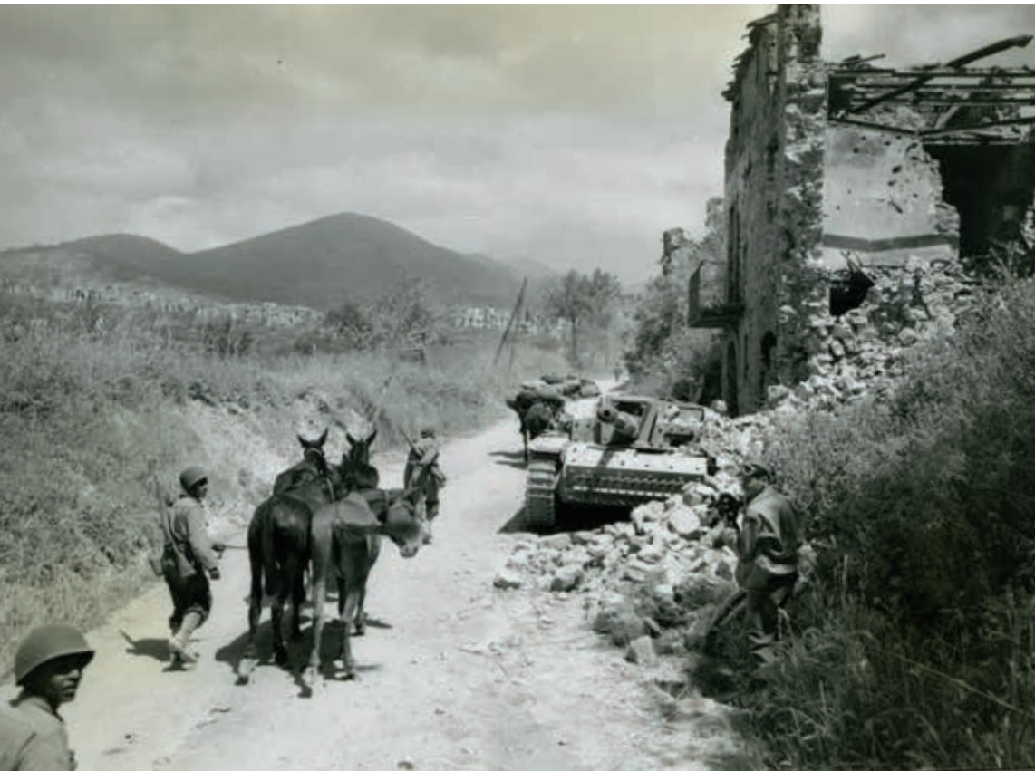
PHOTO: African American soldiers lead mules to the front in Italy and pass a wrecked German tank lying by the roadside. A Signal Corps member films them with a camera in the lower right corner, May 21, 1944.

Following the initial landings in the south, the Allies found themselves bogged down facing the formidable Gustav Line, a network of German defenses in the mountains between Naples and Rome. Attempting to outflank this line, the 36th and 45th Infantry Divisions achieved a successful amphibious landing in Anzio on January 25, 1944, but sluggish commanders failed to move rapidly enough, resulting in another stalemate. The destruction of Monte Cassino by the Allies in 1944 served mainly to generate headlines and fodder for German propaganda. The spring thaw in the mountains found the Allies once more on the advance, liberating Rome on June 4, 1944, creating brief headlines around the world that would soon be outshined by the June 6 landings in Normandy. Meanwhile, German Field Marshal Albert Kesselring retreated to the northern Apennines to establish yet another defensive position known to the Allies as the Gothic Line. General Mark Clark's Fifth Army faced a desperate enemy and unforgiving terrain, and it was here he coined the phrase that defined the Italian campaign: "Mud, Mountains, and Mules."