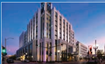
LUXURY ACCOMMODATIONS AT THE HIGGINS HOTEL