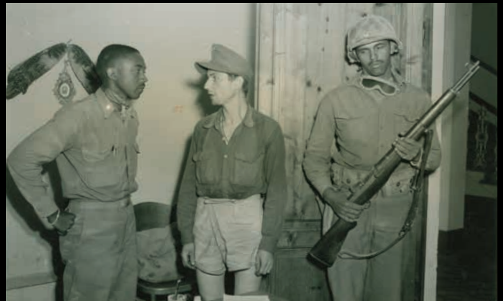
PHOTO ABOVE: View of Borgo a Mozzano. PHOTO BELOW: First German prisoner taken by patrol of the 92nd Infantry Division after crossing the Arno River at the Gothic Line is shown being questioned by 1st Lt. Lawrence D. Spencer, of Elizabeth, New Jersey, September 2, 1944.

Accommodations: Grand Universe Lucca, Autograph Collection (B)