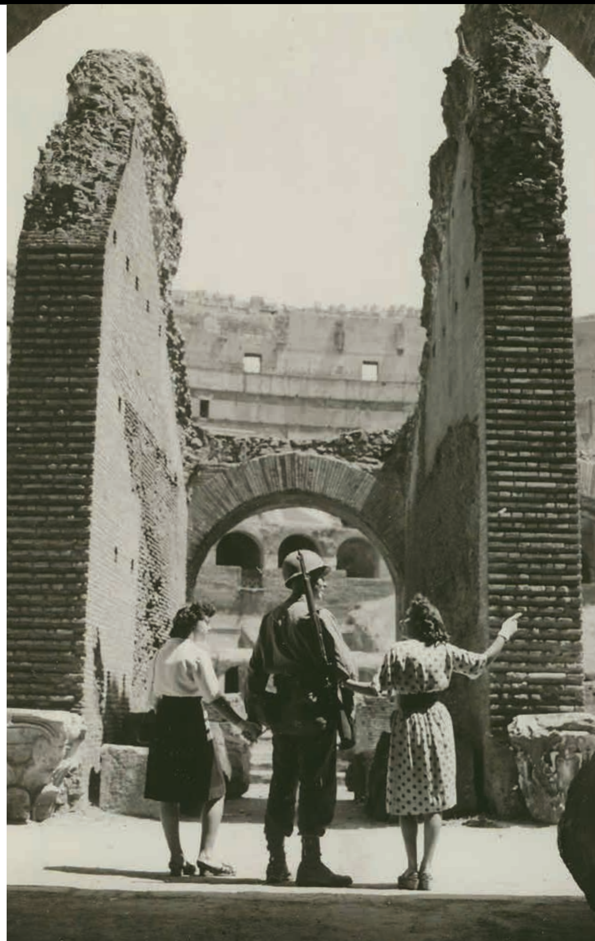
PHOTO Page 3: A GI visits the Coliseum with local Italian guides.