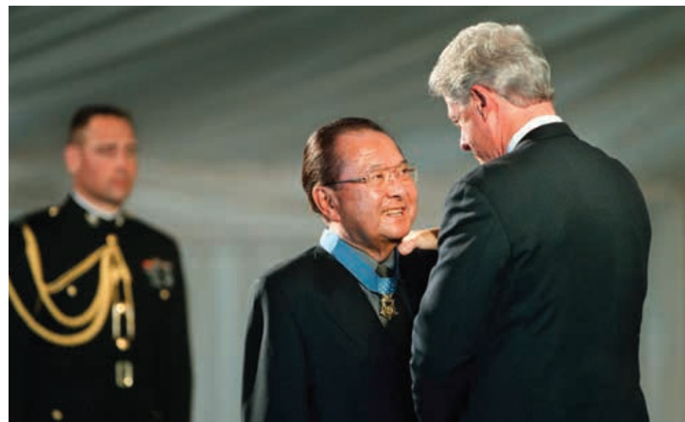
PHOTO: US President Bill Clinton congratulates US Senator Daniel Inouye of Hawaii, after awarding him the Congressional Medal of Honor on June 21, 2000, at the White House in Washington, DC, for his service in World War II.

PHOTO: First Lt. Daniel Inouye.