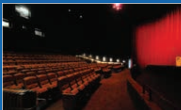
EXCLUSIVE 4-D CINEMA EXPERIENCE

Experience the #1 Attraction in New Orleans on this custom-curated, four-day group tour to The National WWII Museum