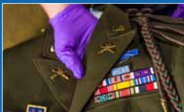
CURATOR'S COLLECTION TOUR