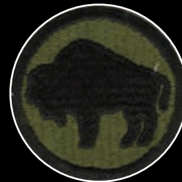
A 92nd Infantry Division Patch