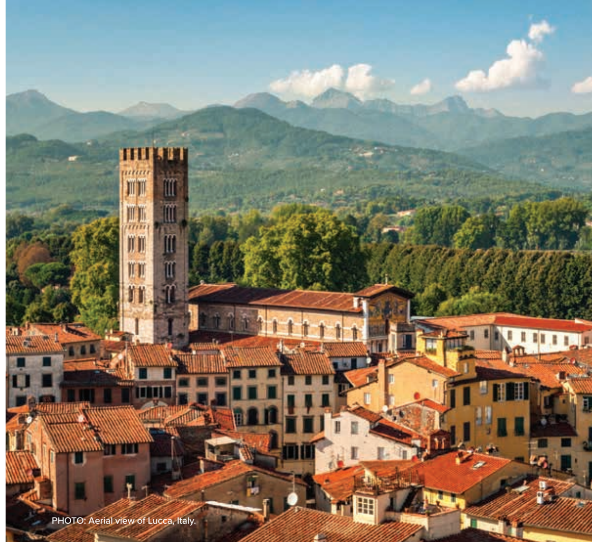
PHOTO: Aerial view of Lucca, Italy.