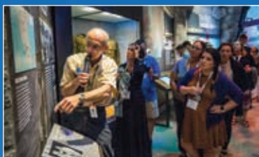
PRIVATE GUIDED GALLERY TOURS