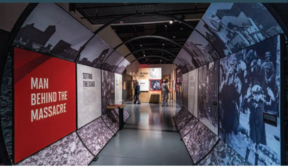
SENATOR JOHN ALARIO, JR. SPECIAL EXHIBITION HALL, HALL OF DEMOCRACY, THE NATIONAL WWII MUSEUM