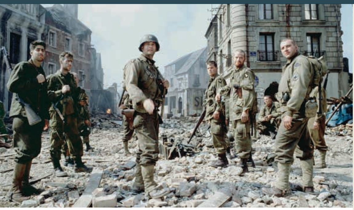
Scene from Saving Private Ryan, 1998, a Paramount/Amblin film with Tom Hanks.