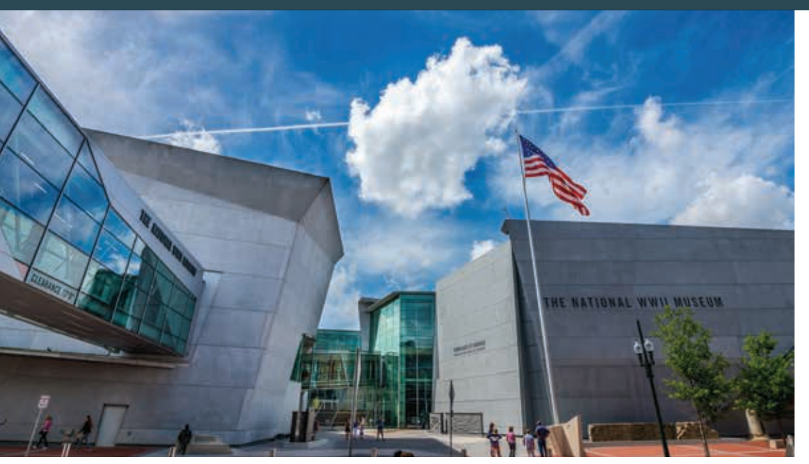
CAMPAIGNS OF COURAGE: EUROPEAN AND PACIFIC THEATERS, THE NATIONAL WWII MUSEUM