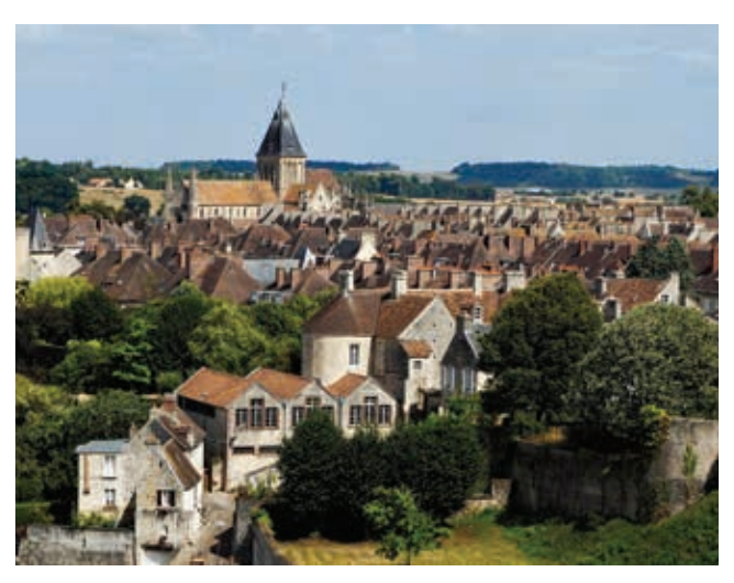
View of Falais Town