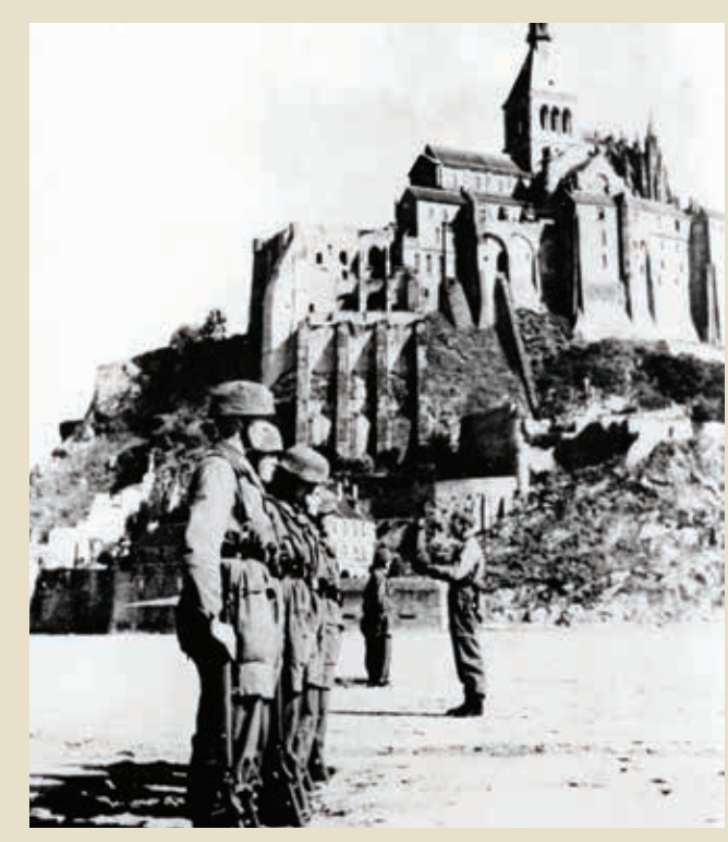
German Wehrmacht paratroopers at the foot of the Mont Saint-Michel monastery, December 1943.