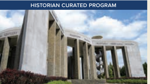
Battle of the Bulge Featuring Roland Gaul Clervaux • Lanzerath • Elsenborn Ridge Malmedy • La Gleize • Bastogne • Luxembourg American Cemetery June 17 – 23, 2020; September 7 – 13, 2020

D-Day: Invasion of Normandy and Liberation of France Normandy Beaches • Arromanches Sainte-Mère-Église Bayeux • Caen • Argentan Pointe du Hoc • Falaise • Chambois April 30 – May 6, 2020; May 7 – 13, 2020; May 21 – 27, 2020; June 2 – 8, 2020; June 4 – 10, 2020; September 3 – 9, 2020; September 10 – 16, 2020; September 24 – 30, 2020; October 1 – 7, 2020; June 3 – 9, 2021