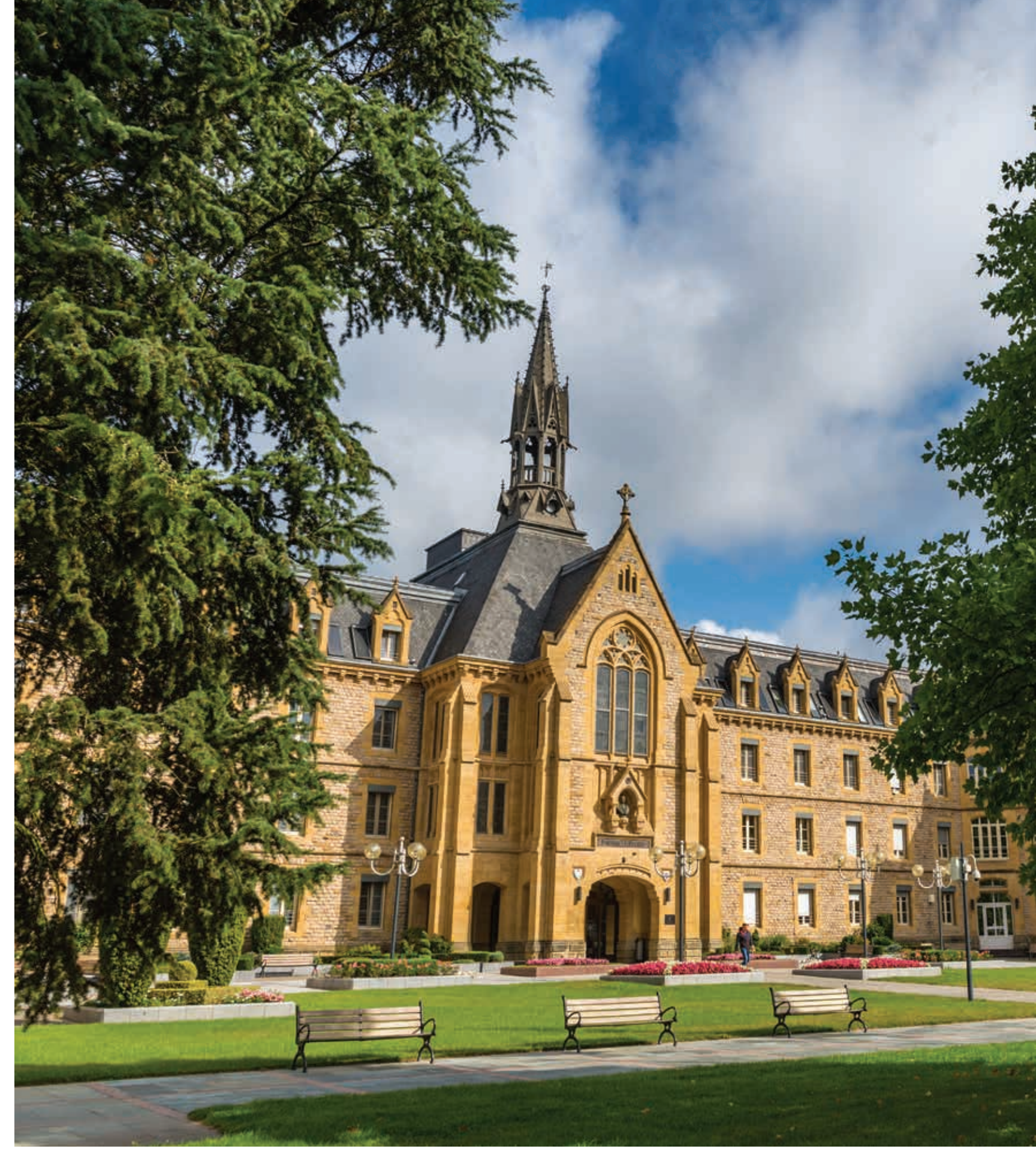
PHOTO: The "Pescatore" Foundation in Luxembourg City, Gen. Patton's HQ during the "Bulge" and Rhineland campaigns.

This morning return to Brussels International Airport at leisure for individual journeys home. (B)