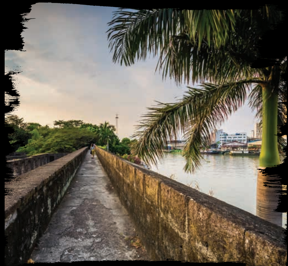
Palm tree and walls along the Pasig River, at Fort Santiago, Intramuros, Manila, The Philippines.