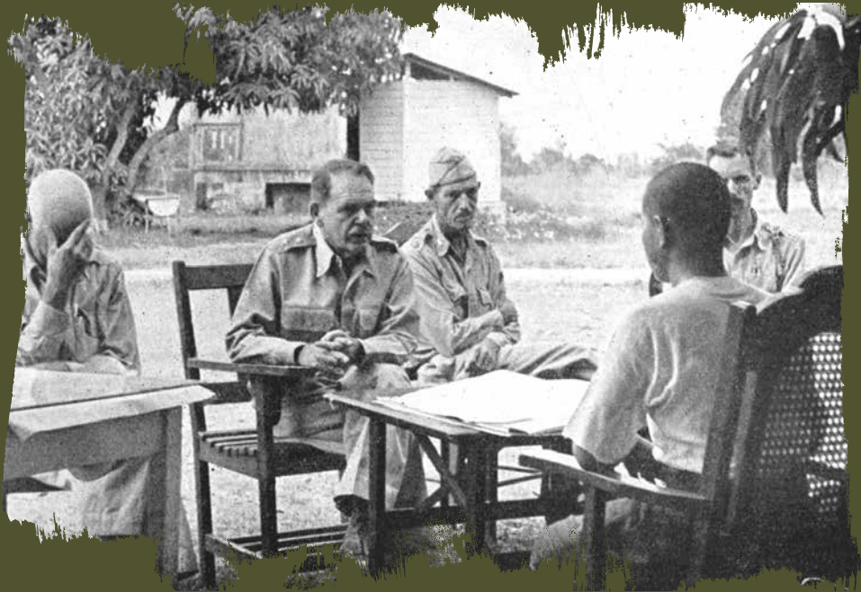
US General Edward P. King's surrender in Bataan.