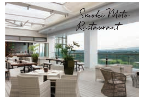
Smoki Moto Restaurant