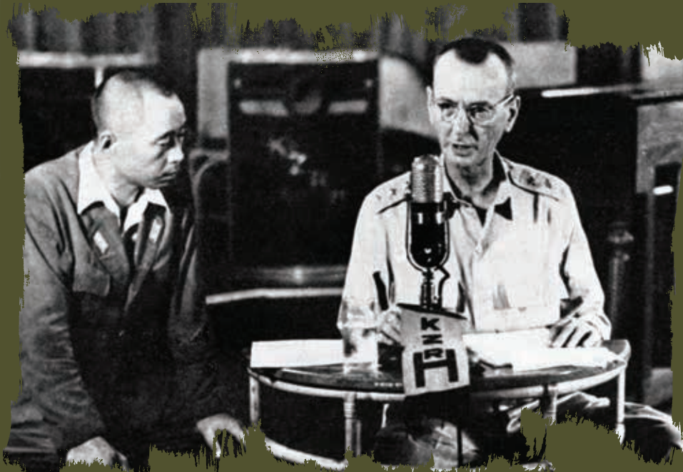
US General Jonathan Wainwright ordering the surrender of American forces in Corregidor supervised by the Japanese.