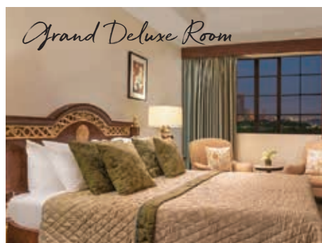
Grand Deluxe Room