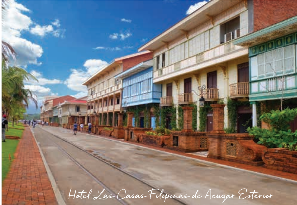
Hotel Las Casas Filipinas de Acuzar Exterior