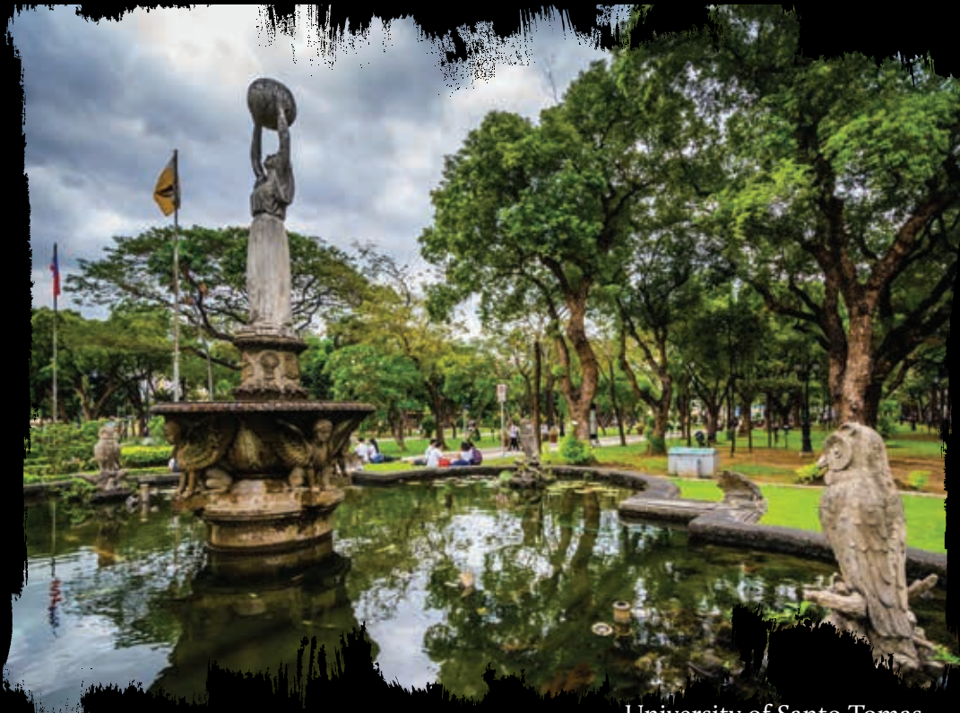
University of Santo Tomas