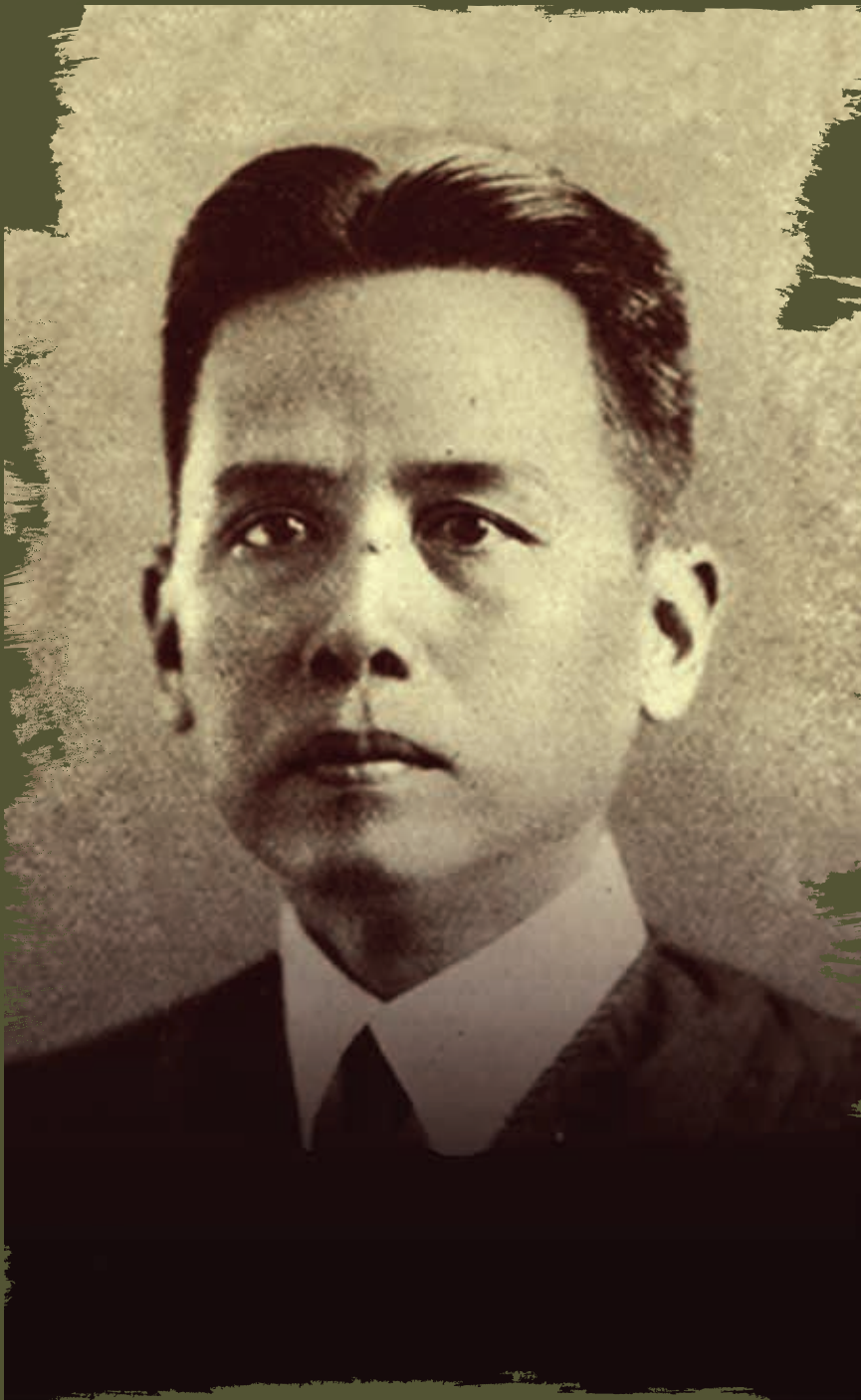
Jose Abad Santos

The day after the surrender of American forces in Bataan, the Japanese captured Abad Santos. He identified himself, and his captors ordered him to cooperate in bringing about the defeat of the remaining Americans. Despite relentless grilling by the Japanese, he refused, resulting in his execution by firing squad. It was reported that Abad Santos refused the blindfold and cigarette offered by his executioners.