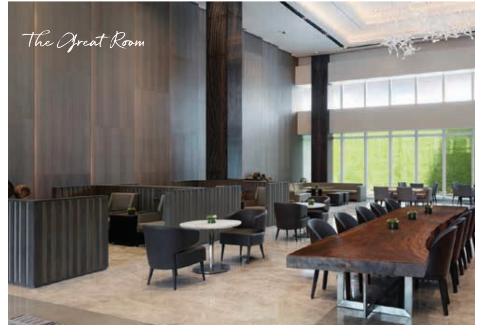
The Great Room