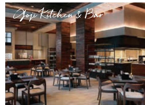
Joji Kitchen & Bar