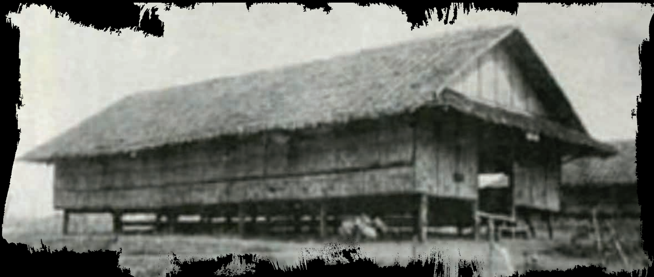
Cabanatuan Prisoner hut.