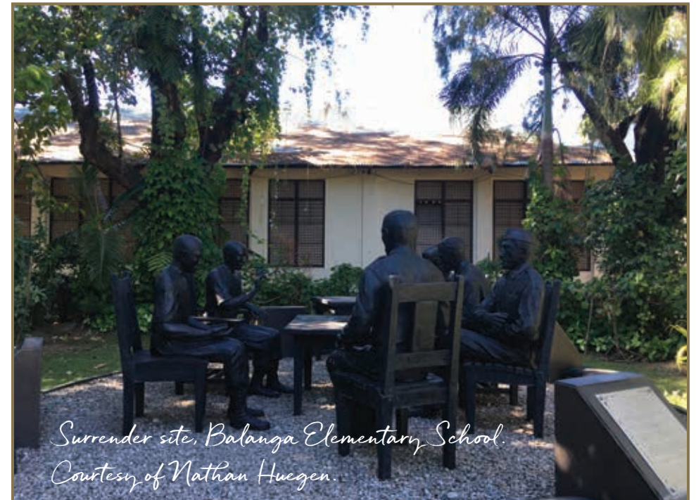
Surrender site, Balanga Elementary School.