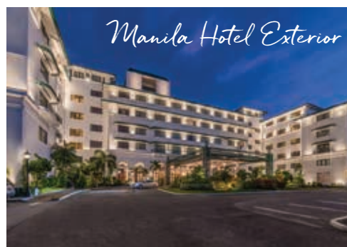
Manila Hotel Exterior