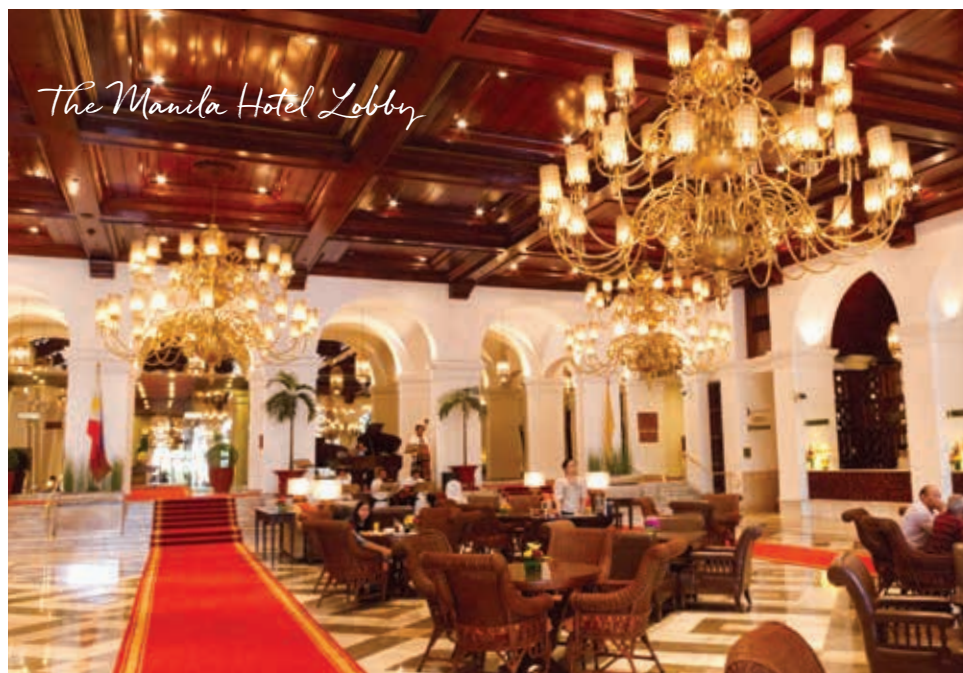
The Manila Hotel Lobby