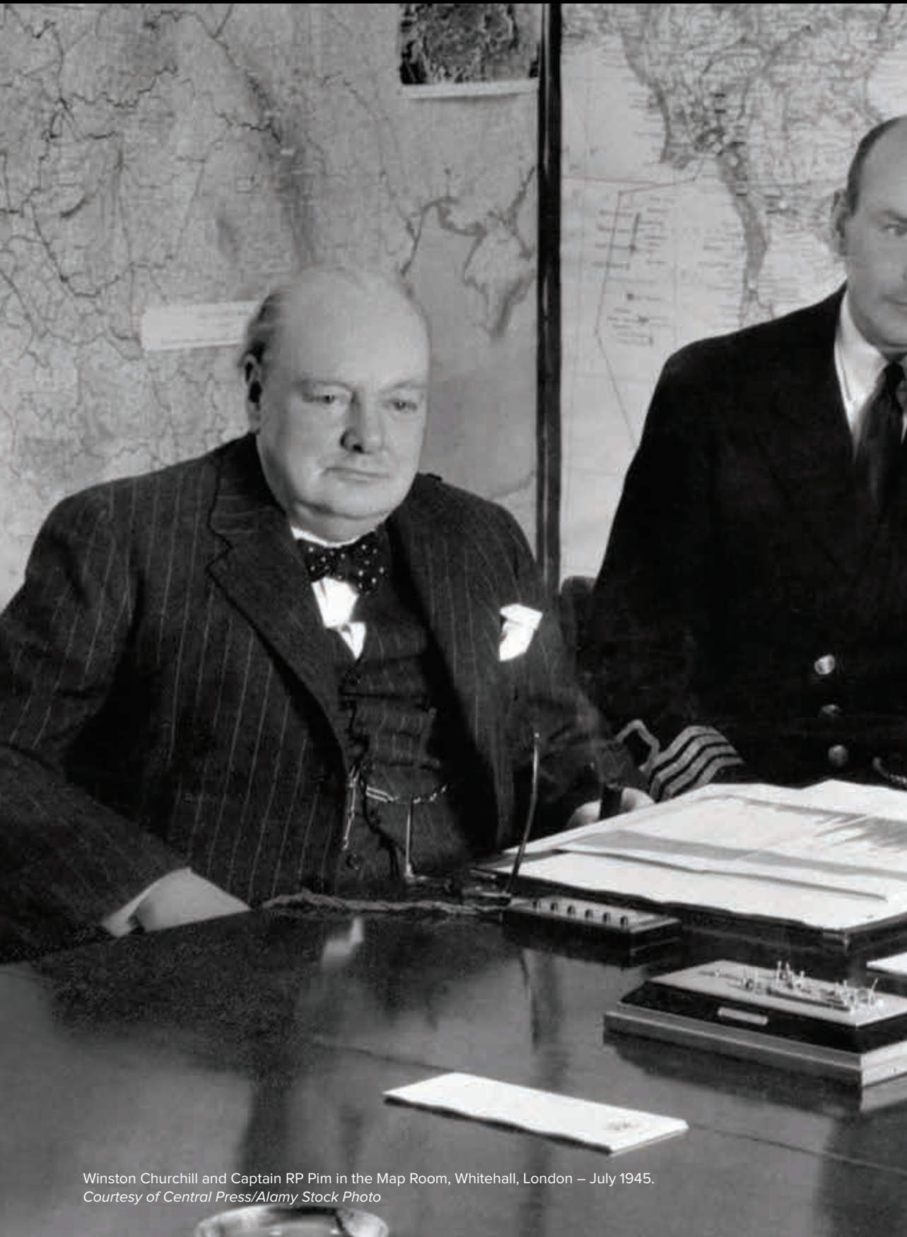
Winston Churchill and Captain RP Pim in the Map Room, Whitehall, London – July 1945.