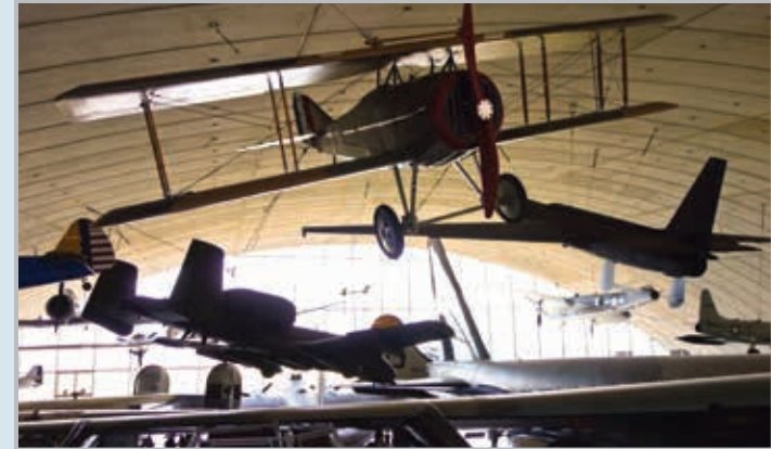
American Air Museum, Duxford.