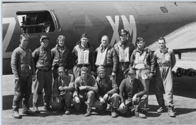
94th Bombardment Group in Bury St. Edmunds.