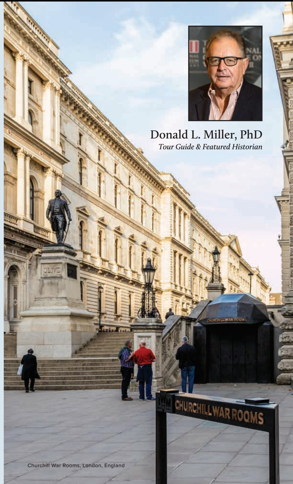
Churchill War Rooms, London, England