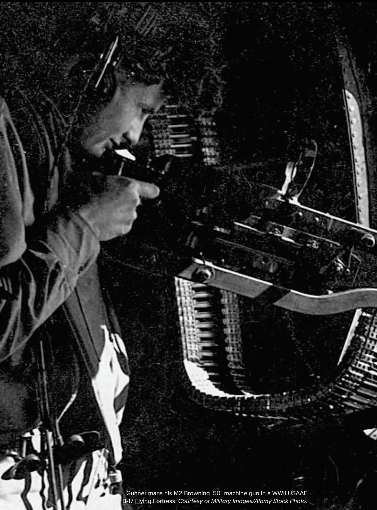
Gunner mans his M2 Browning .50" machine gun in a WWII USAAF B-17 Flying Fortress.