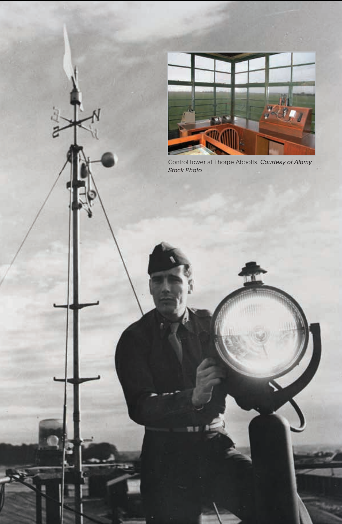
Control tower at Thorpe Abbots.