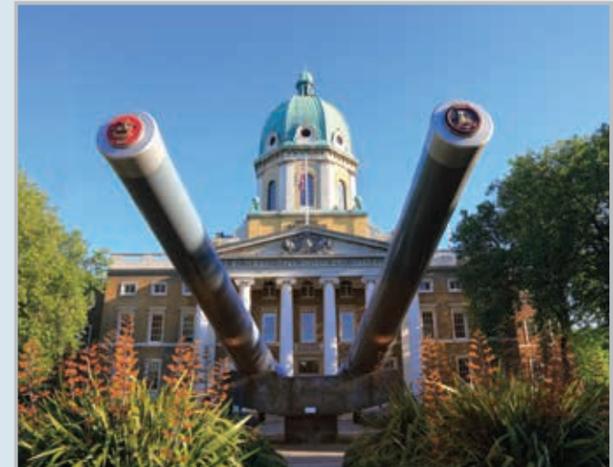
Imperial War Museum London