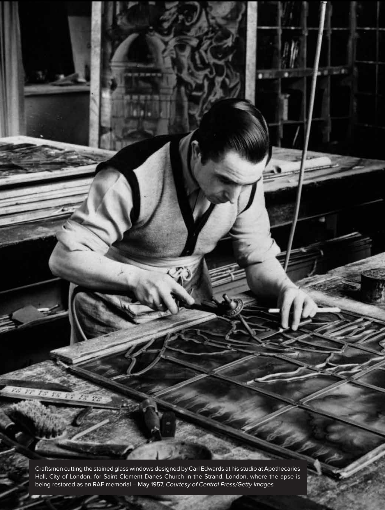
Craftsmen cutting the stained glass windows designed by Carl Edwards at his studio at Apothecaries Hall, City of London, for Saint Clement Danes Church in the Strand, London, where the apse is being restored as an RAF memorial – May 1957.