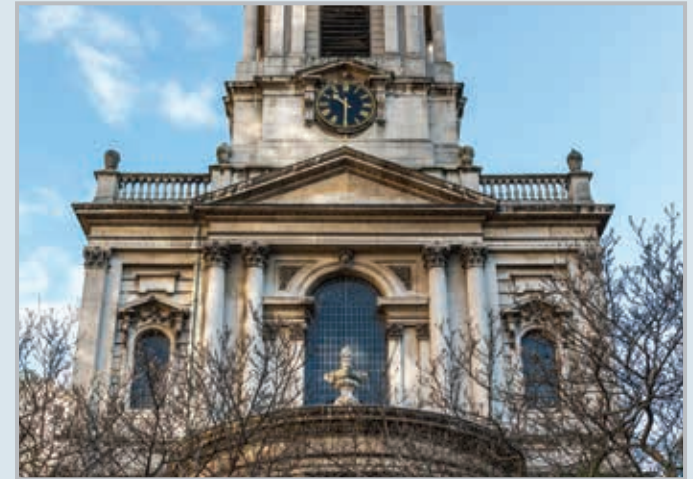
St. Clement Danes Church.