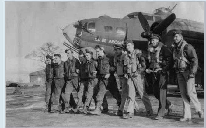
95th Bombardment Group Crew in Horham.