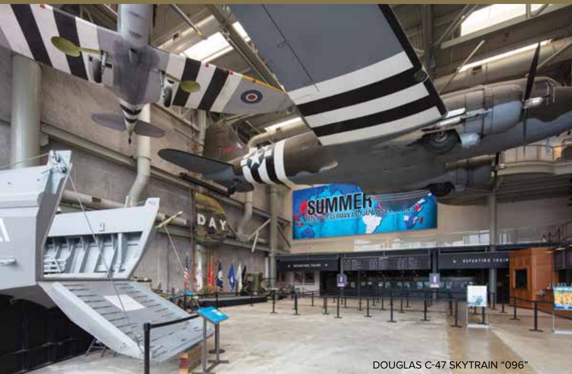
DOUGLAS C-47 SKYTRAIN "096"