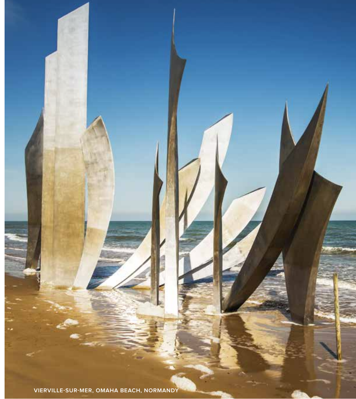
VIERVILLE-SUR-MER, OMAHA BEACH, NORMANDY