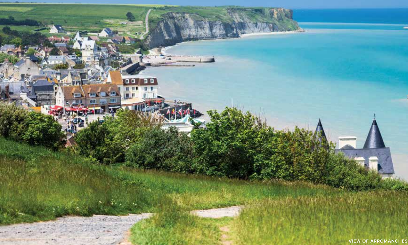
VIEW OF ARROMANCHES