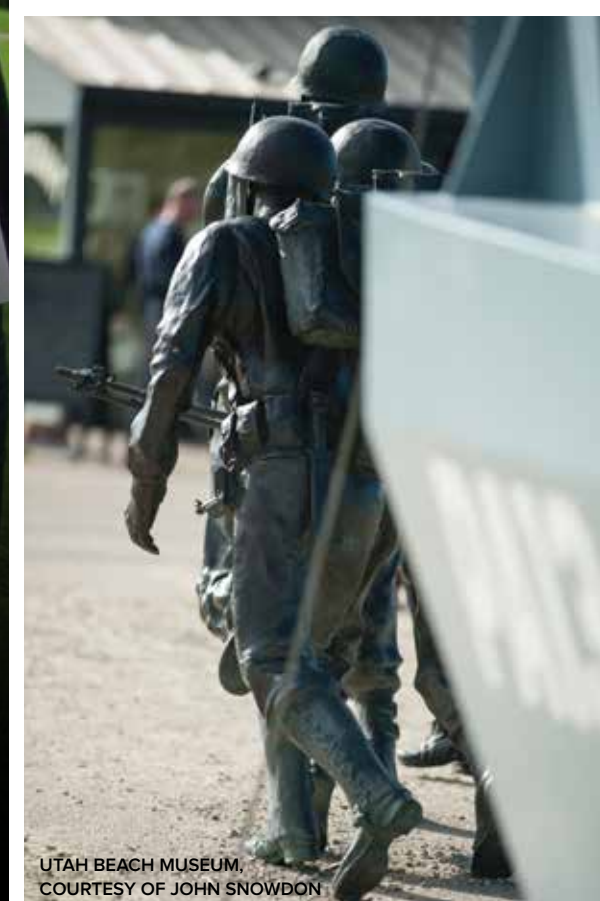
UTAH BEACH MUSEUM