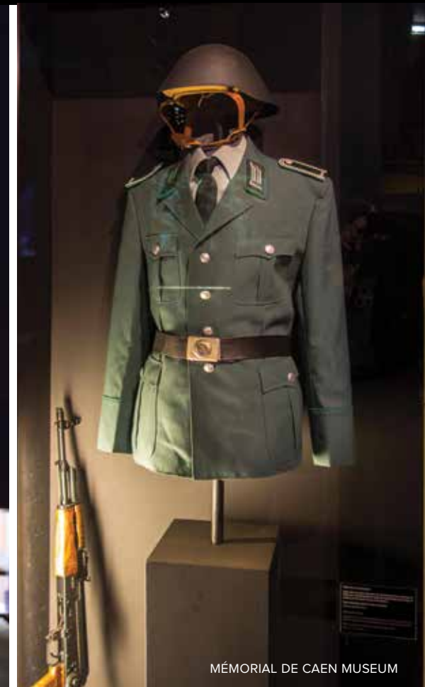
MÉMORIAL DE CAEN MUSEUM