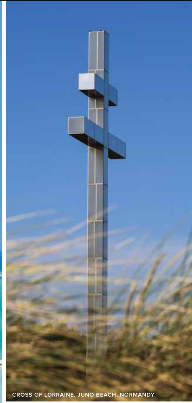
CROSS OF LORRAINE, JUNO BEACH, NORMANDY