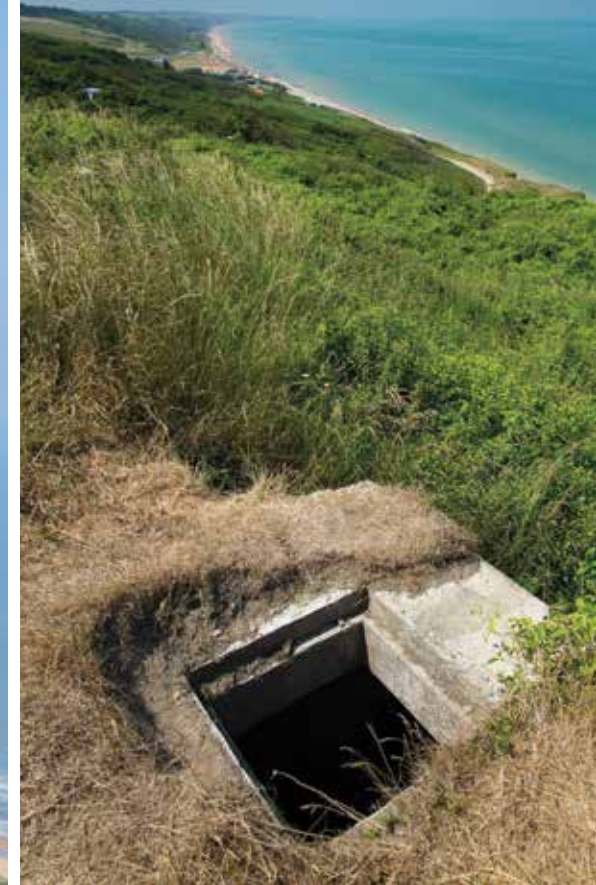
GERMAN STRONGPOINT, OMAHA BEACH