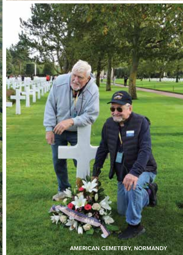
AMERICAN CEMETERY, NORMANDY