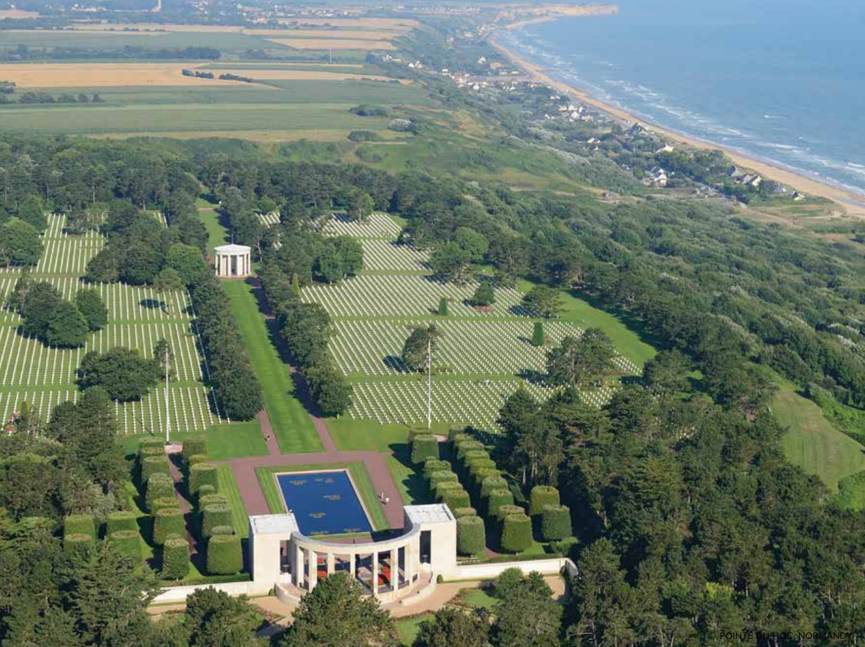
POINTE DU HOC, NORMANDY

Accommodations: Hôtel d'Argouges (B, L, D)