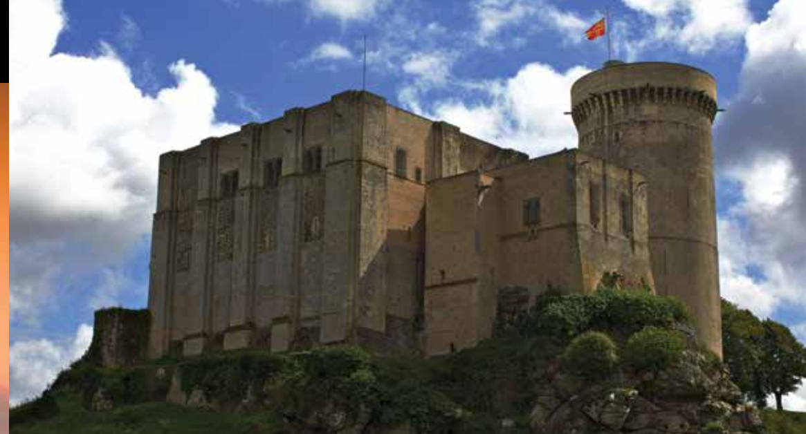
CHÂTEAU DE FALAISE

One of the most scenic landscapes of France beckons you to explore its culture, rich history, architecture, and renowned culinary traditions.