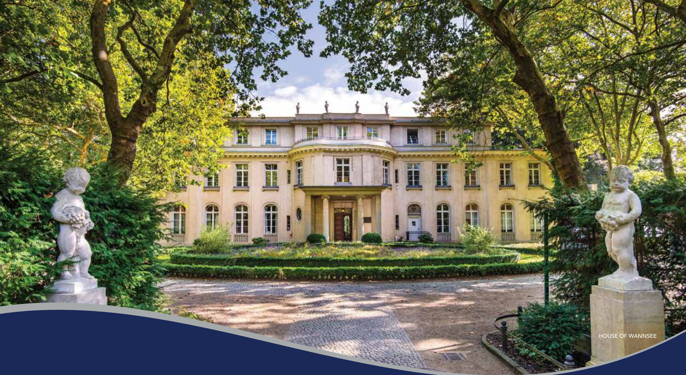
HOUSE OF WANNSEE