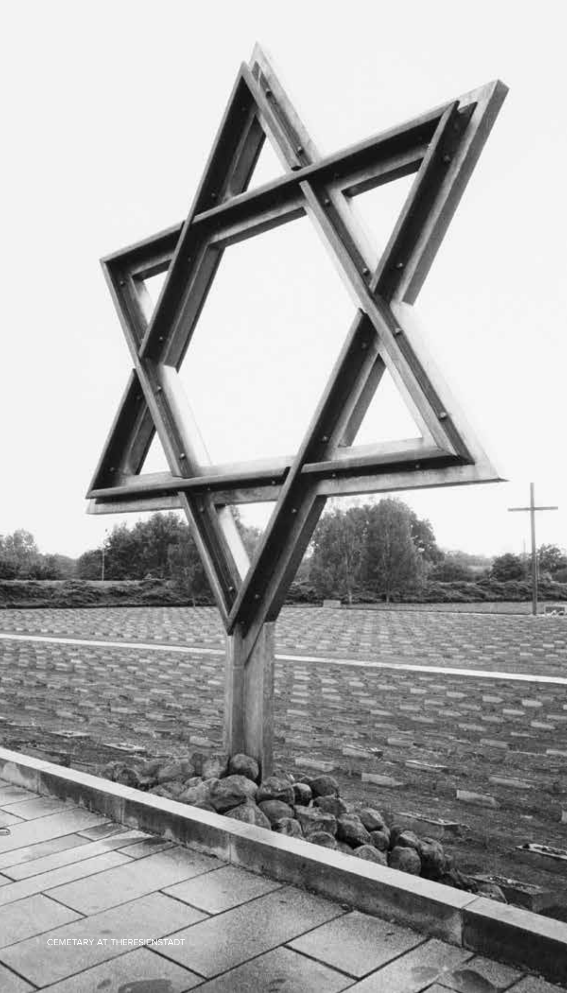
CEMETARY AT THERESIENSTADT