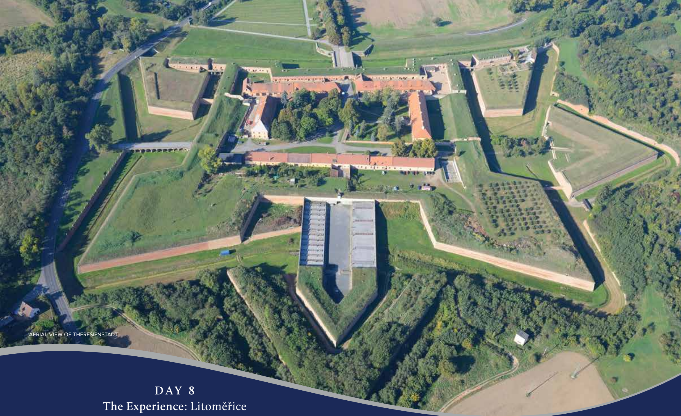
AERIAL VIEW OF THERESIENSTADT