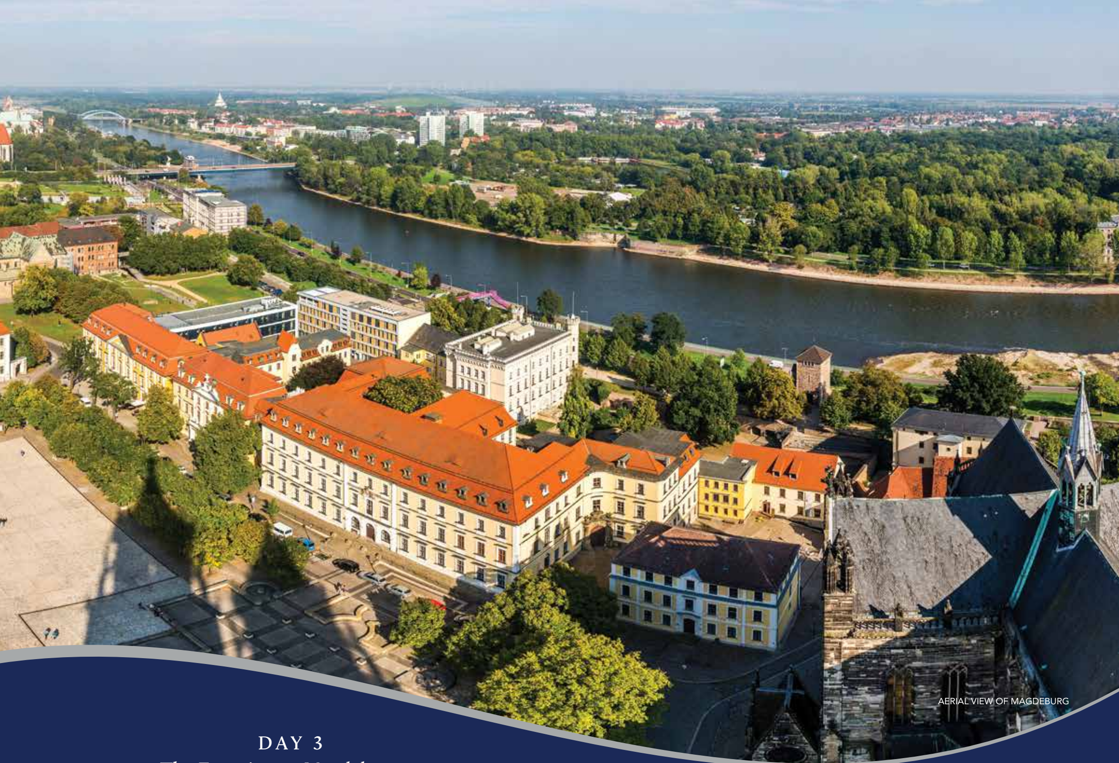
AERIAL VIEW OF MAGDEBURG