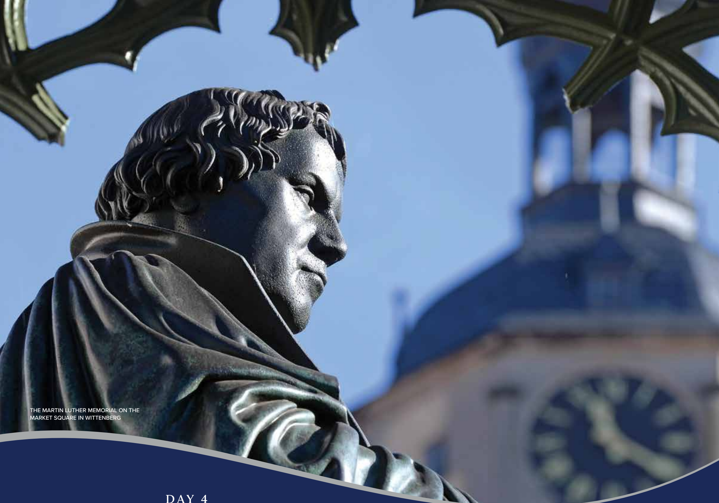
THE MARTIN LUTHER MEMORIAL ON THE MARKET SQUARE IN WITTENBERG