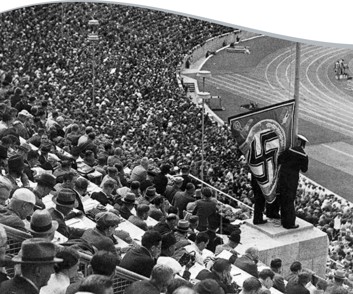
PHOTO: 1936 OLYMPICS

This custom-curated optional pre-cruise program in Berlin focuses on the city as both the center of the Third Reich and ground-zero for Cold War tensions. The program begins with a visit to the German-Russian Museum, located at the historic site of the surrender of the German Armed Forces on May 8, 1945 in Berlin-Karlshorst. Visit the Reichstag, home of German Parliament, and enjoy an included lunch. In the afternoon, explore the Olympic Stadium, home of the 1936 Olympics, and visit the Allied Museum in the heart of the former American Sector. The following day, uncover the city's Cold War history with stops along the remains of the Berlin Wall and at the Checkpoint Charlie Museum. See how items as small as a broken javelin or pages from a school textbook could symbolize Cold War tensions almost as strongly as the massive and tightly guarded Berlin Wall. Board MS Elbe Princesse after the second day of touring. Accommodations: Sofitel Berlin Kurfürstendamm