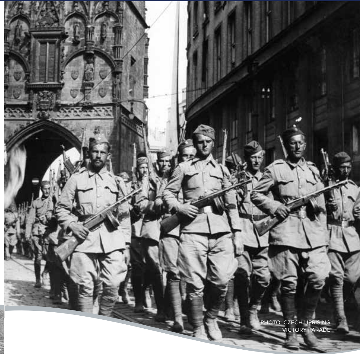
PHOTO: CZECH UPRISING VICTORY PARADE