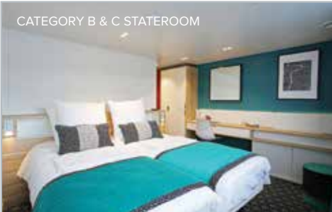
CATEGORY B & C STATEROOM