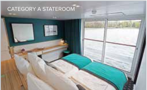
CATEGORY A STATEROOM

All staterooms are equipped with a flat-screen satellite television, hair dryer, mini-safe, desk, make-up mirror, closet with storage, and a private bathroom with shower. Each stateroom is also equipped with individually controlled heating and air conditioning to ensure your personal comfort throughout the cruise. The vessel is not outfitted with an elevator.