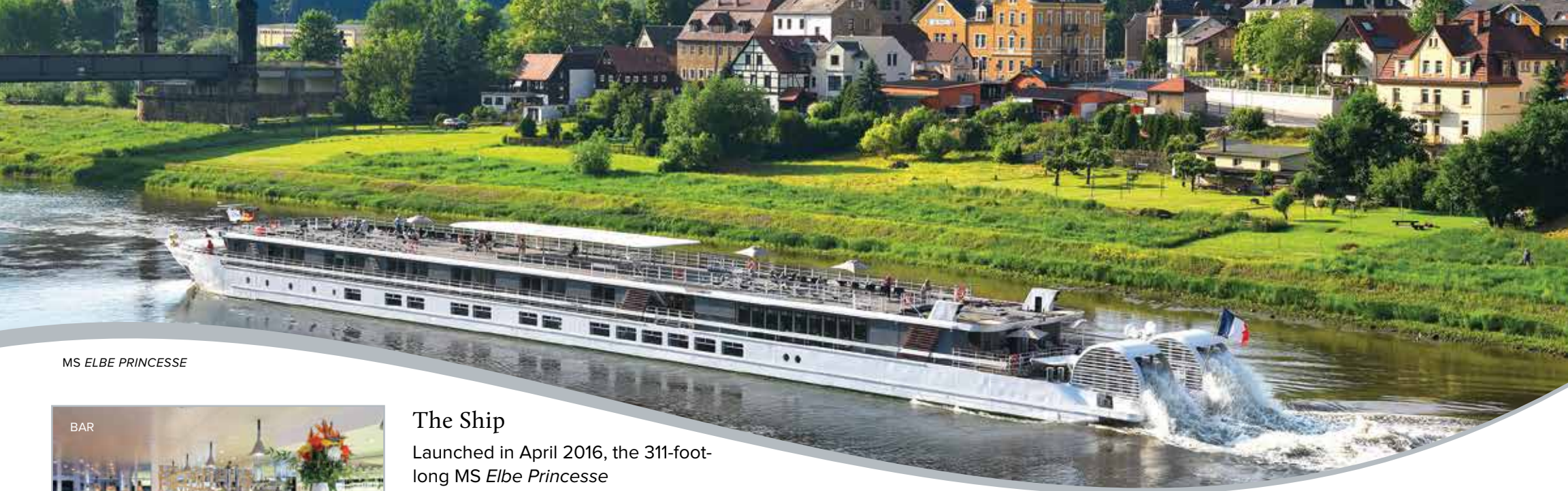
MS ELBE PRINCESSE