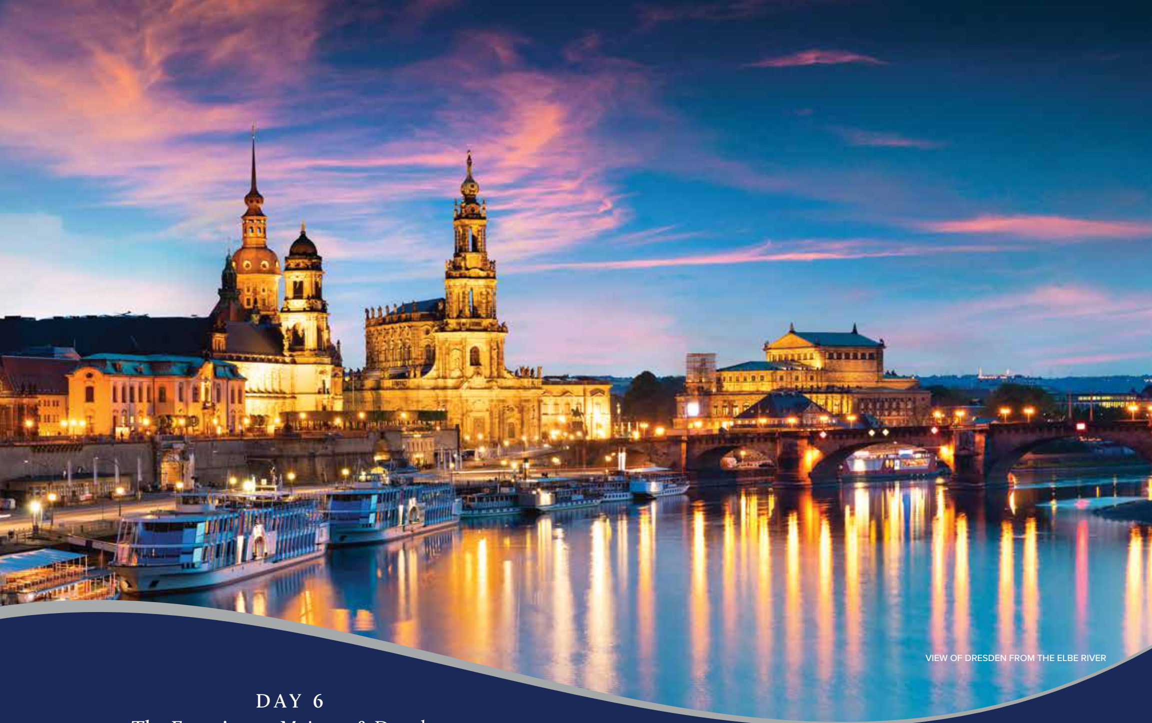
VIEW OF DRESDEN FROM THE ELBE RIVER