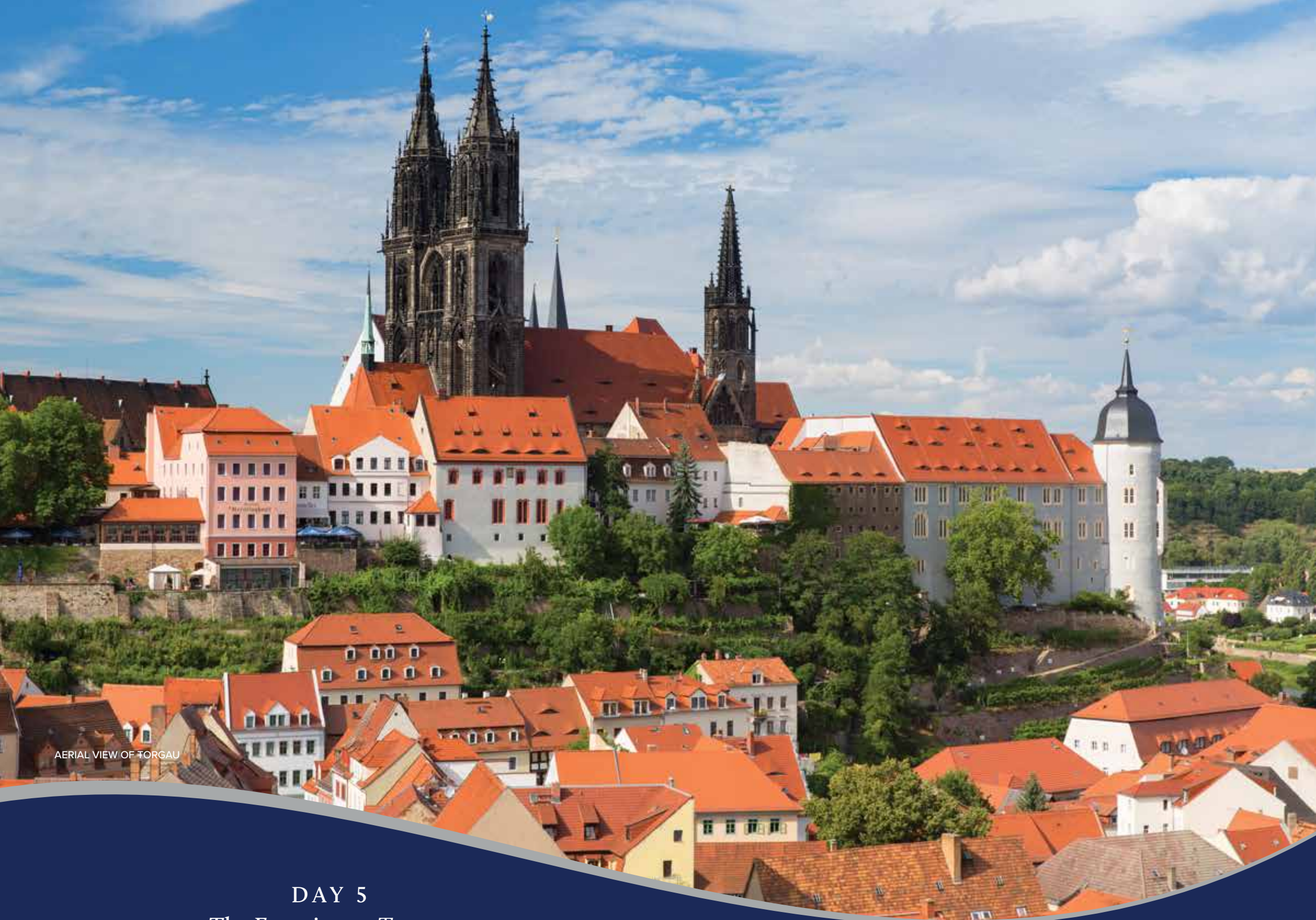
AERIAL VIEW OF TORGAU