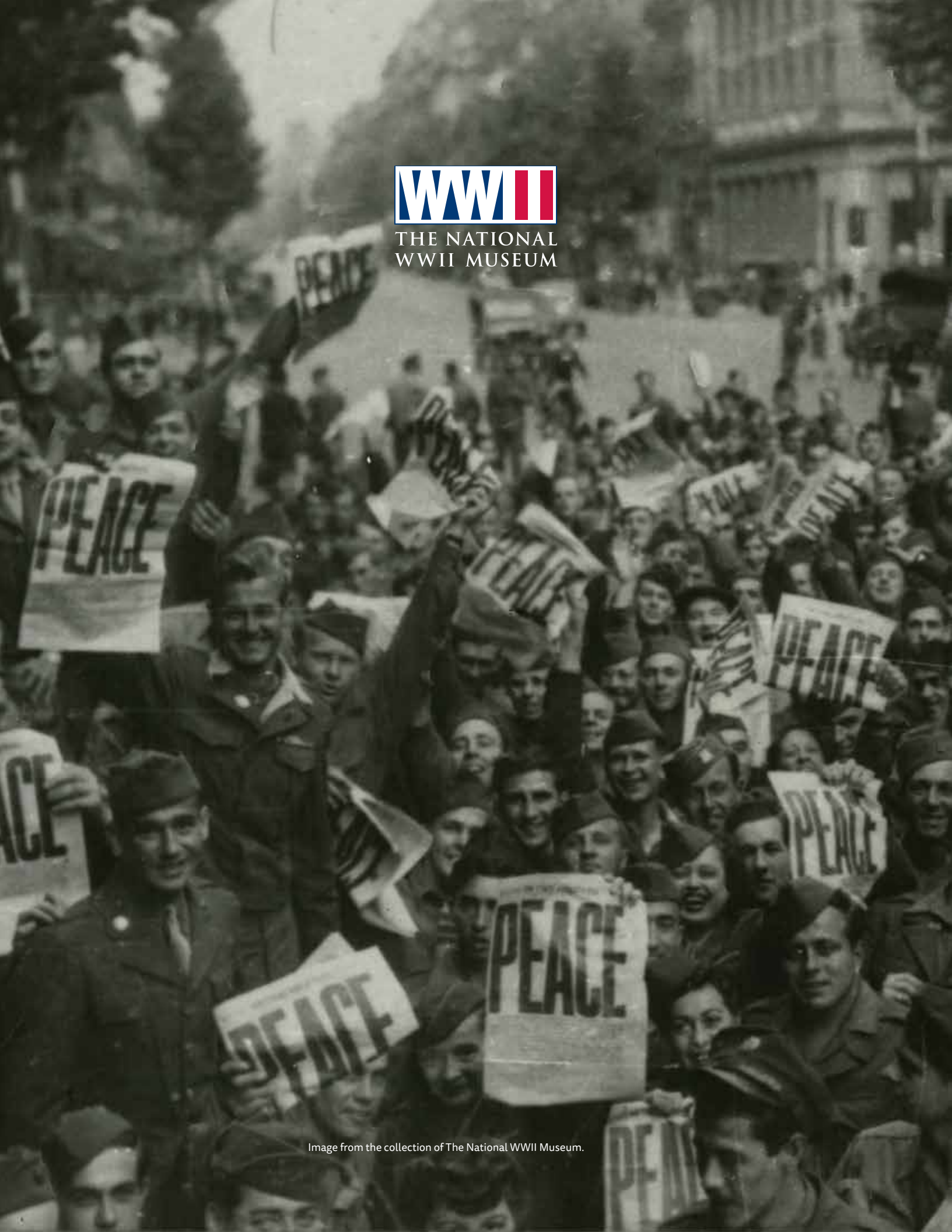
Image from the collection of The National WWII Museum.