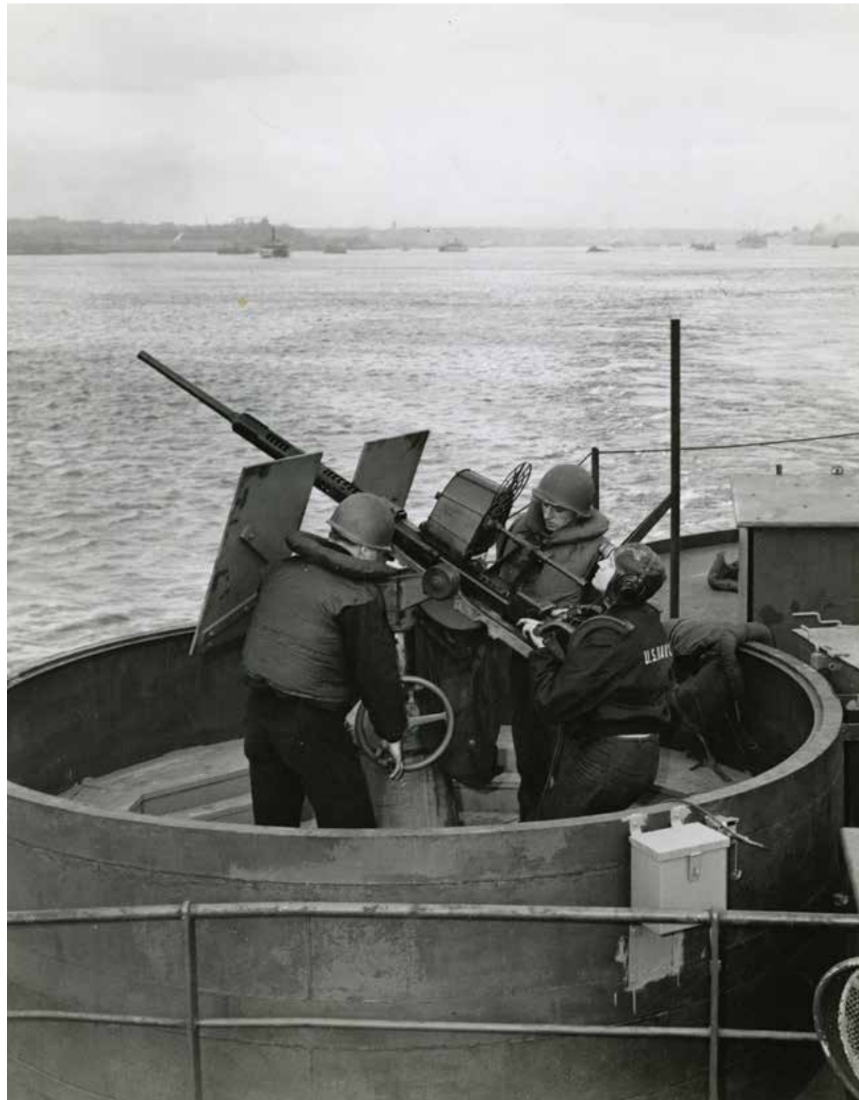
An armored gun crew mans a 20mm anti-aircraft gun aboard a merchant vessel.