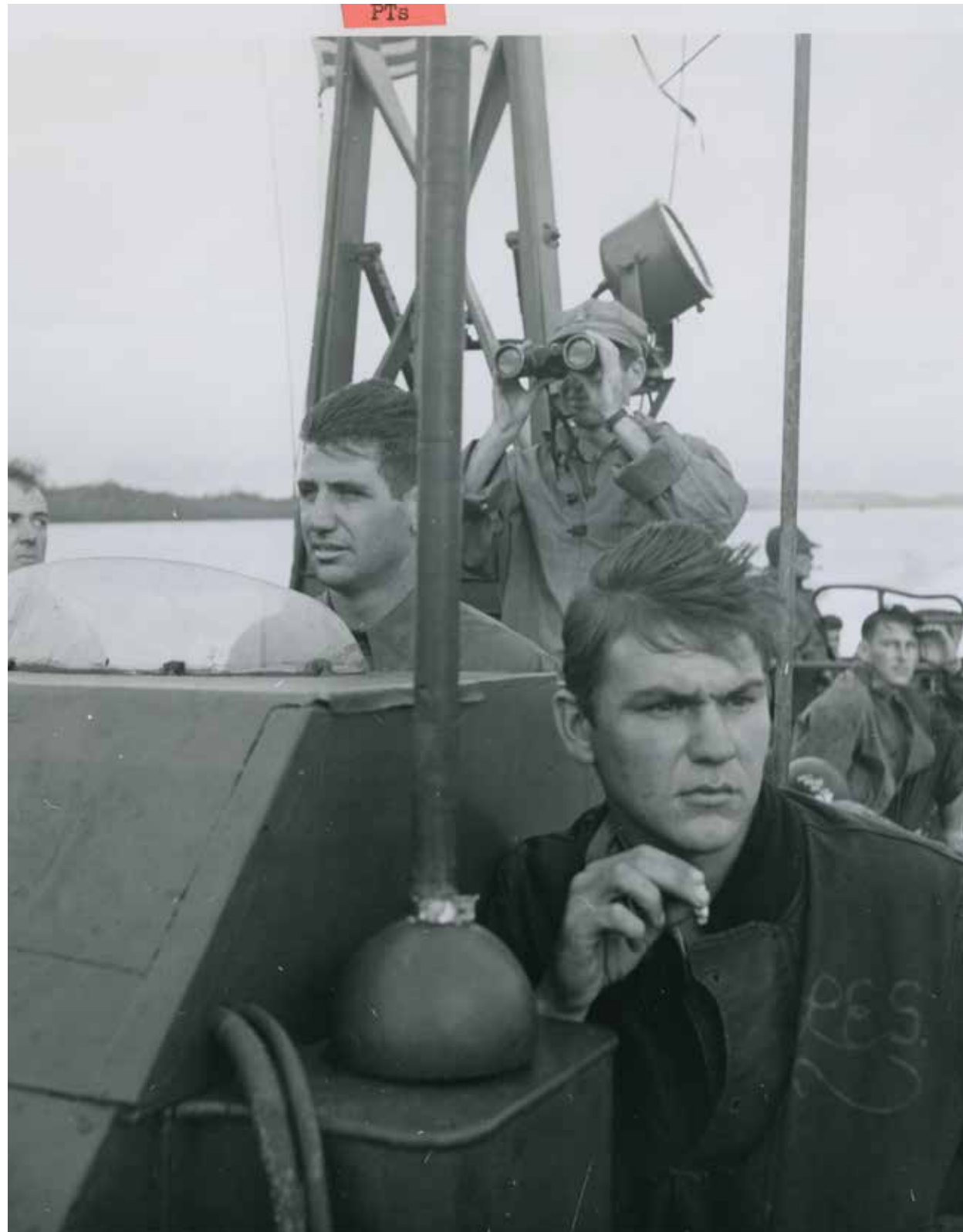
Sailors aboard a Patrol Torpedo boat in the Pacific during operations in the Philippines in late 1944.