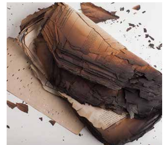
Burned personnel records at the NPRC.

What does this mean for those filing record requests? Sometimes there will be no record available. In other cases, information can be pieced together from damaged or auxiliary records, reconstructing some service information. Preservationists in St. Louis are still working to recover information from damaged records. Depending on the condition of the documents you are requesting, there may be a delay in delivery of the records.