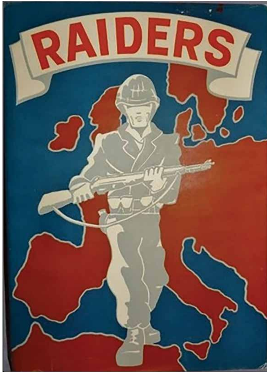
Above is the cover of the unit history for the 47th Infantry Regiment, known as the Raiders. This unit history was printed in southern Germany after the war.