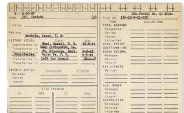
Above: Index card in the WWII Alien Enemy Detention and Internment Case Files, an example of the cards found in the World War II Japanese Internee Cards collection.

The National Archives does not hold copies of civilian company records. If you are looking for the employment records of an individual who worked for a civilian company, those records may still be in the possession of that company. In many cases, those records no longer exist. For example, the records of employees at Higgins Industries in New Orleans were destroyed after the company was sold in 1959.