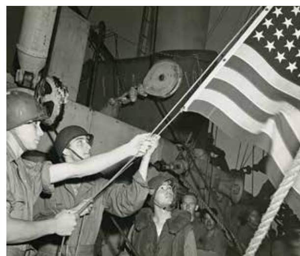
Top photo: Sailors aboard USS Rutland off Ulithi in May 1945 during a ship's inspection. Bottom right: US Coast Guardsmen raise an American flag aboard a Coast Guard transport during the invasion of Sicily, 1943.

Army units maintained a historical narrative of their experiences. Many of these were published in limited numbers after the war. Also, some Marine Corps unit histories are available in print. These may be available at local libraries or sold online.