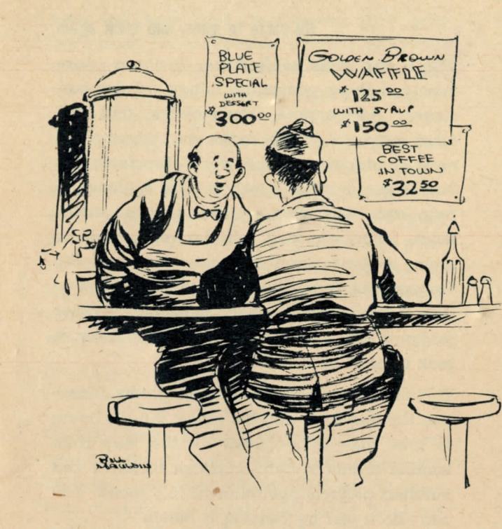
"Th' blue plate's $295 fer discharged sojers—that leaves ya $5 fer th' street car..."

This leaflet is written to tell you what the score is. Read it and keep it, and save yourself money and extra trouble.