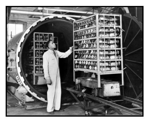
Penicillin production at pharmaceutical company, Eli Lilly.

Florey and Heatley ended up in Peoria, Illinois to work with researchers who had perfected the fermentation process necessary for growing penicillin. The researchers in Peoria used corn instead of glucose, or simple sugar, as the nutrient source, and the penicillin grew approximately 500 times more than it had in England! The team searched for more productive strains of Penicillium notatum , finding the best specimen growing on an over-ripe cantaloupe in a Peoria grocery store.